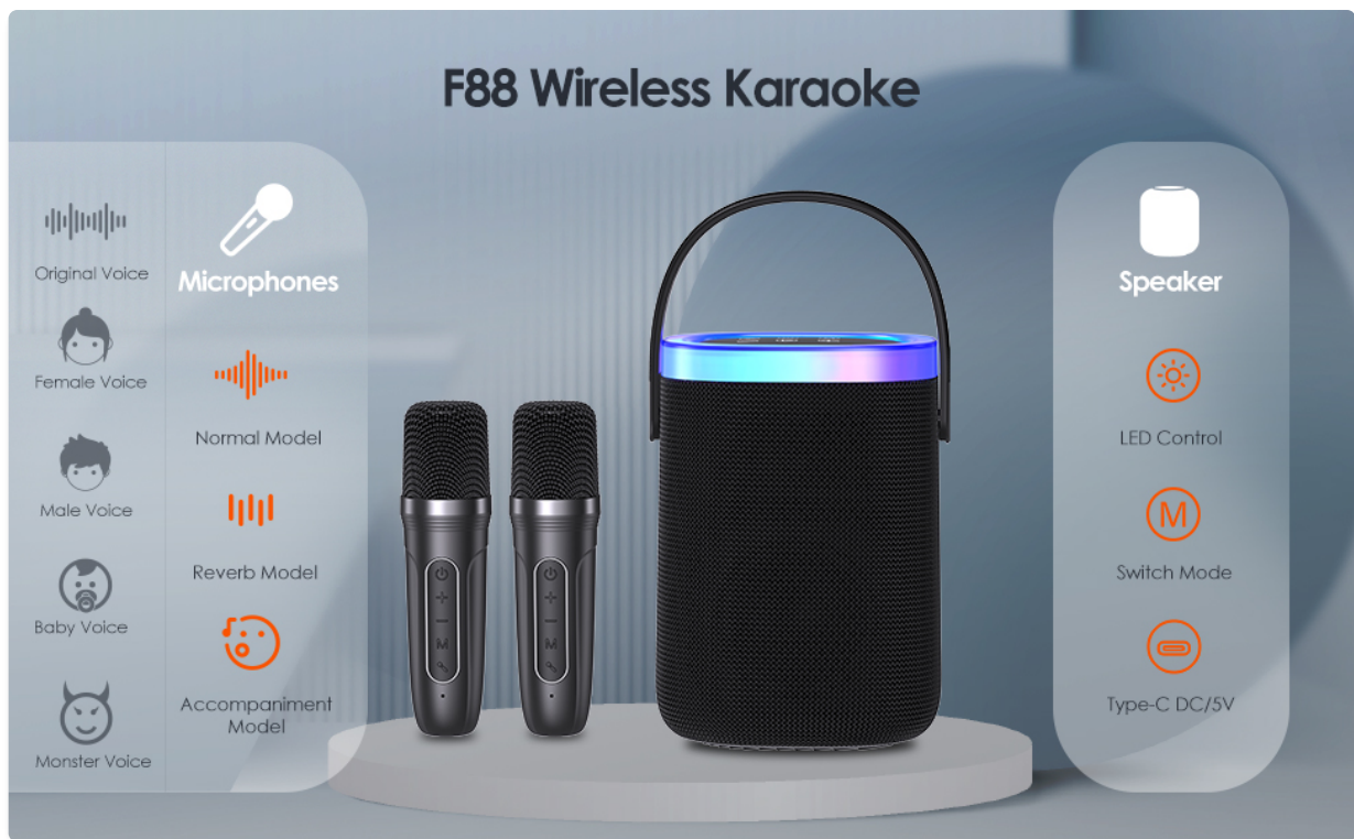
Image 2: The LENRUE F88 speaker, two microphones, and included cables.