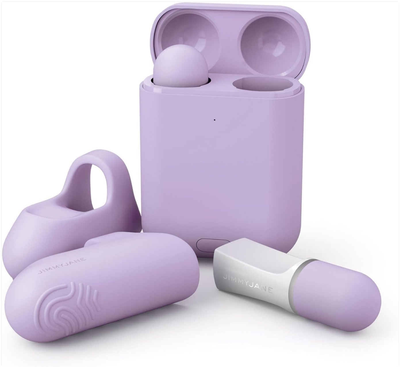
Individual components of the Hello Touch Pro: two finger vibrators, the charging case, and two silicone finger sleeves.