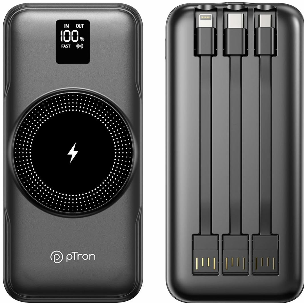
Figure 3.1: Front and Side View of the Power Bank. Shows the digital display, wireless charging pad on the front, and integrated charging cables (Type-C, Lightning, Micro USB) on the side.