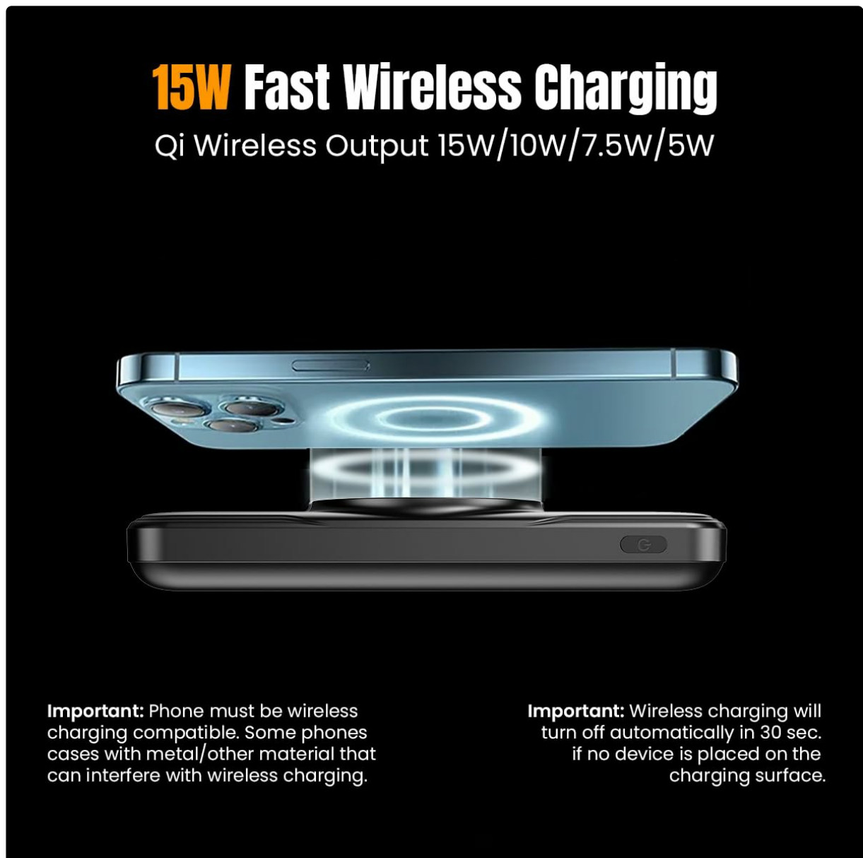
Figure 5.2: Wireless Charging. Shows a smartphone being wirelessly charged on the power bank's charging pad.

The power bank supports 15W Qi wireless charging: