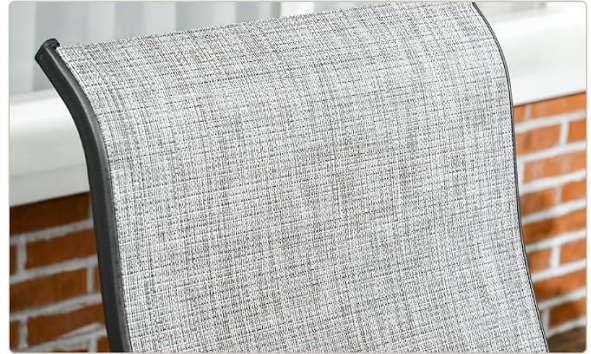
S" shape ergonomic design backrest

Image: Key comfort features including the curved armrest, wide seat, and ergonomic S-shaped backrest.