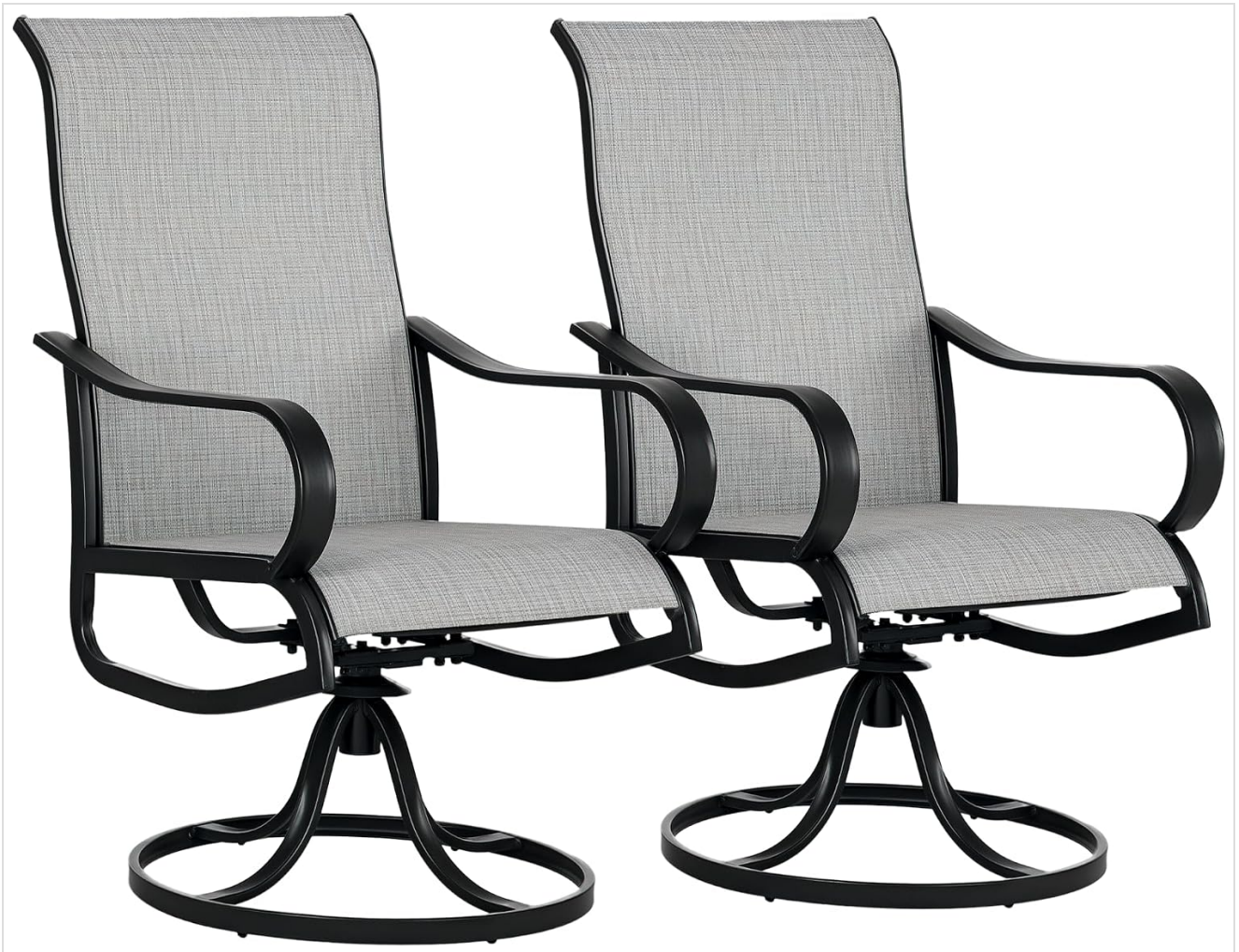
Image: Components of the Outsunny 2-Piece Swivel Patio Dining Chairs.