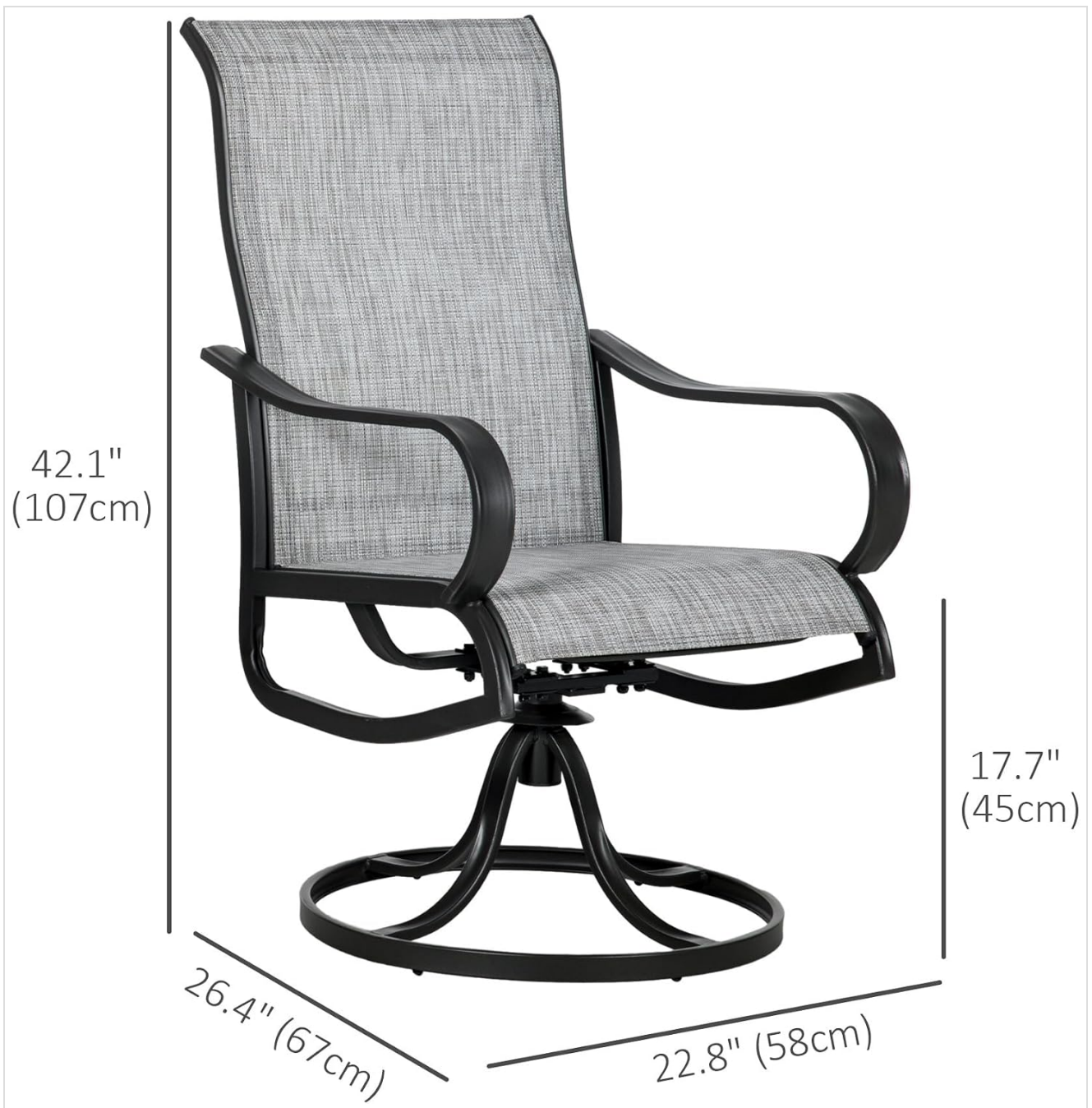
Image: Assembled chair with key dimensions (Width: 22.8", Depth: 26.4", Height: 42.1").