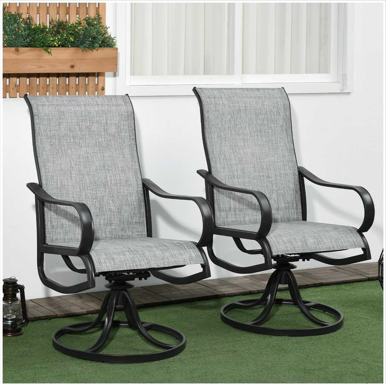
Image: Two fully assembled Outsunny patio chairs ready for use.