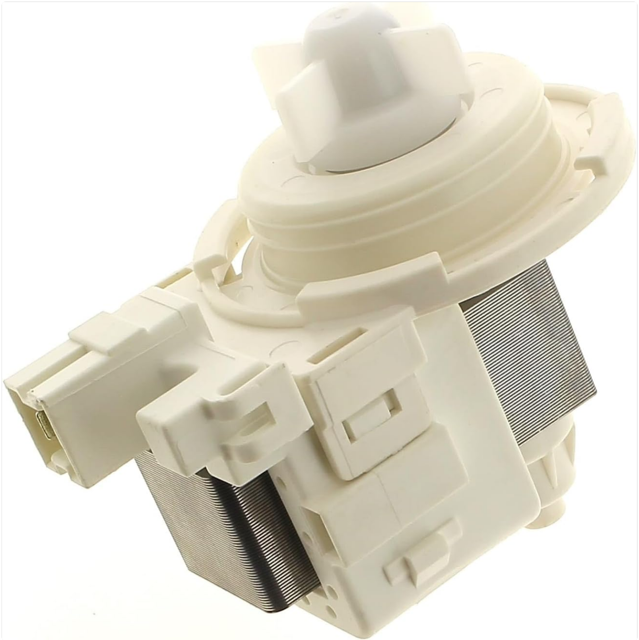
Figure 2: Angled view of the Adepem MSP 287258 Drain Pump, showing connection points.