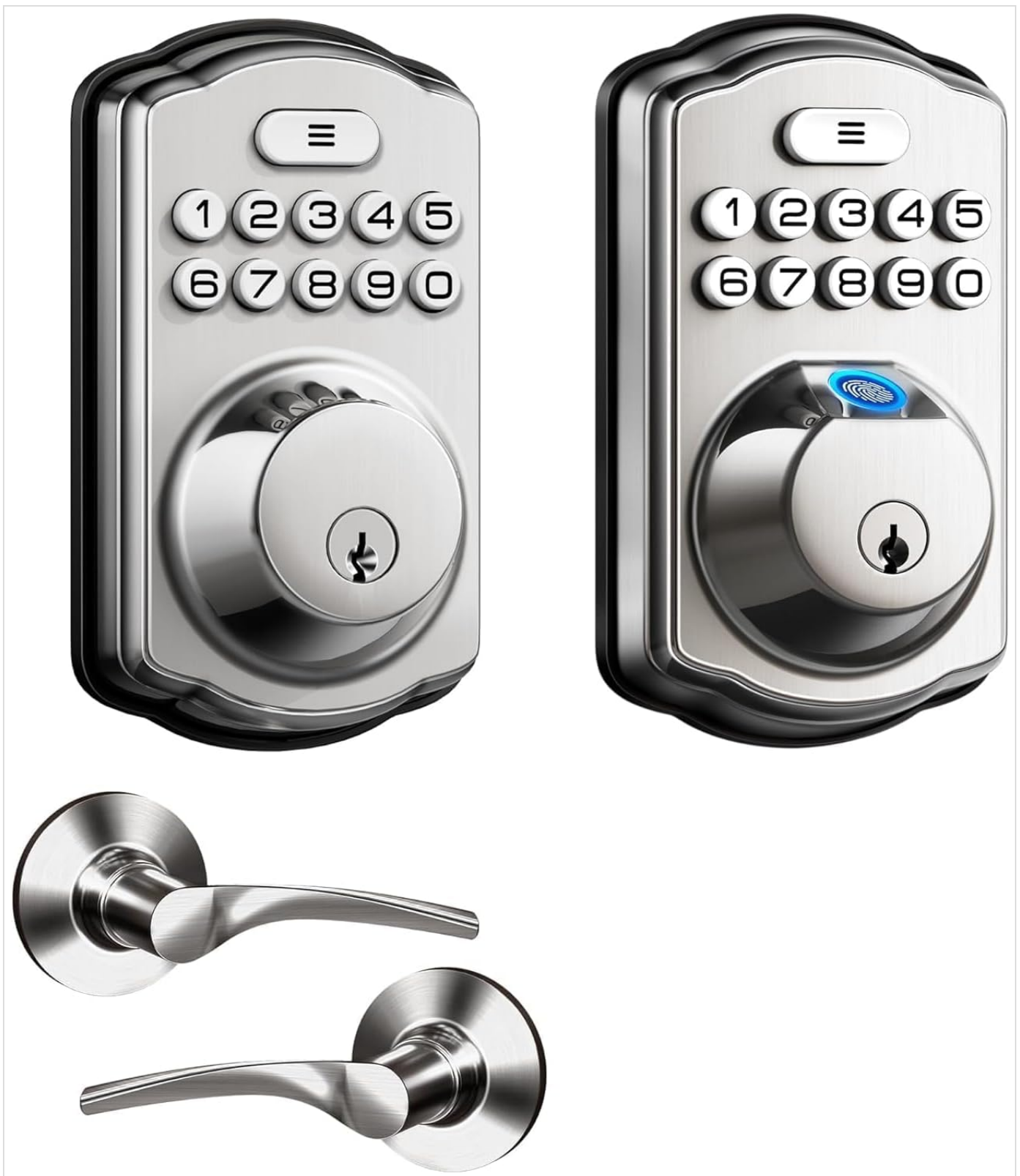
Image: The Veise Door Lock with Handle Set Bundle, showcasing the keypad deadbolt and the accompanying lever handles in satin nickel.