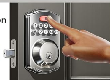
Image: A visual explanation of the auto-lock feature, which can be set for 10-99 seconds, and the one-touch lock feature, activated by pressing any button for 2 seconds.