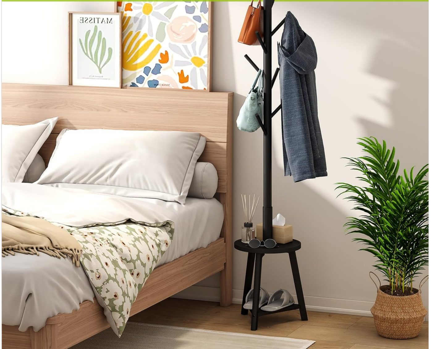
Image: The coat rack positioned in a bedroom, illustrating its functionality for organizing clothing and accessories.