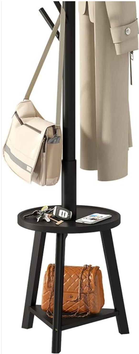
Image: The BMOSU Freestanding Bamboo Coat Rack, showcasing its design with multiple hooks, a round storage tray, and a lower triangular shelf.