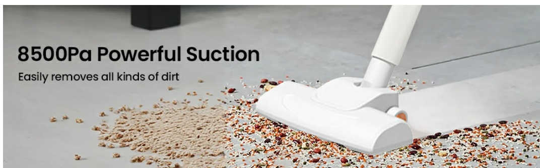
Image 5.3: The vacuum's powerful suction effectively removes various types of dirt.