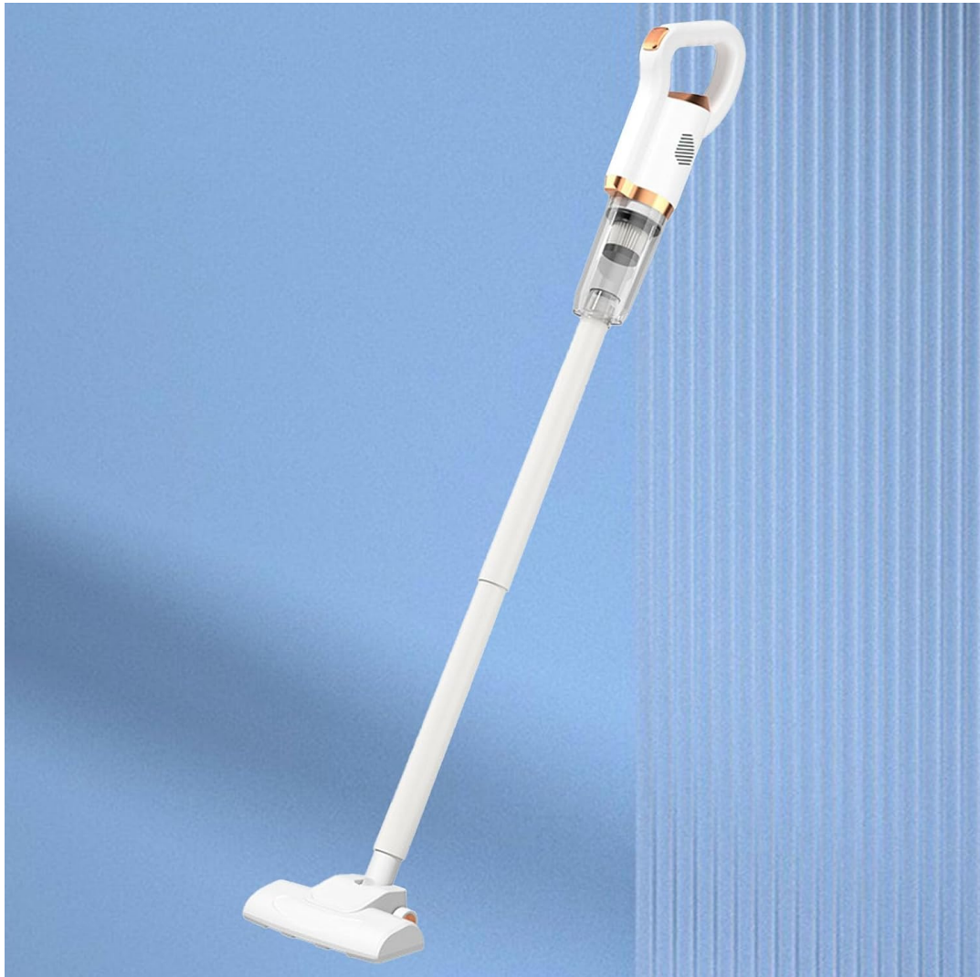
Image 5.2: Handheld mode is ideal for cleaning furniture and hard-to-reach areas.

Detach the extension wand to convert the unit into a handheld vacuum. Attach the crevice tool for narrow spaces, corners, or car interiors. Use the brush attachment for upholstery, curtains, or delicate surfaces.