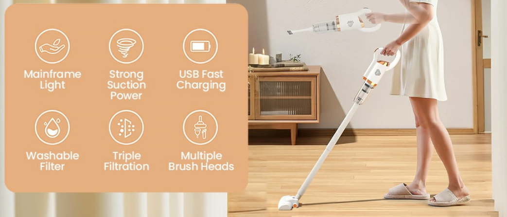
Image 1.1: Overview of the Pwshymi Cordless Vacuum Cleaner's key features.

Vacuuming and mopping in one, easy to cleaning