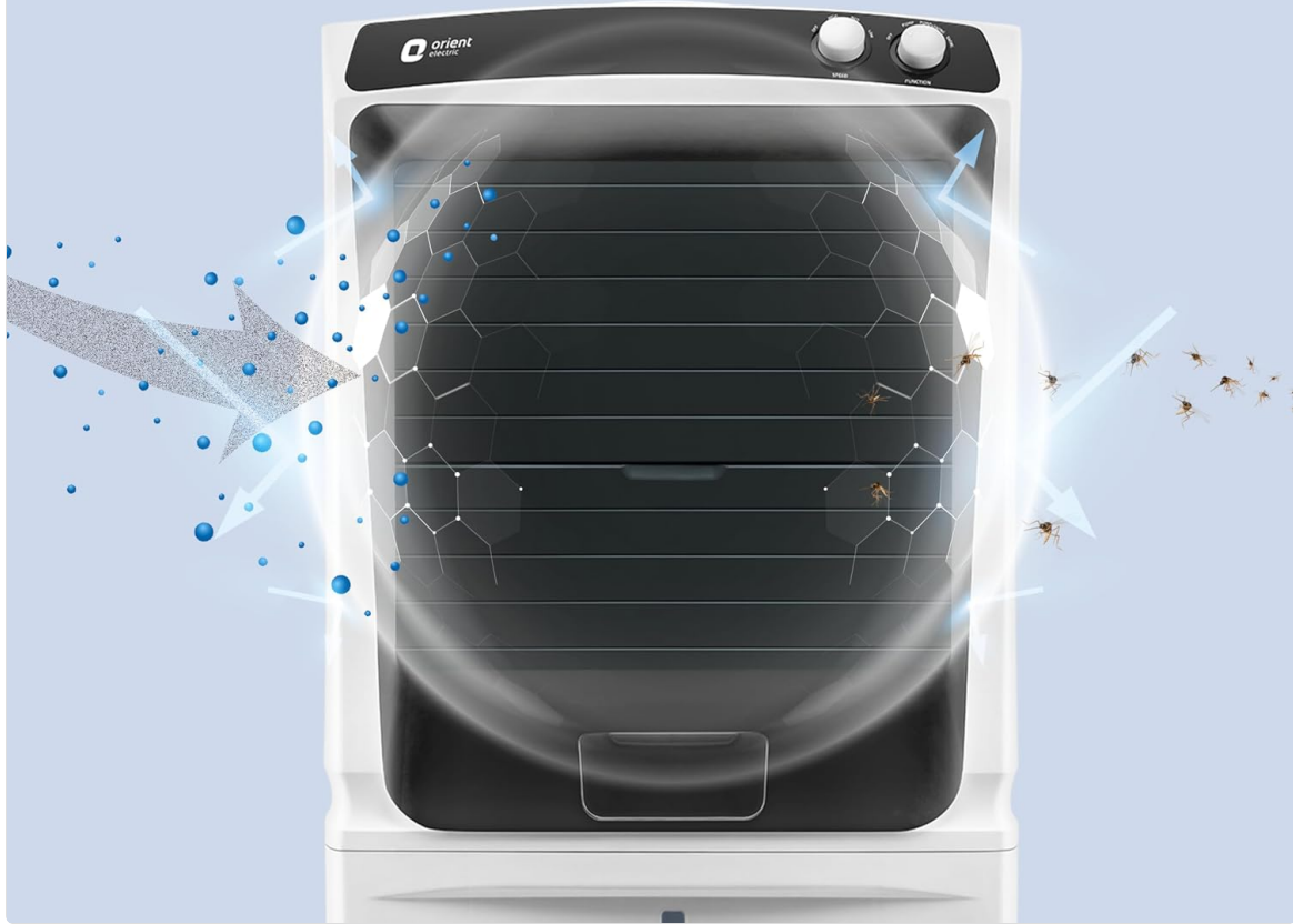
Image: A visual representation of the collapsible louvers preventing dust and insects from entering the cooler.