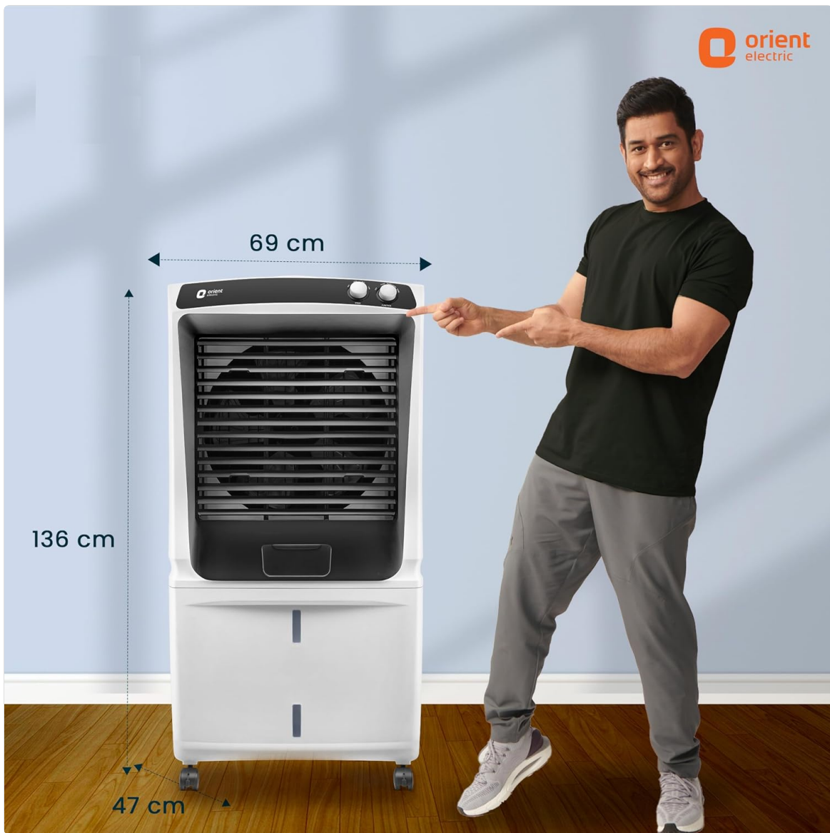
Image: The air cooler displaying its physical dimensions.