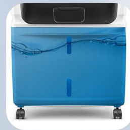
Water level indicator