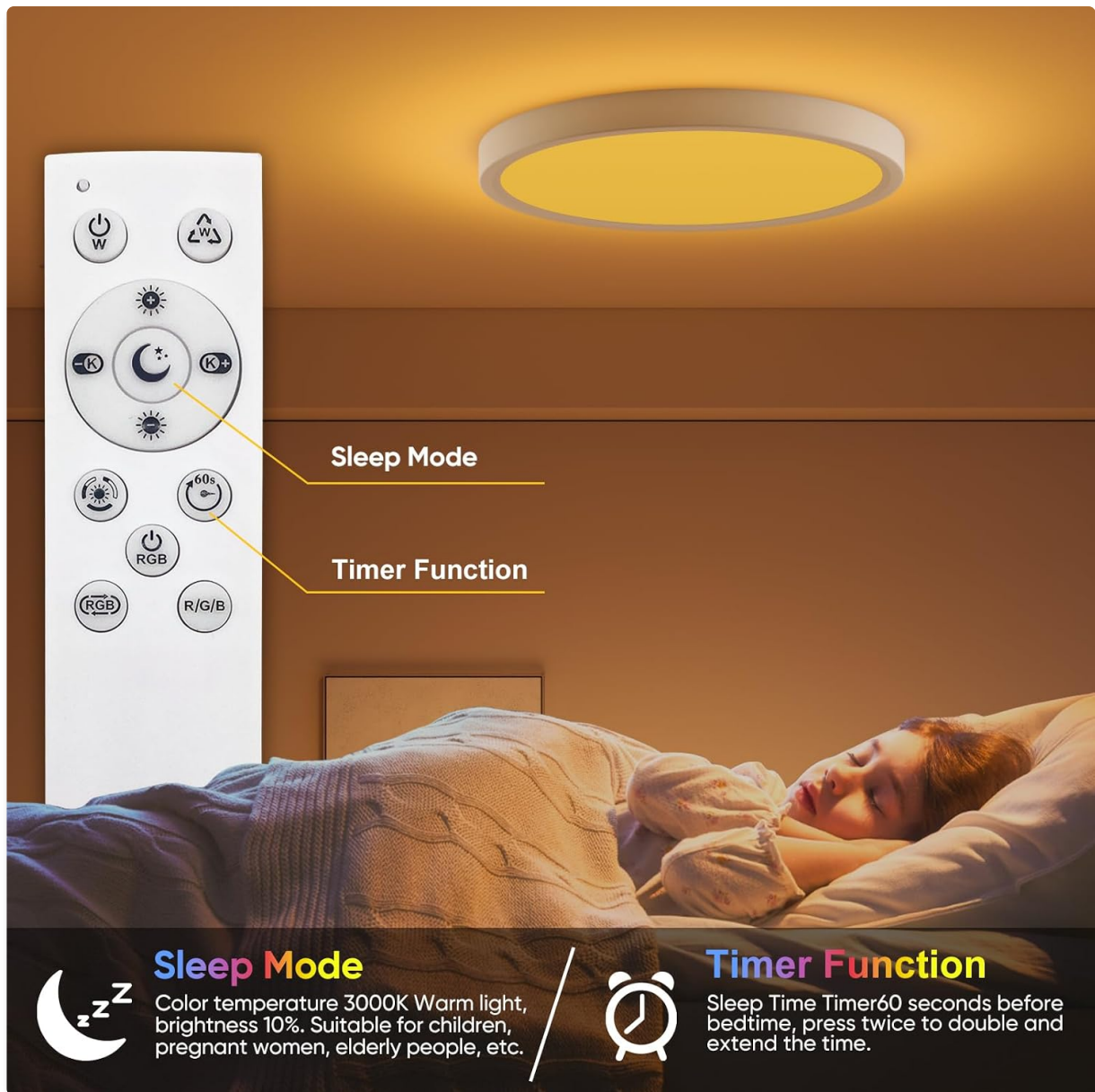
Image 7: Illustration of the sleep mode (3000K warm light, 10% brightness) and timer function (60 seconds before bedtime).