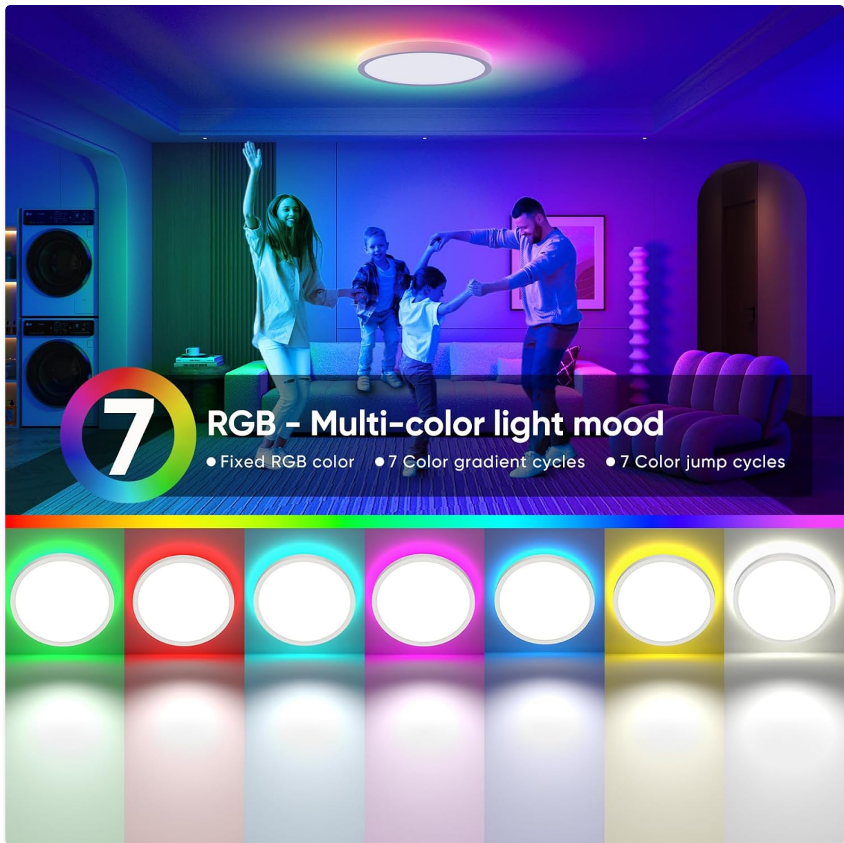
Image 6: Display of 7 RGB multi-color light moods, including fixed colors, gradient cycles, and jump cycles.