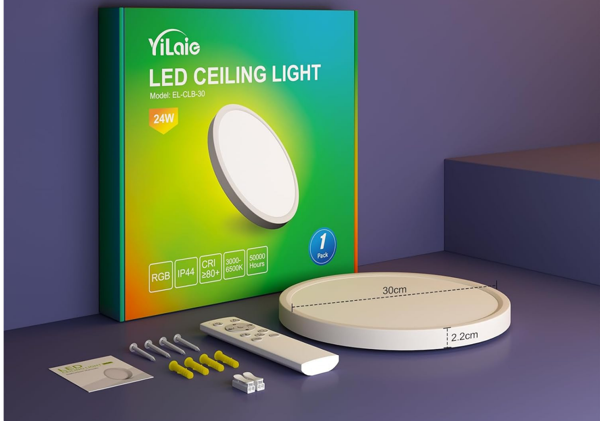
Image 2: Contents of the product package, including the ceiling lamp, remote control, and mounting hardware.

Plastic Screw x4 Cable connector x1 Quick start manual x1