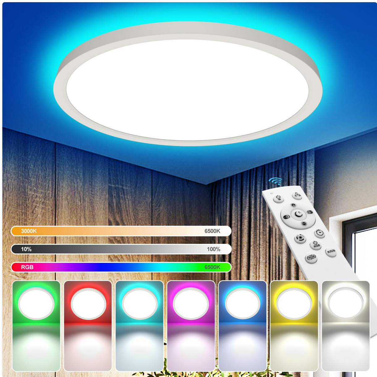
Image 1: YiLaie 24W RGB Dimmable LED Ceiling Light with remote control.