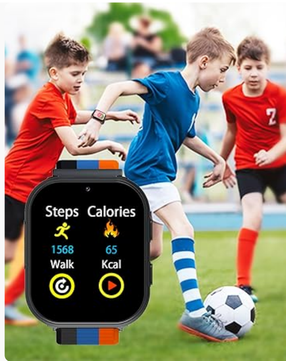
Figure 5: The pedometer feature on the smartwatch, encouraging activity by tracking steps and calories.