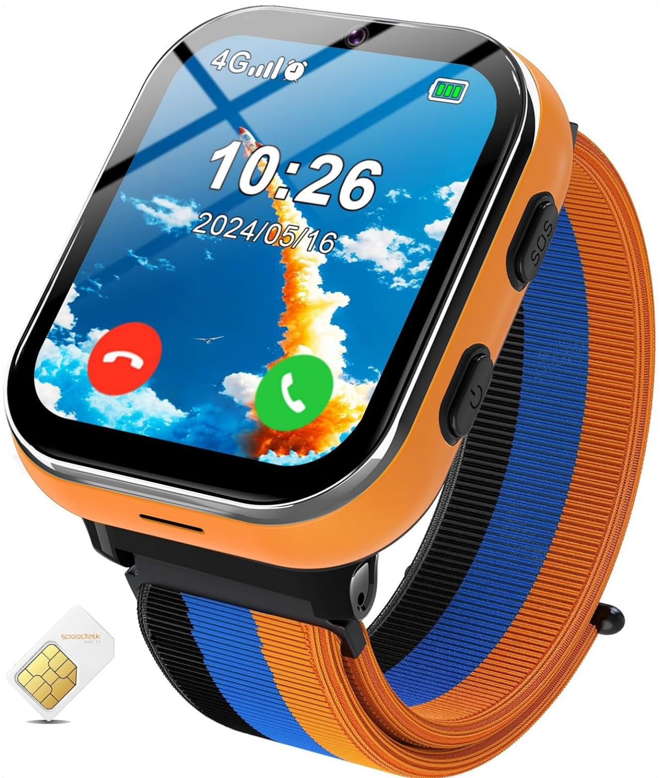
Figure 1: The AYATAHA LT49 Kids Smartwatch in orange, showcasing its vibrant design and included SIM card.