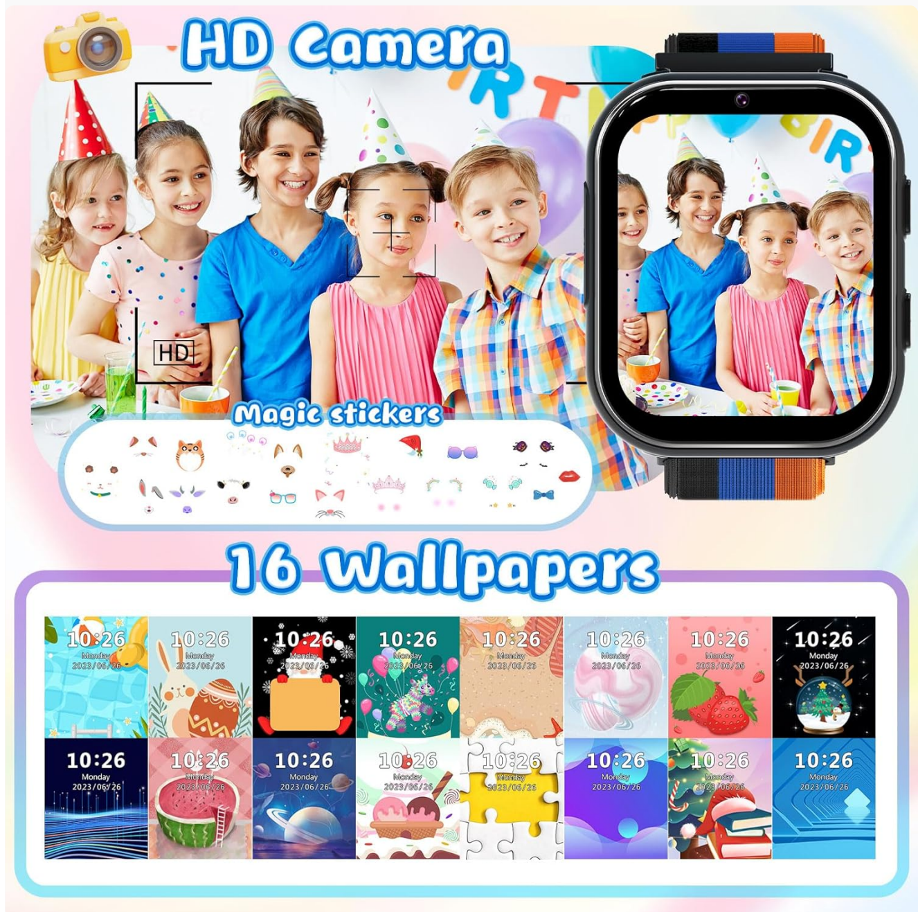
Figure 3: The smartwatch display showcasing various customizable wallpapers and the HD camera feature with fun magic stickers.

The smartwatch features a touch screen for easy navigation. Swipe left or right to browse through applications and tap on icons to open them. The watch also supports various bright and colorful backgrounds that can be customized.