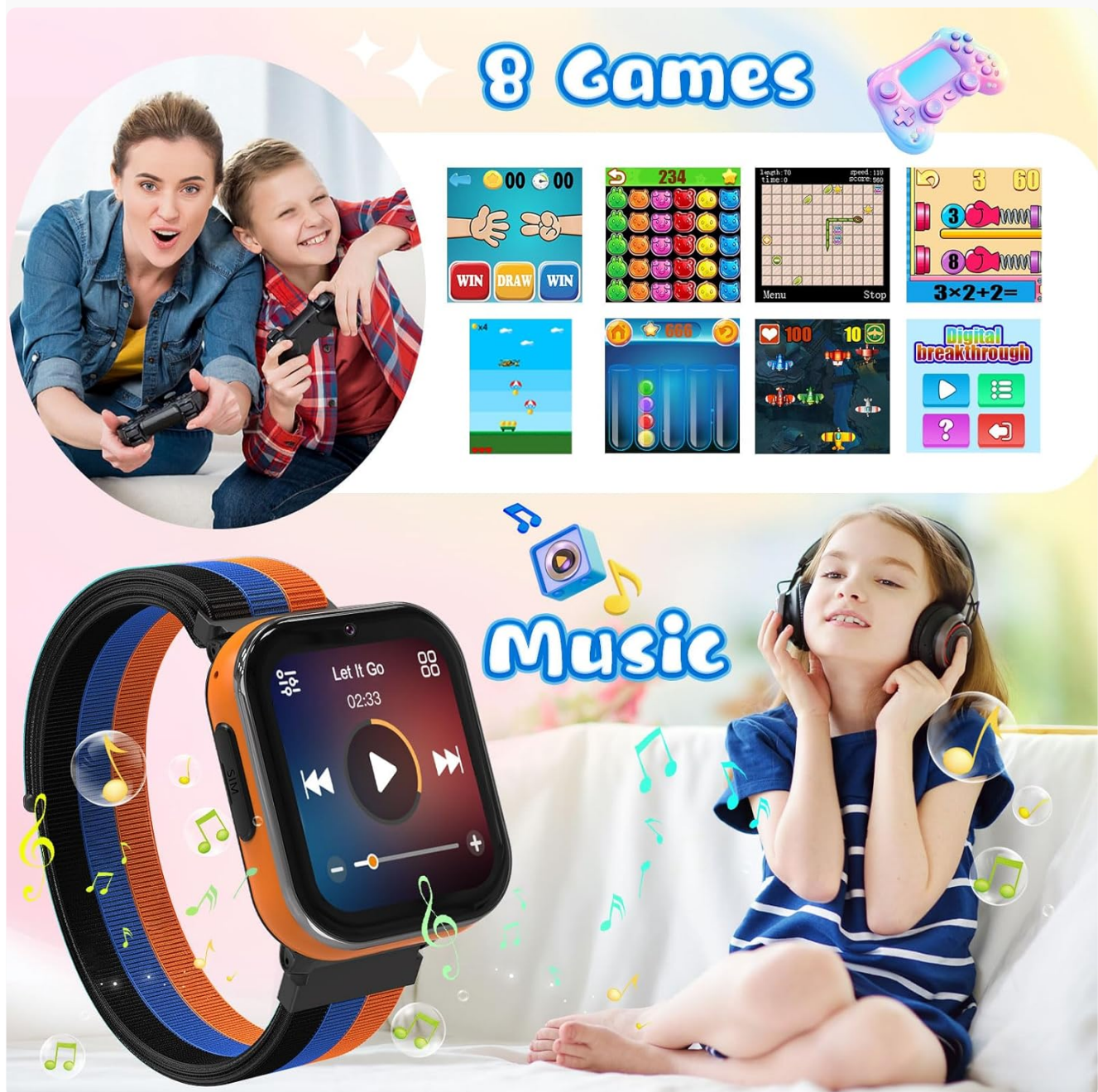
Figure 4: The smartwatch features a selection of engaging games and a music player for entertainment.

The watch comes with several built-in games designed to exercise logical thinking, reaction ability, and hand-eye coordination. Parents can set limits on play time to ensure a balanced experience.