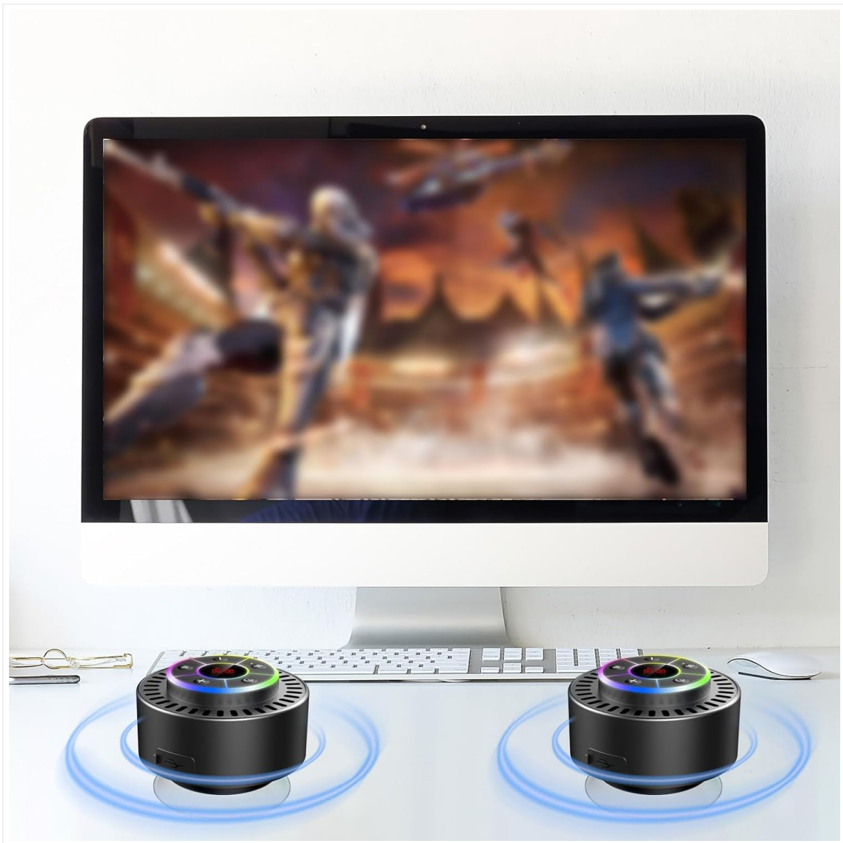
Image: Two Docooler speakers wirelessly connected to a computer, illustrating the True Wireless Stereo (TWS) feature.