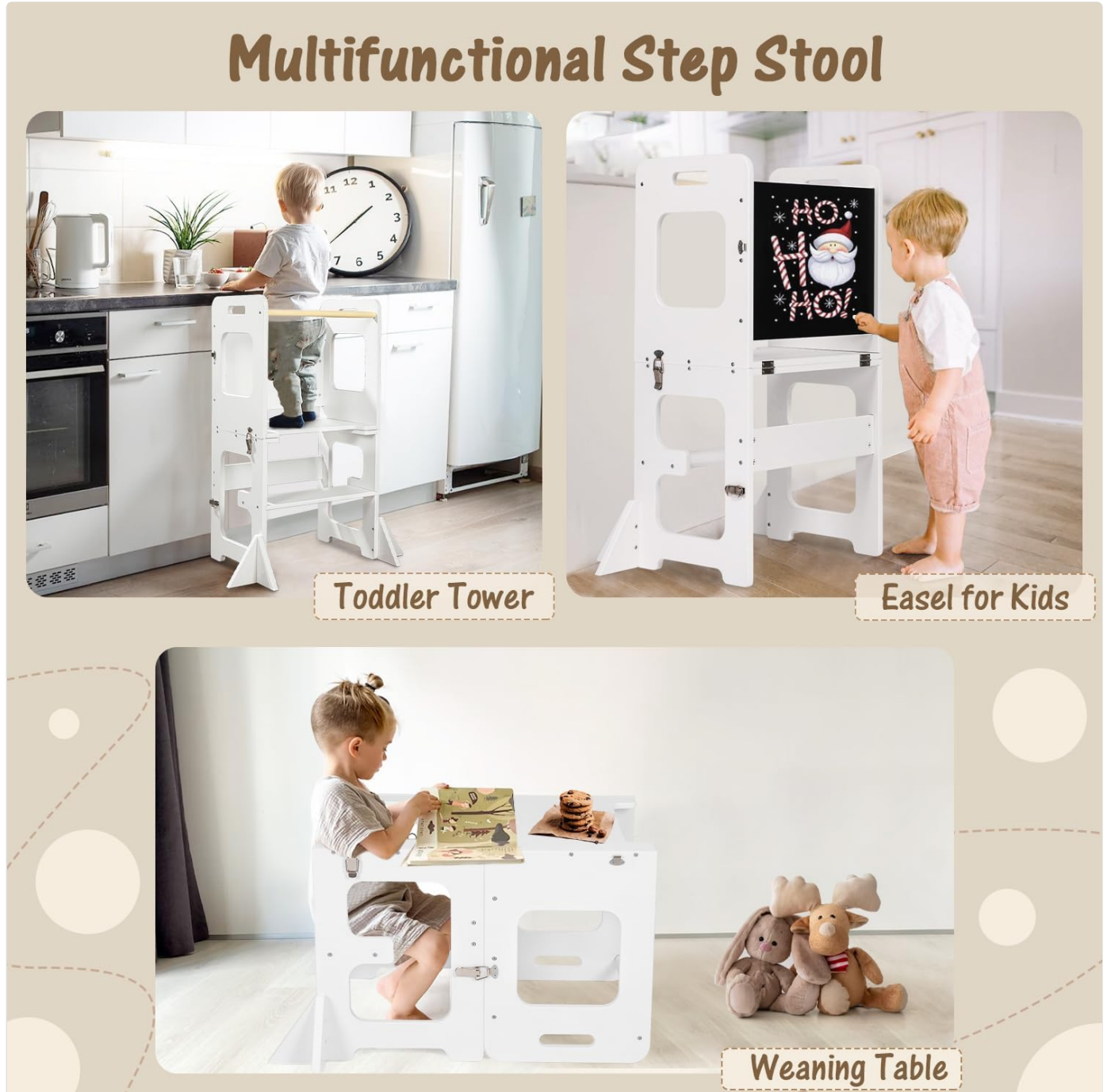
Figure 3: Multifunctional Use. This image displays the learning tower configured as a toddler tower, an easel, and a weaning table, demonstrating its versatility.

In this mode, the tower allows your child to safely reach counter height, enabling them to participate in kitchen activities, wash hands at the sink, or engage in other elevated tasks. Ensure the safety rail is in place and securely fastened.