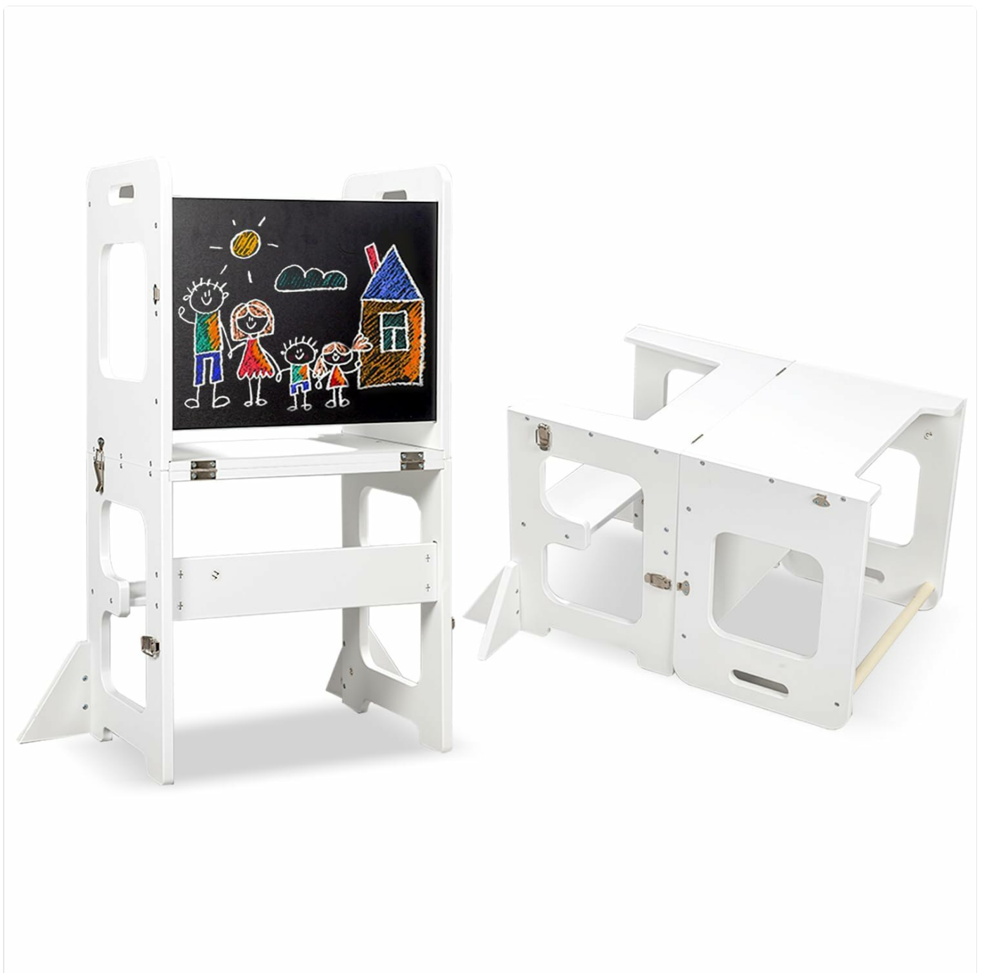
Figure 2: Transformation Steps. This image demonstrates how to convert the learning tower into a kids' desk by unlocking buckles,

Note: While the product description states "Assemblage requis: Non" and "À assembler: Non", the product features and visual instructions indicate that some initial setup or transformation steps are required for its various functionalities. The term "easy to install" suggests a straightforward assembly process.