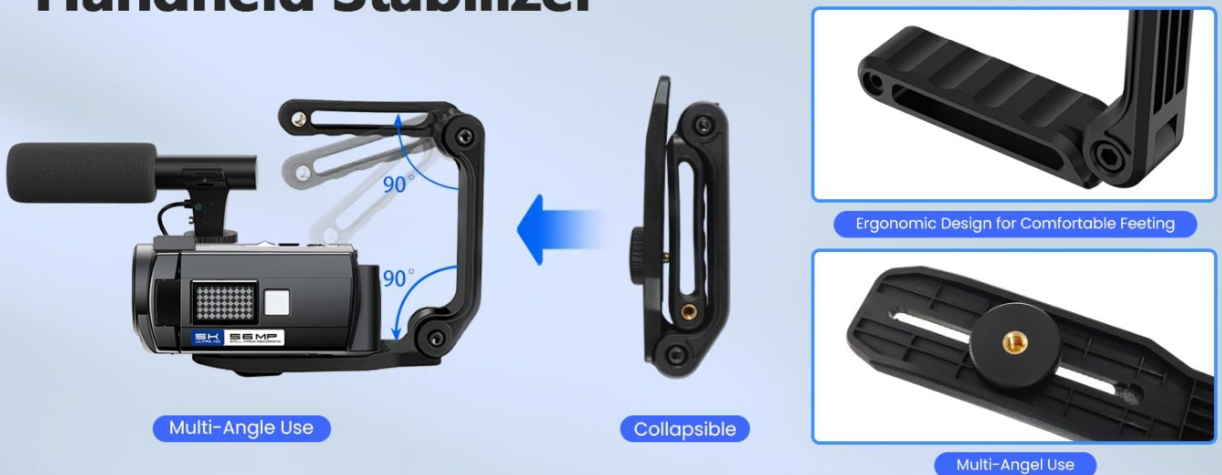
Image: Demonstrates the adjustable mini tripod in both folded and extended positions. Below it, the handheld stabilizer is shown, highlighting its collapsible and ergonomic design for comfortable use.