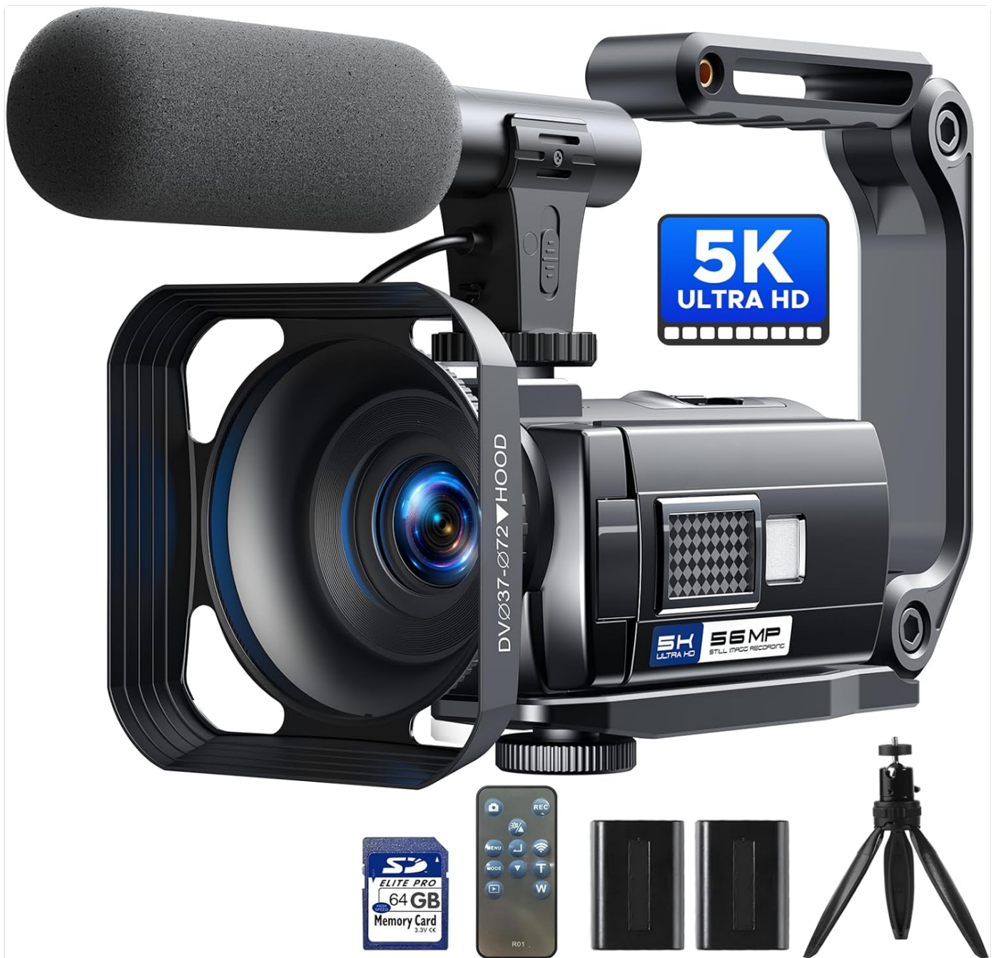
Image: The CAMWORLD 5K 56MP Camcorder shown with all its included accessories, such as the microphone, lens hood, tripod, batteries, SD card, and remote control.