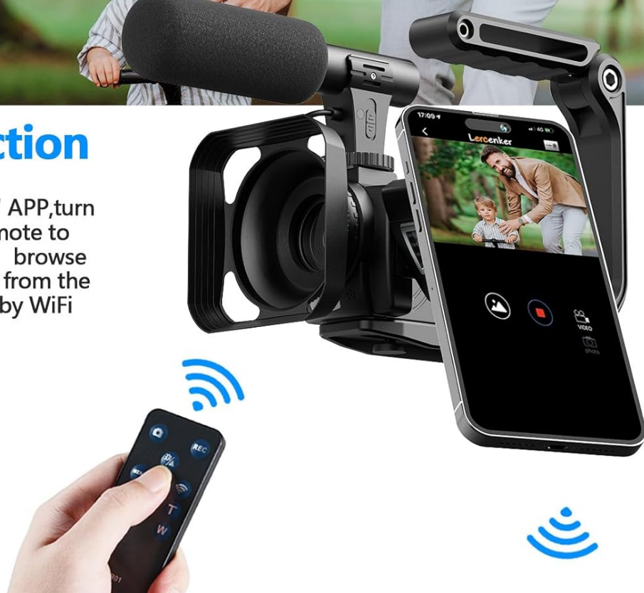
Image: The camcorder with the external microphone attached, demonstrating its position on top of the device. A remote control is also shown, indicating its use for camera operation.