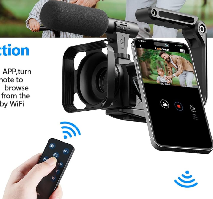
Image: Shows the camcorder with a smartphone displaying the "Lercenker" app interface, indicating remote control and file transfer capabilities via WiFi. QR codes for Android and iOS app downloads are also visible.