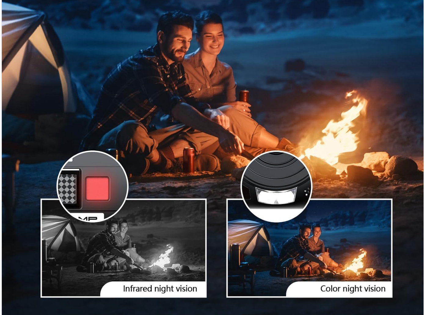
Image: Comparison of infrared night vision (black and white) and color night vision, demonstrating the camcorder's ability to capture clear images in low-light conditions using different night vision modes.

Clear images and videos in 2 Night Vision Modes