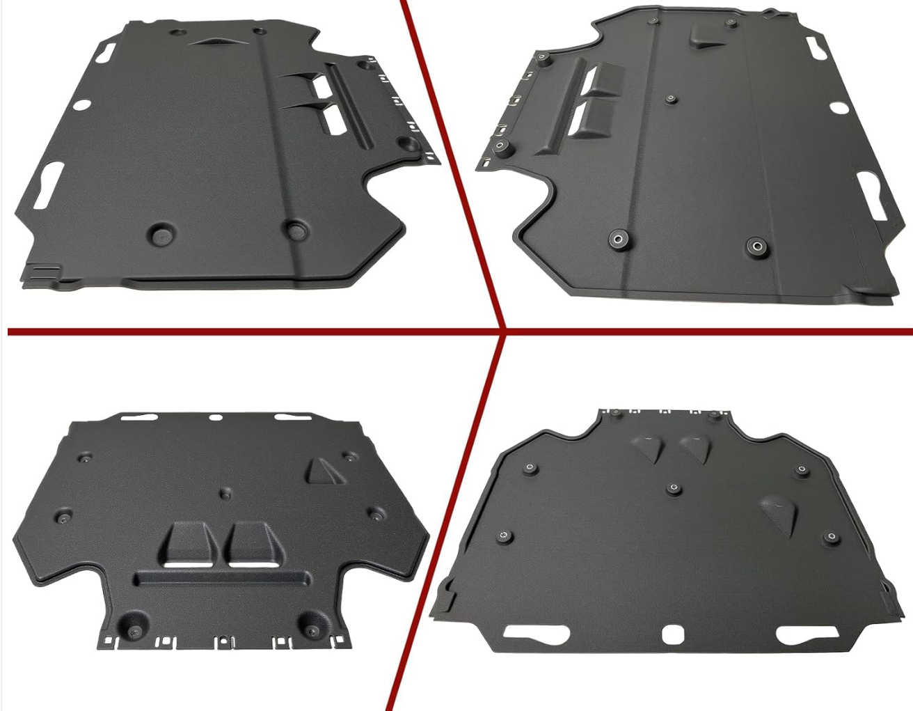
Figure 5.1: Various views of the splash guard highlighting mounting points.

Your browser does not support the video tag.