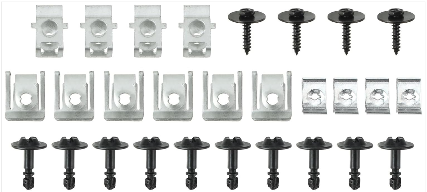
Figure 4.1: Detailed view of the included mounting elements.