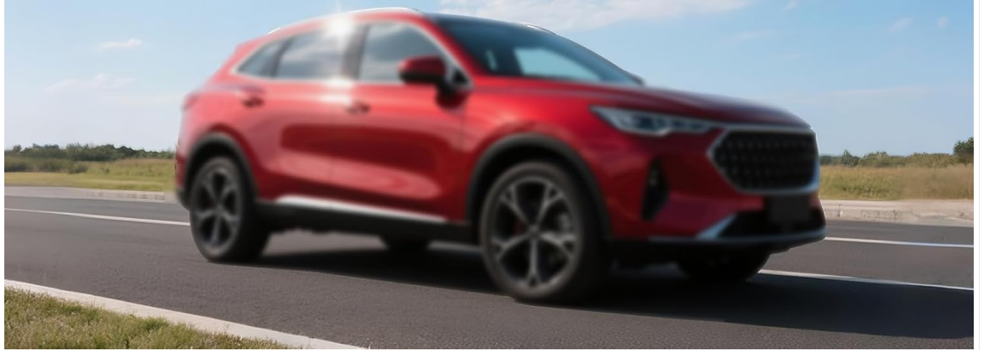
Figure 3.1: Visual representation of compatible Audi models and corresponding part numbers.