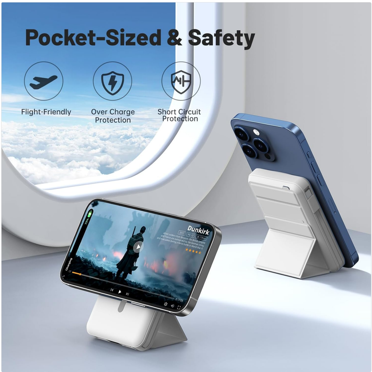
Image: A smartphone propped up by the power bank's foldable stand, with icons indicating flight-friendly design, overcharge protection, and short circuit protection.