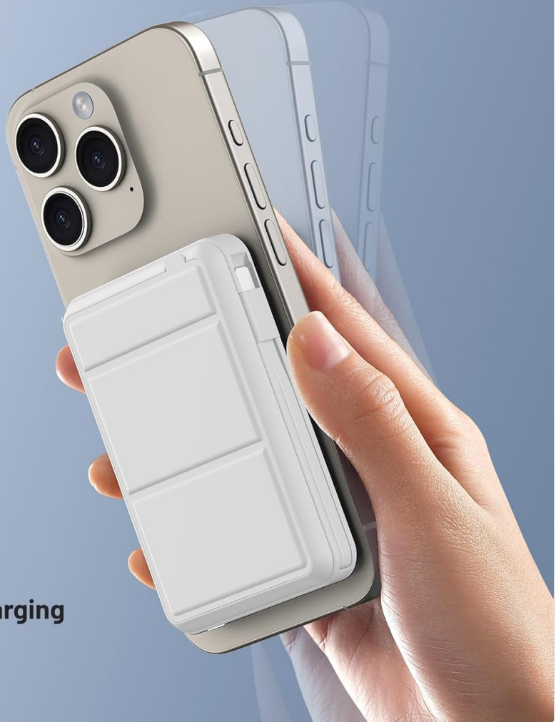
Image: A hand holding an iPhone with the power bank magnetically attached, demonstrating strong magnetic connection and 15W fast wireless charging.