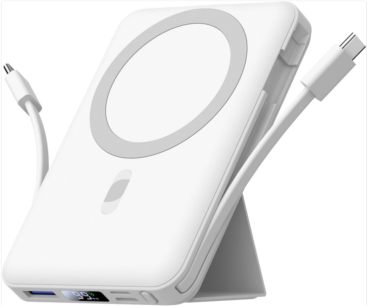
Image: Azmuth 10000mAh Magnetic Power Bank with built-in cables and foldable stand.