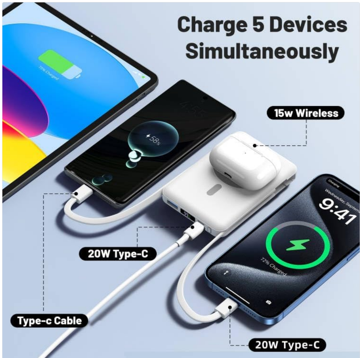
Image: The power bank simultaneously charging an iPad, two smartphones via USB-C, and AirPods wirelessly, illustrating its multi-device charging capability.