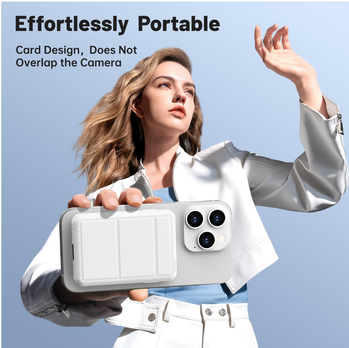
Image: A person holding an iPhone with the power bank attached, demonstrating its compact 'card design' that does not overlap the camera, emphasizing portability.

Card Design, Does Not Overlap the Camera