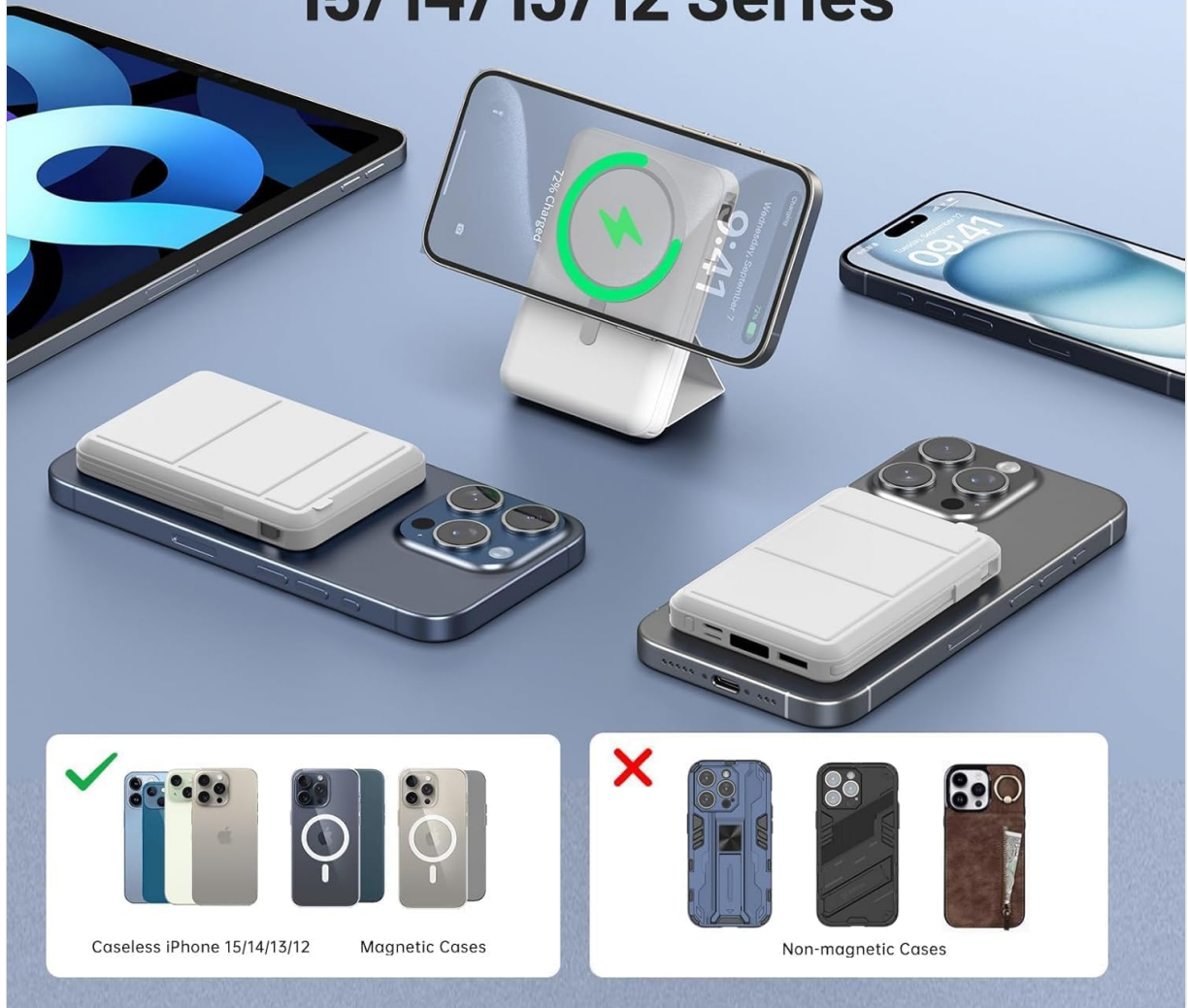
Image: Illustration showing the power bank's compatibility with iPhone 16, 15, 14, 13, and 12 series, highlighting use with caseless iPhones or magnetic cases.