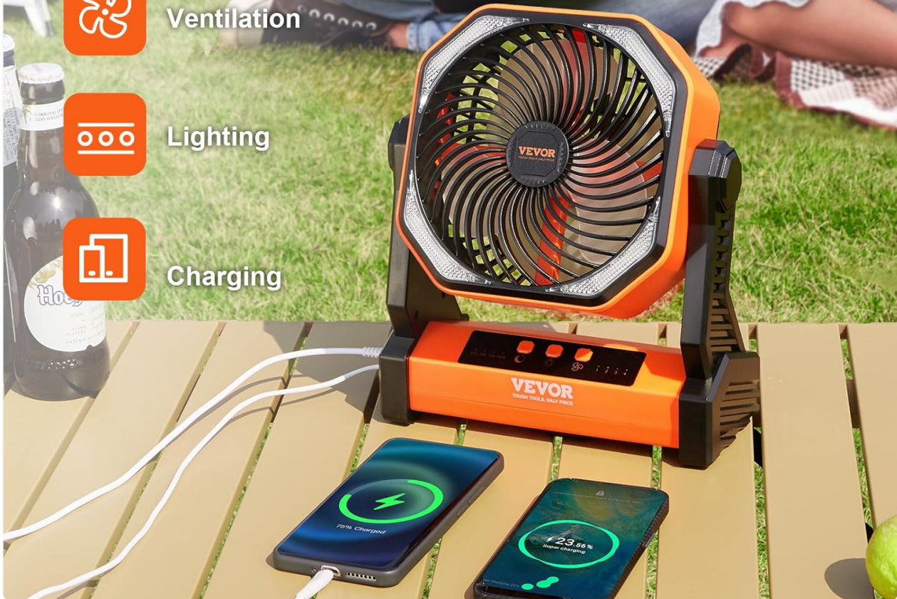
Image: The VEVOR D10 fan highlighting its three primary functions: ventilation, lighting, and charging.