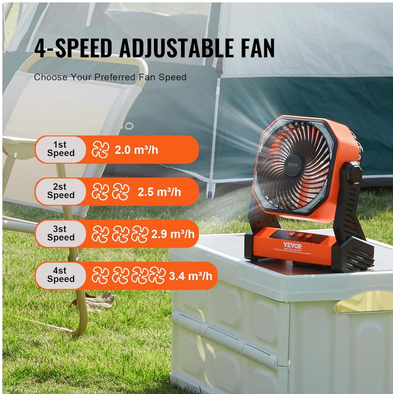
Image: The VEVOR D10 fan demonstrating its four adjustable fan speeds.