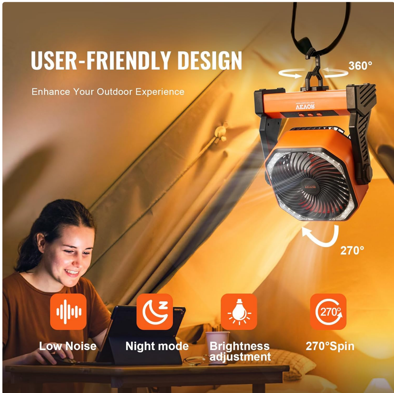
Image: The VEVOR D10 fan demonstrating its adjustable head and night mode feature.

If your model includes a remote control, it can be used to operate all functions of the fan from a distance, including power, fan speed, light settings, oscillation, and timer. The remote can be stored in a designated slot on the fan's base when not in use.