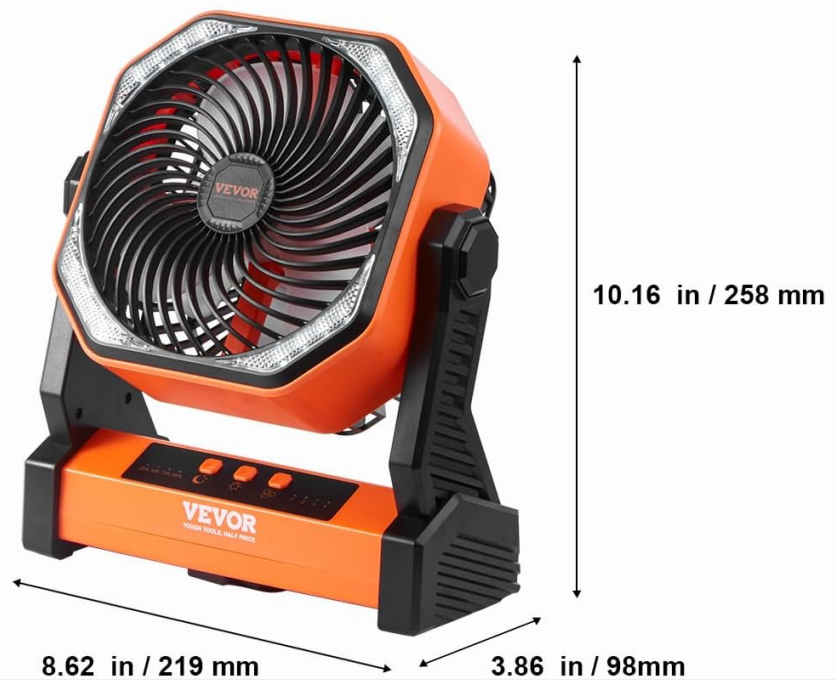
Image: Detailed specifications and dimensions of the VEVOR D10 fan.