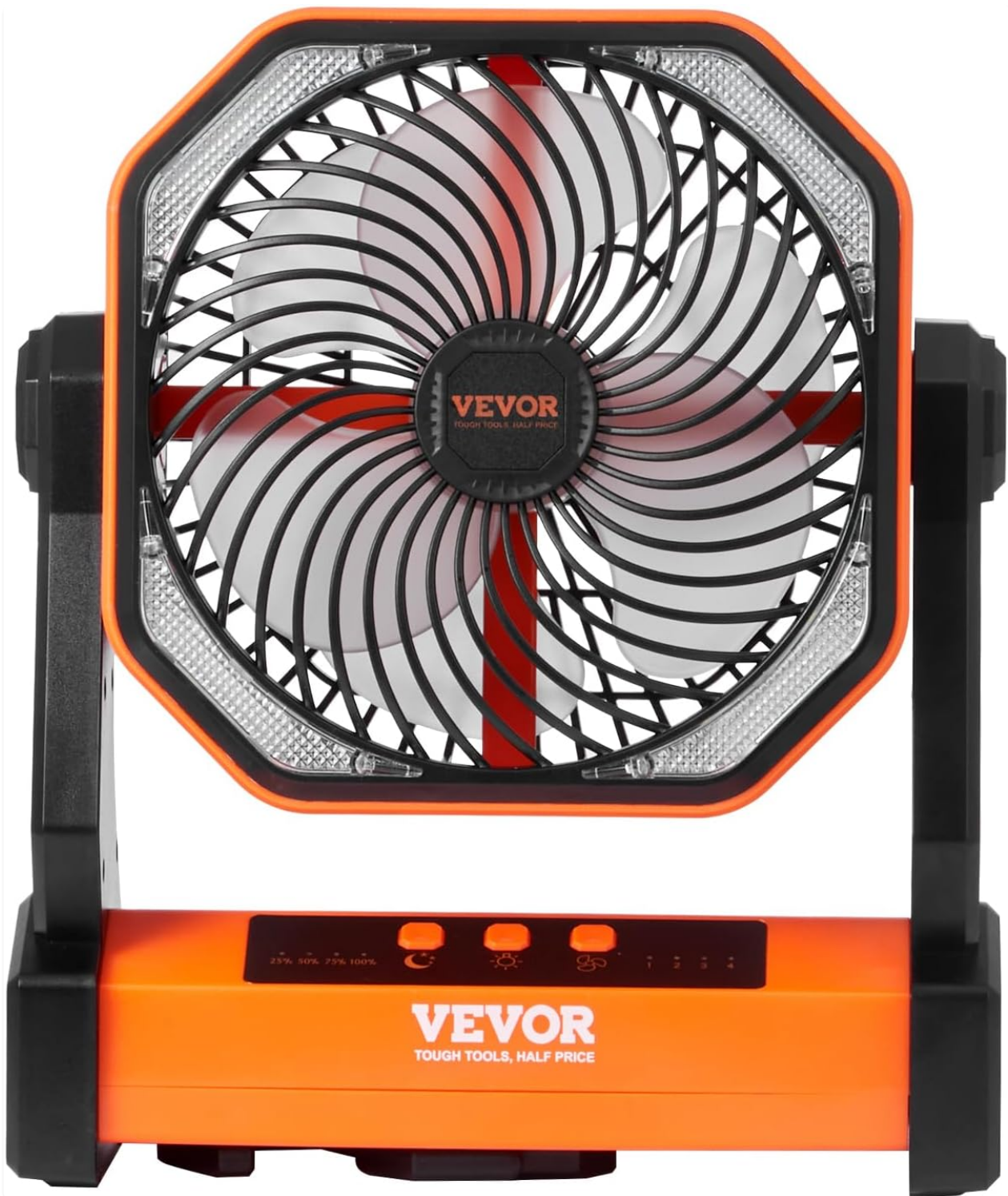
Image: The VEVOR D10 8-inch Rechargeable Camping Fan, showcasing its compact design and integrated LED lights.