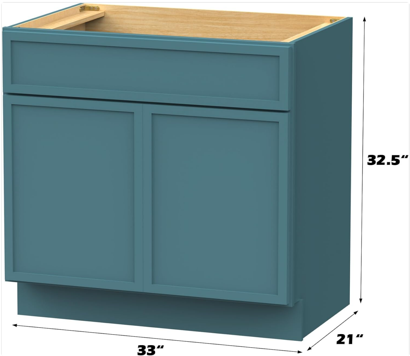
Figure 2: Product dimensions (Depth, Width, Height).