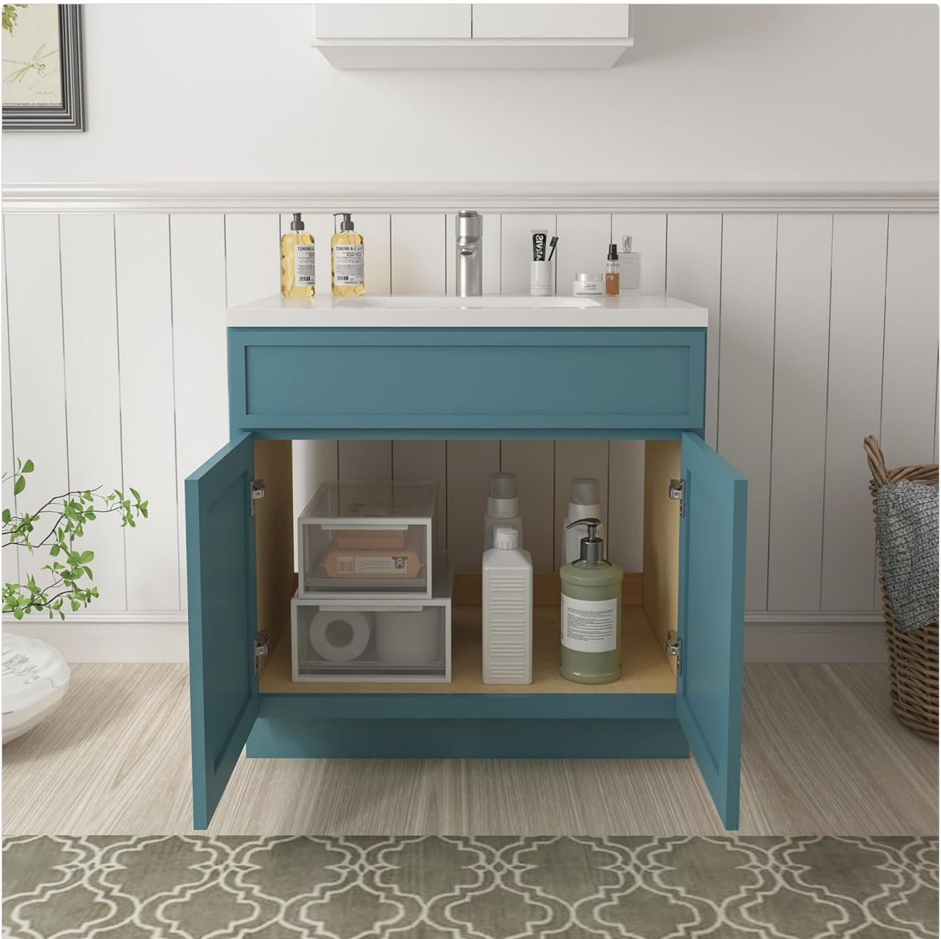
Figure 3: Interior view of the cabinet, showing storage space and soft-closing doors.