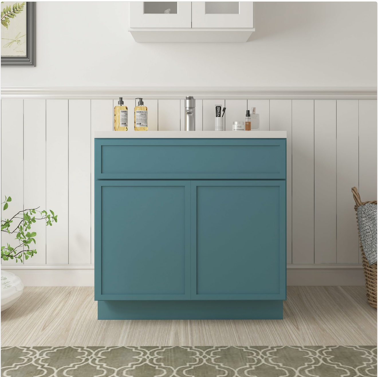
Figure 1: Front view of the Vanity Art 33 Inch Bathroom Vanity Base Cabinet.