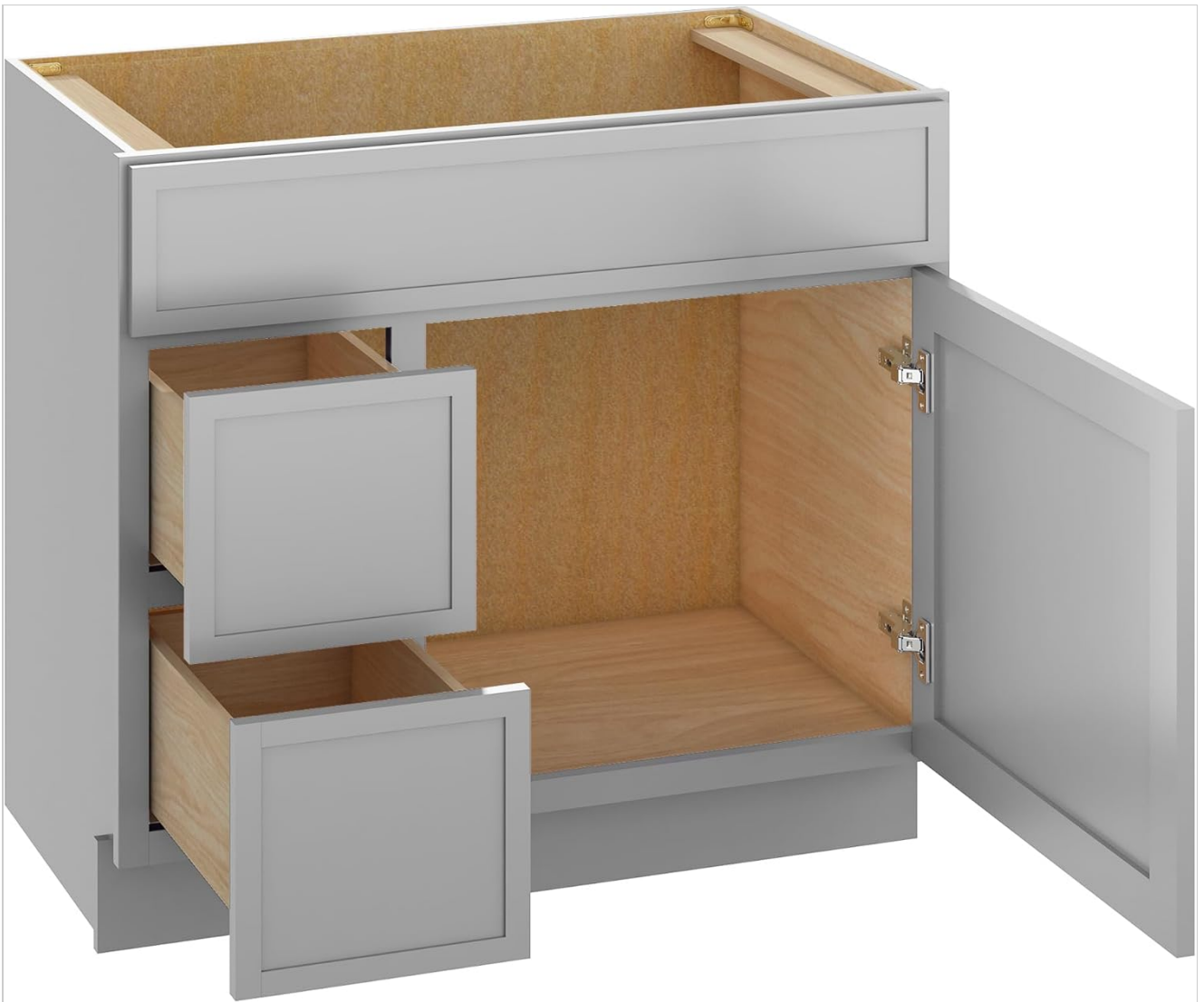
Image: Interior view of the vanity, showing the two dove-tailed drawers pulled out and the cabinet door open, revealing ample storage space.