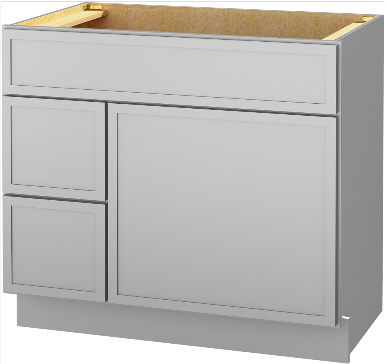
Image: Front view of the grey vanity base cabinet, showing the door and two left-side drawers.