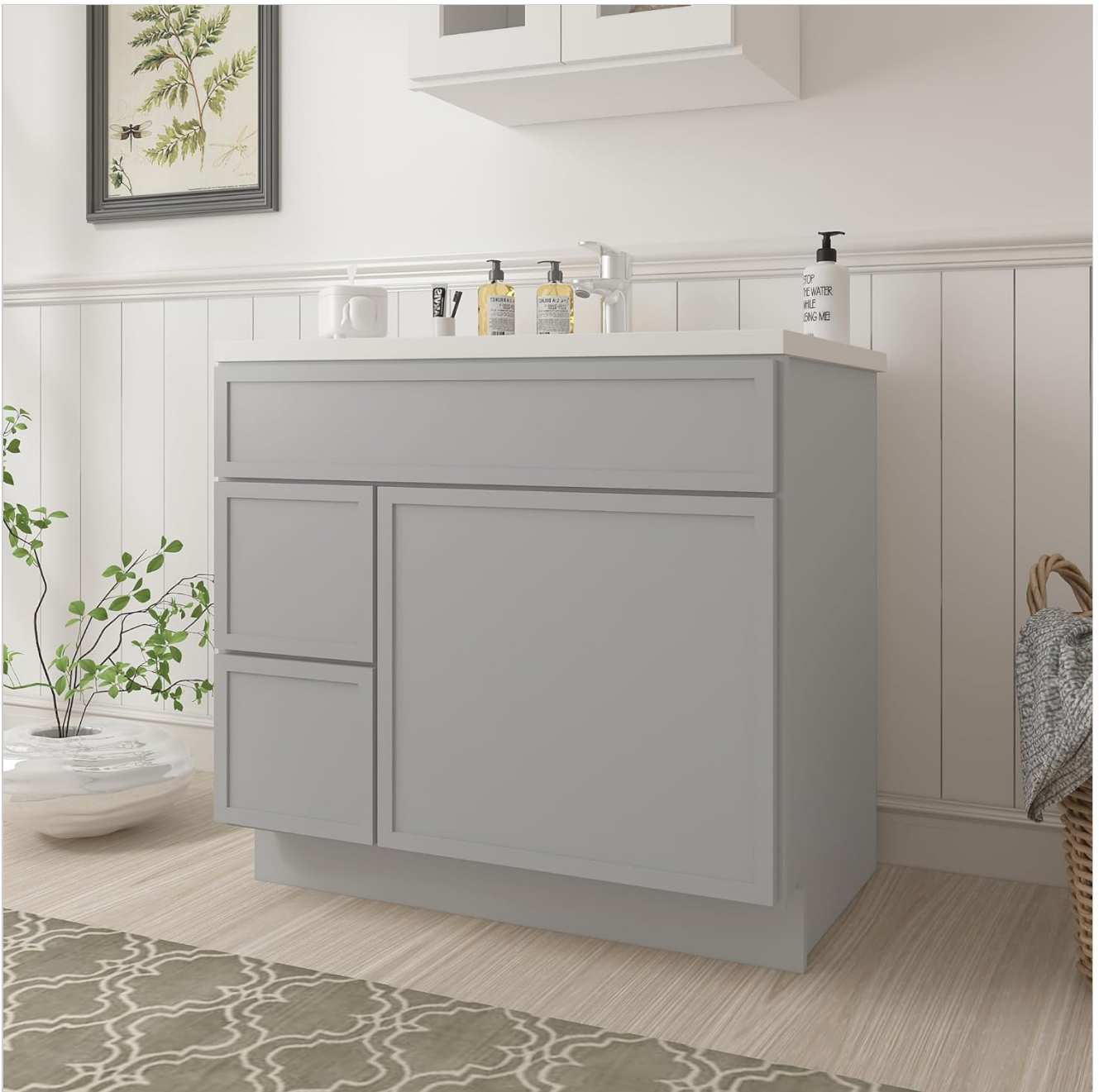
Image: The vanity base cabinet positioned in a bathroom, ready for countertop and sink installation.