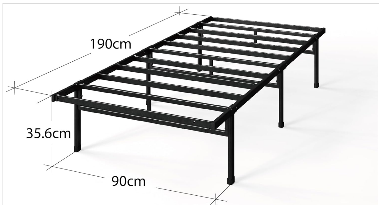
Image: Diagram illustrating the key dimensions of the bed frame: 190 cm length, 90 cm width, and 35.6 cm height.