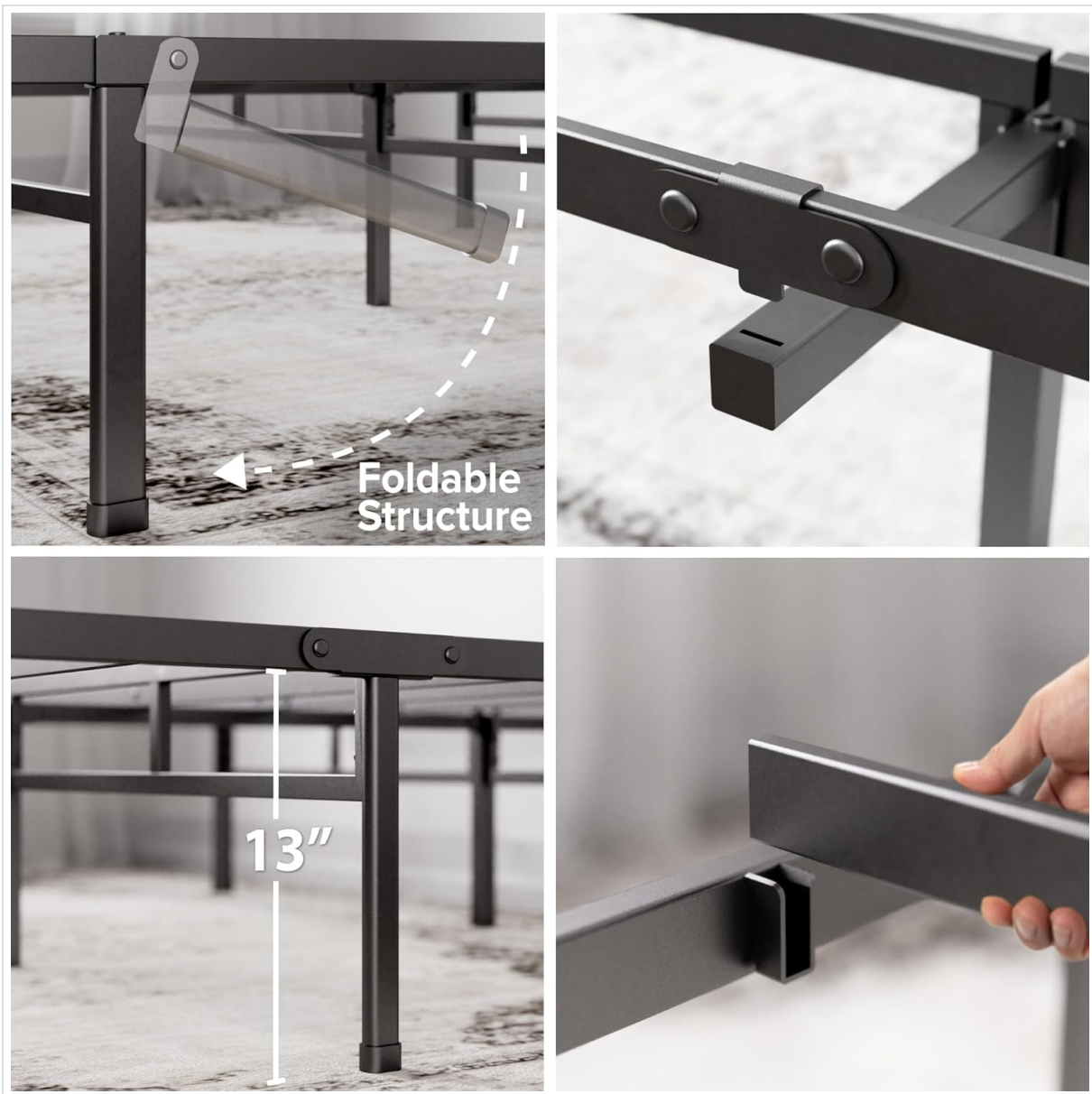
Image: Close-up view illustrating the foldable structure mechanism and the 13-inch (33 cm) under-bed clearance.

Refer to the detailed visual instructions in the included installation manual for specific guidance on each step.