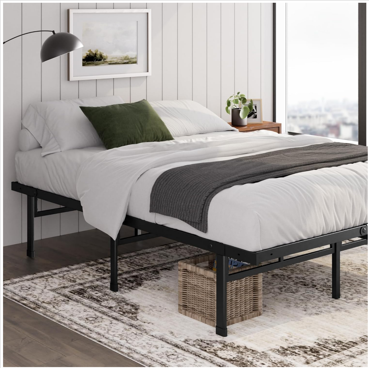
Image: The Zinus Justin Metal Platform Bed Frame, showcasing its overall design and structure.