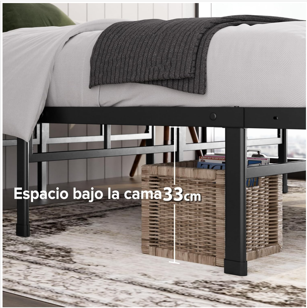
Image: A view showing the under-bed clearance with a storage basket, highlighting the 33 cm (13 inch) space available.