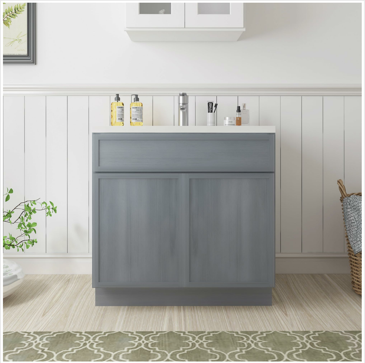
Image: Front view of the Vanity Art 33 Inch Bathroom Vanity Base Cabinet.