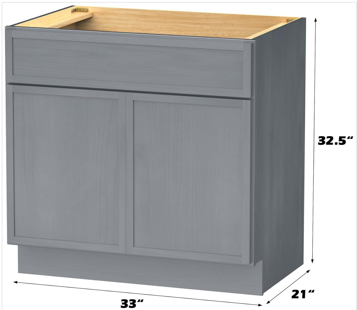
Image: Detailed dimensions of the 33-inch vanity base cabinet.