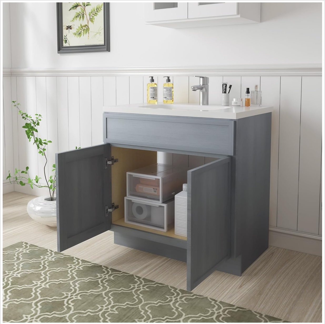
Image: Cabinet with doors open, illustrating interior storage space.