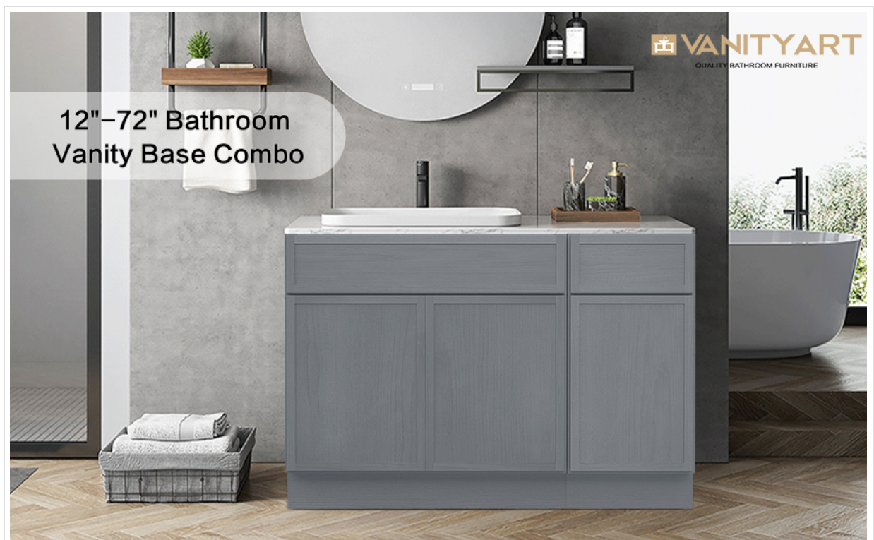
Image: The Vanity Art 33 Inch Bathroom Vanity Base Cabinet integrated into a modern bathroom design.

This cabinet is designed to provide ample storage and enhance the functionality of your bathroom space. It features a durable engineered wood construction and soft-closing door mechanisms for quiet operation.