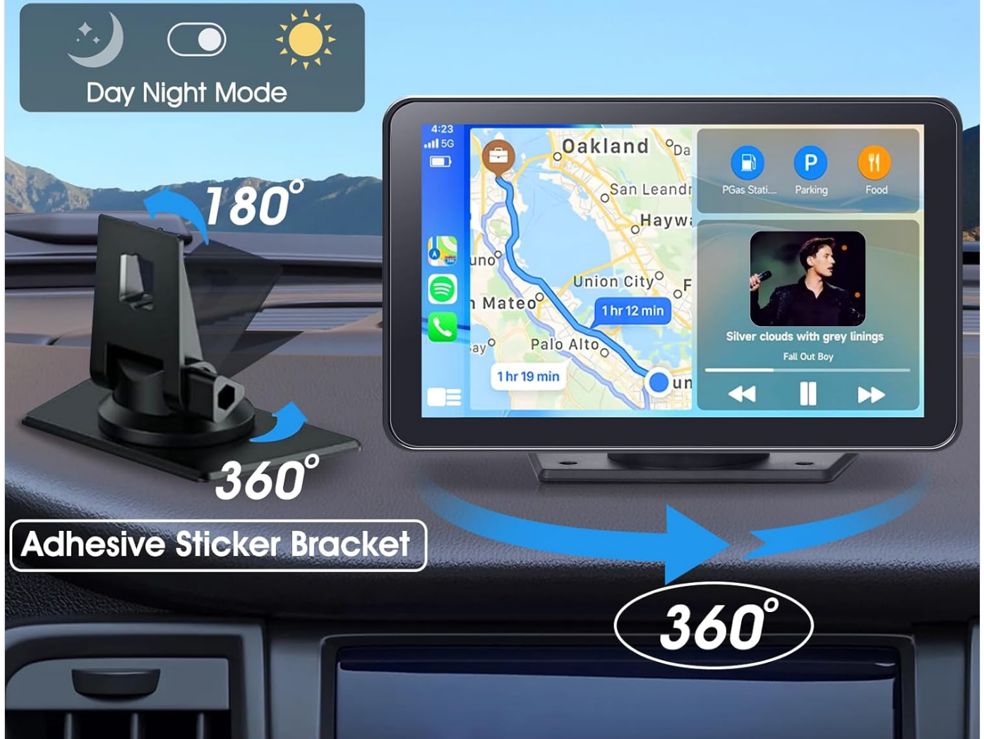
Image: The portable CarPlay screen mounted on a dashboard, illustrating its multi-rotation bracket and wide viewing angle capabilities.