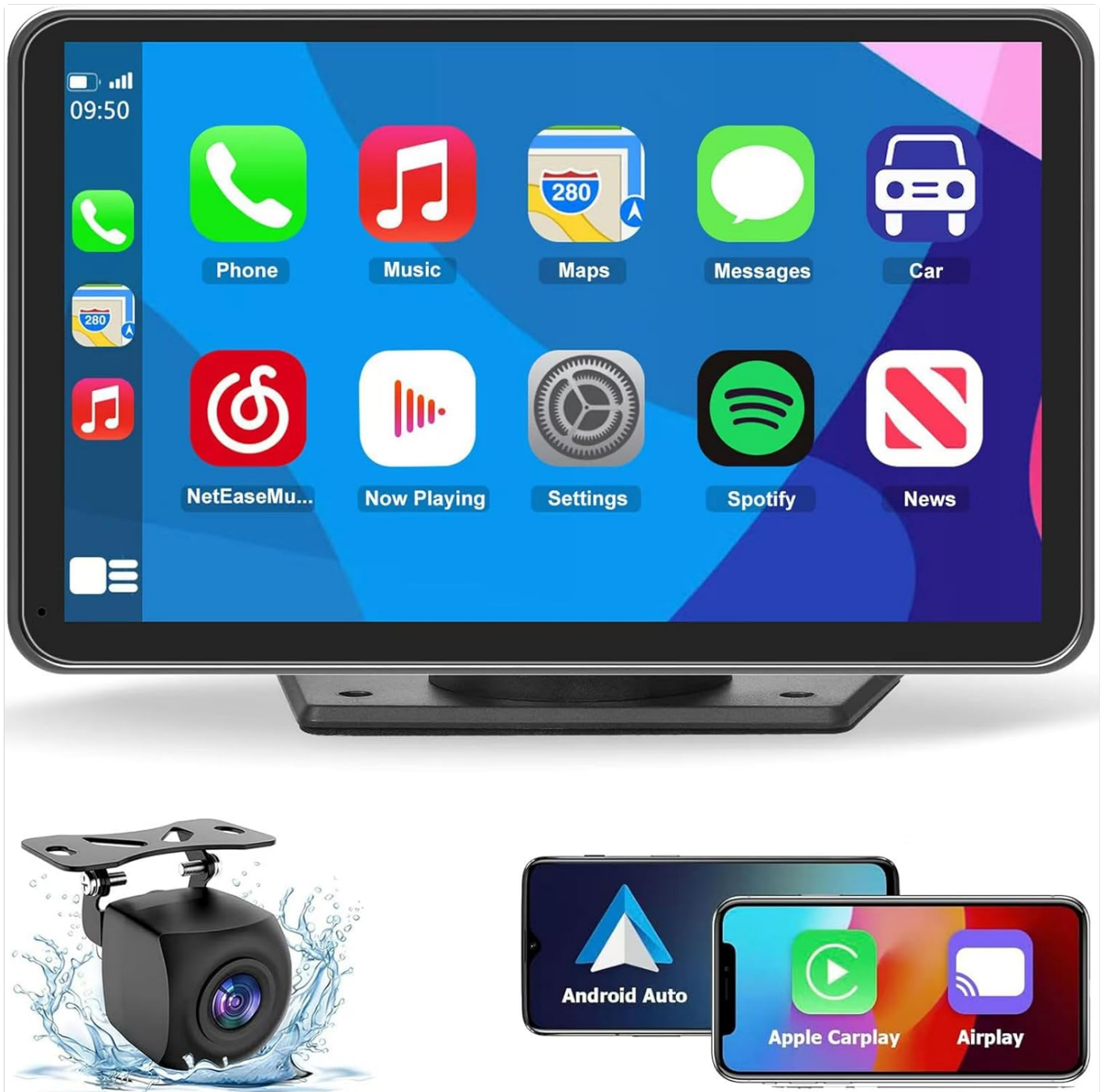
Image: The main unit of the PASLDA Wireless CarPlay Screen along with the backup camera and icons for Android Auto and Apple CarPlay.