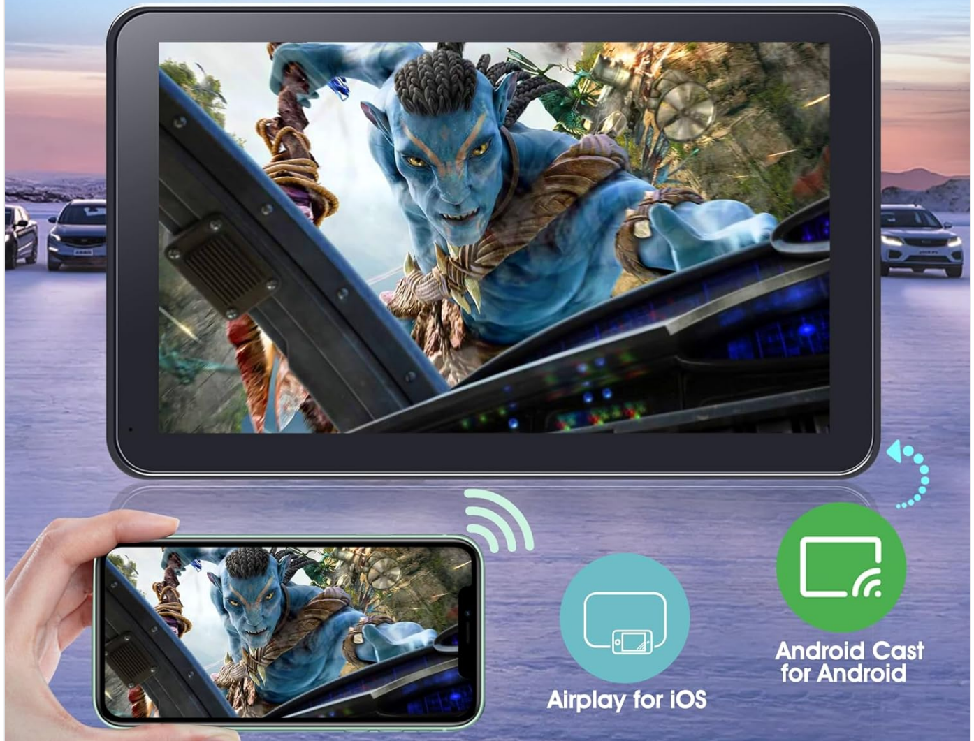
Image: The Mirror Link function in action, displaying content from a smartphone onto the larger 7-inch HD touchscreen.

Equipped with 7" HD 1024*600P Touchscreen, Mirror Link function brings you ultimate visual and audio experience.