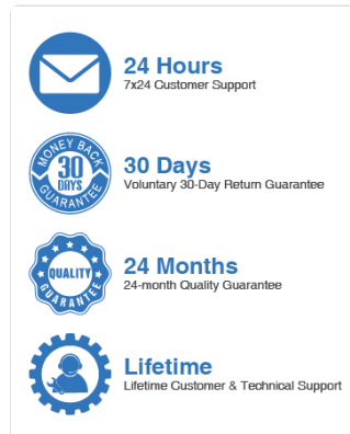
Image: Icons representing 24/7 customer support, 30-day return, 24-month quality guarantee, and lifetime technical support.

For any inquiries or assistance, please refer to the contact information provided in your Owner's Manual or visit the official PASLDA store on Amazon.