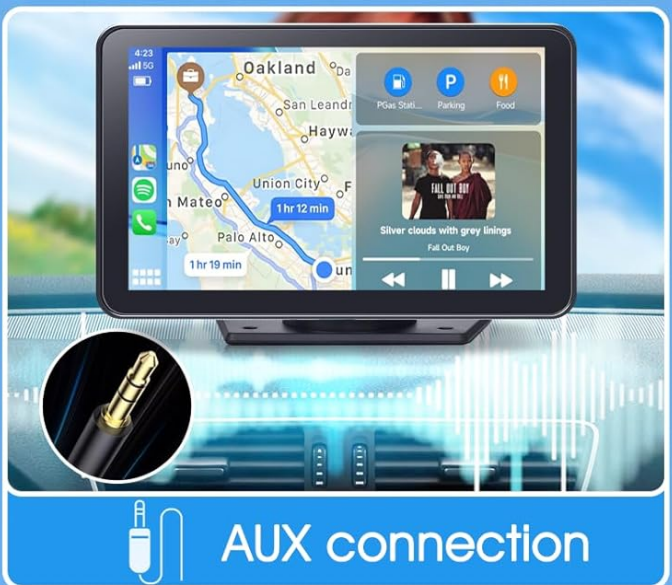
Image: Illustration of the four available audio output methods for the CarPlay screen: built-in speakers, Bluetooth, FM transmission, and AUX connection.