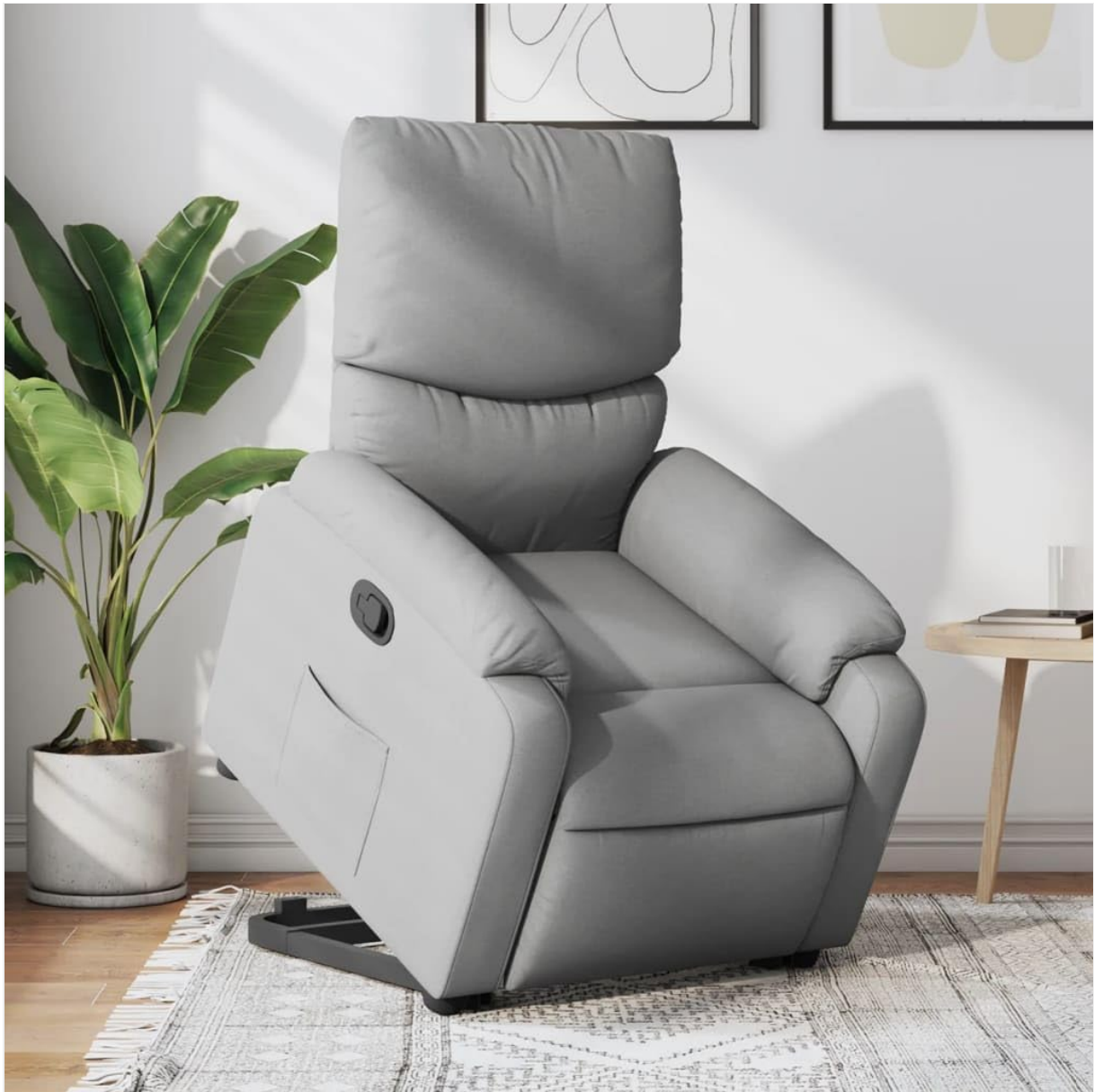
Image 1: The vidaXL Recliner Chair with Raise Aid in a home environment.