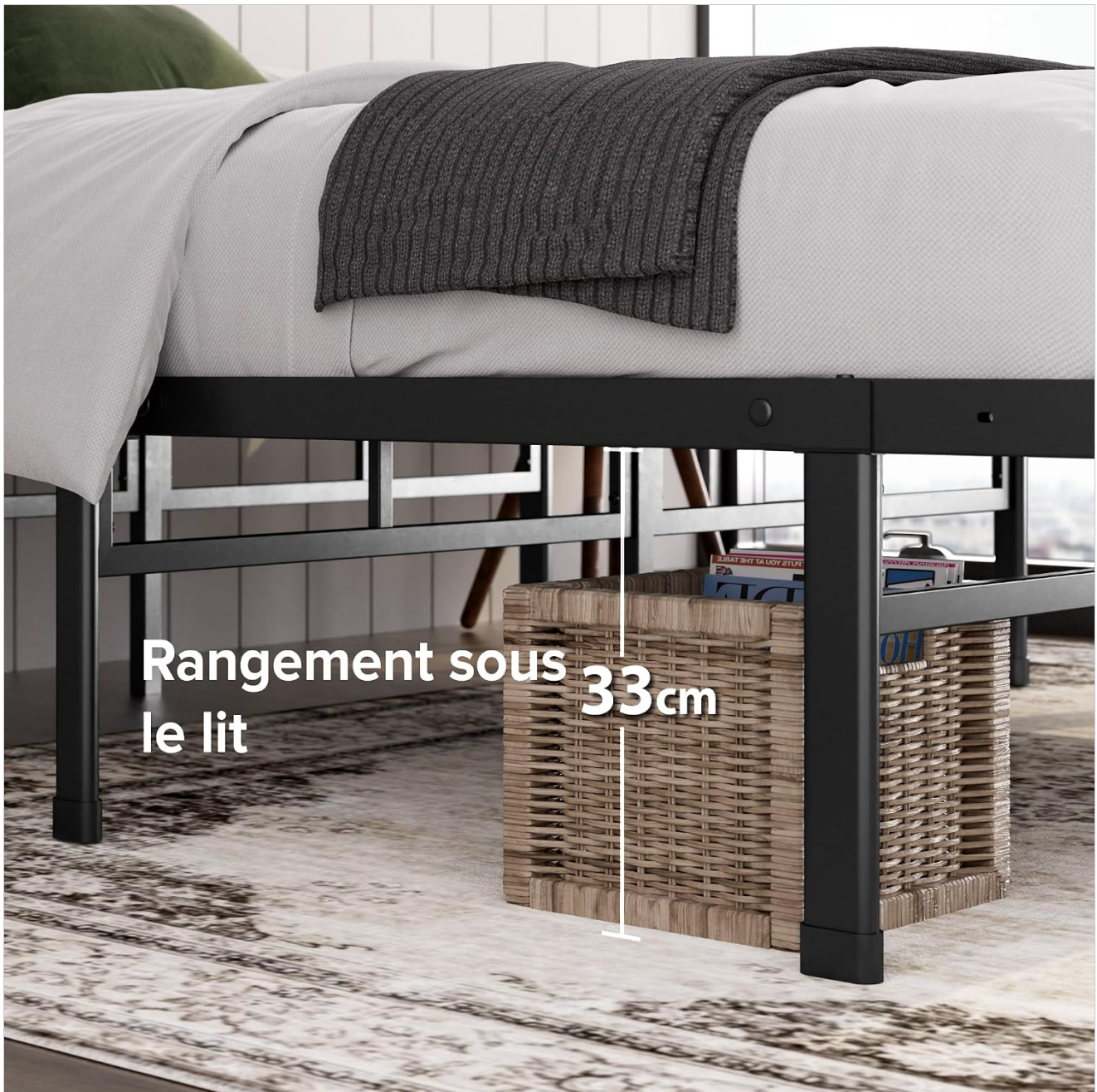
Image: A close-up view illustrating the 33 cm (13 inches) of under-bed storage space, with a wicker basket placed underneath to demonstrate its utility.