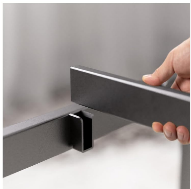
Image: Detailed view of the Zinus bed frame's foldable structure and leg design, highlighting the secure connections and protective plastic caps on the feet.