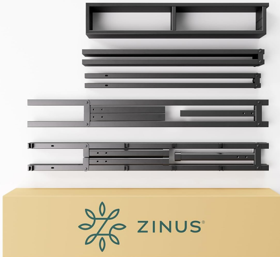
Image: All components of the Zinus bed frame, including the frame sections, slats, and tools, are compactly organized within a single box, ready for assembly.