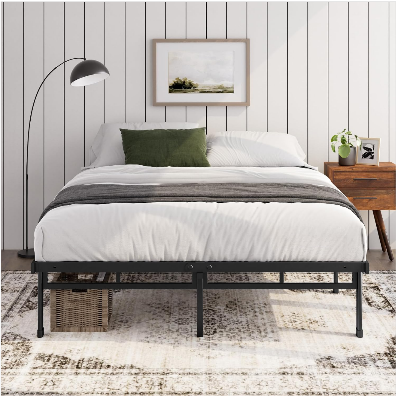
Image: The Zinus Justin Lit bed frame, fully assembled with a mattress and bedding, positioned in a modern bedroom. This illustrates the product's aesthetic and functional integration into a living space.