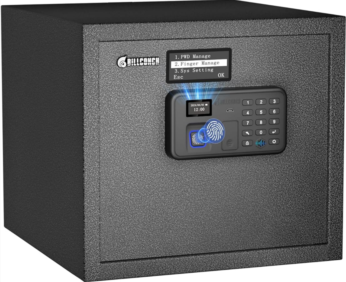
Image: The BILLCONCH Smart Biometric Gun Safe S320, showcasing its digital keypad, fingerprint scanner, and a smartphone displaying the companion app interface.