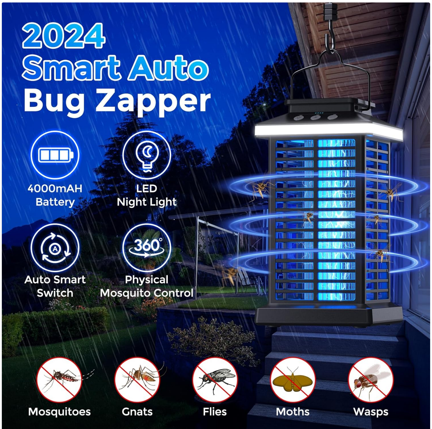
Image 2.1: Overview of the bug zapper's main features and targeted insects.