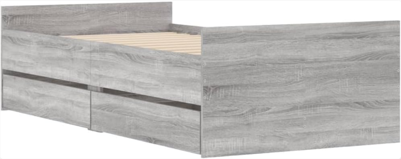
Image 5.1: A close-up view highlighting the integrated storage drawers of the bed frame.