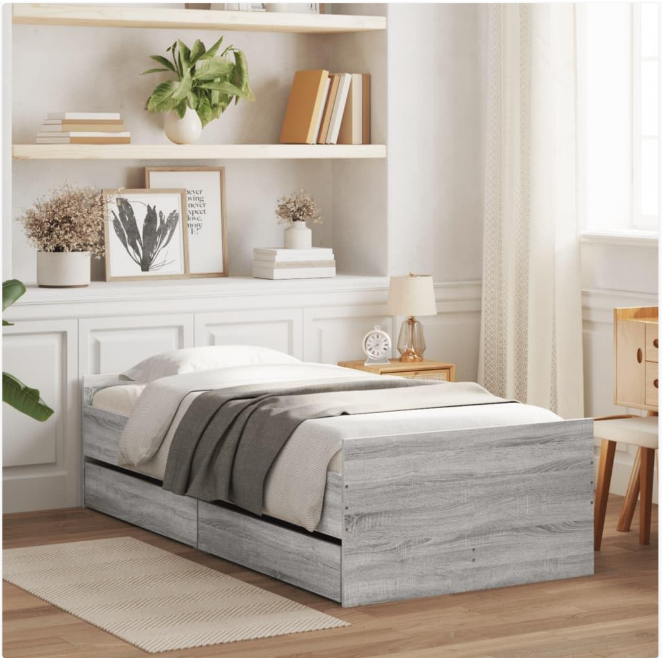
Image 1.1: The vidaXL Bed Frame with Drawers, Sonoma Grey, shown in a bedroom environment.