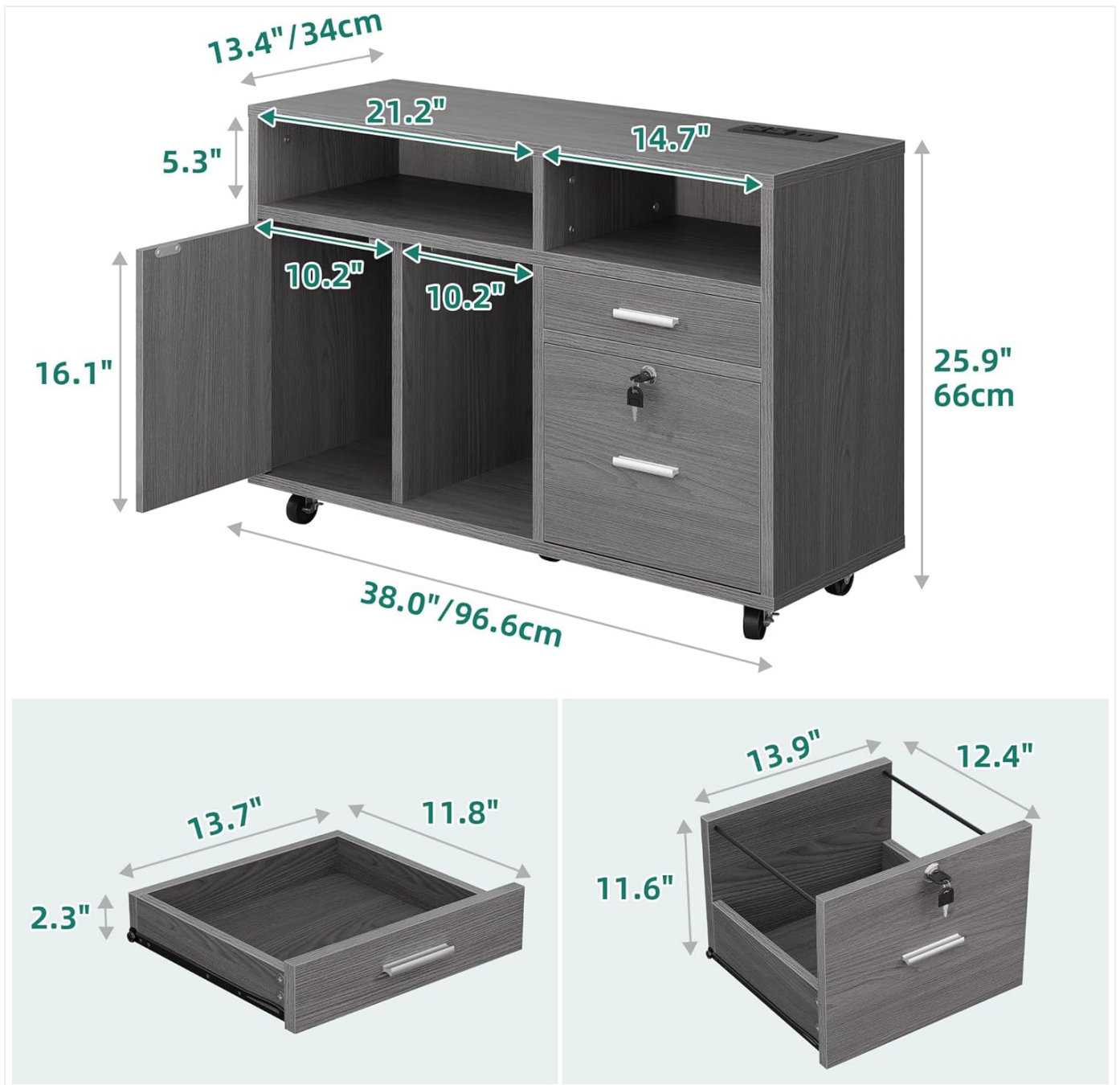
Image 2: Product dimensions of the YITAHOME File Cabinet. This diagram illustrates the overall width (38.0 inches / 96.6 cm), depth (13.4 inches / 34 cm), and height (25.9 inches / 66 cm), along with internal measurements for shelves and drawers.