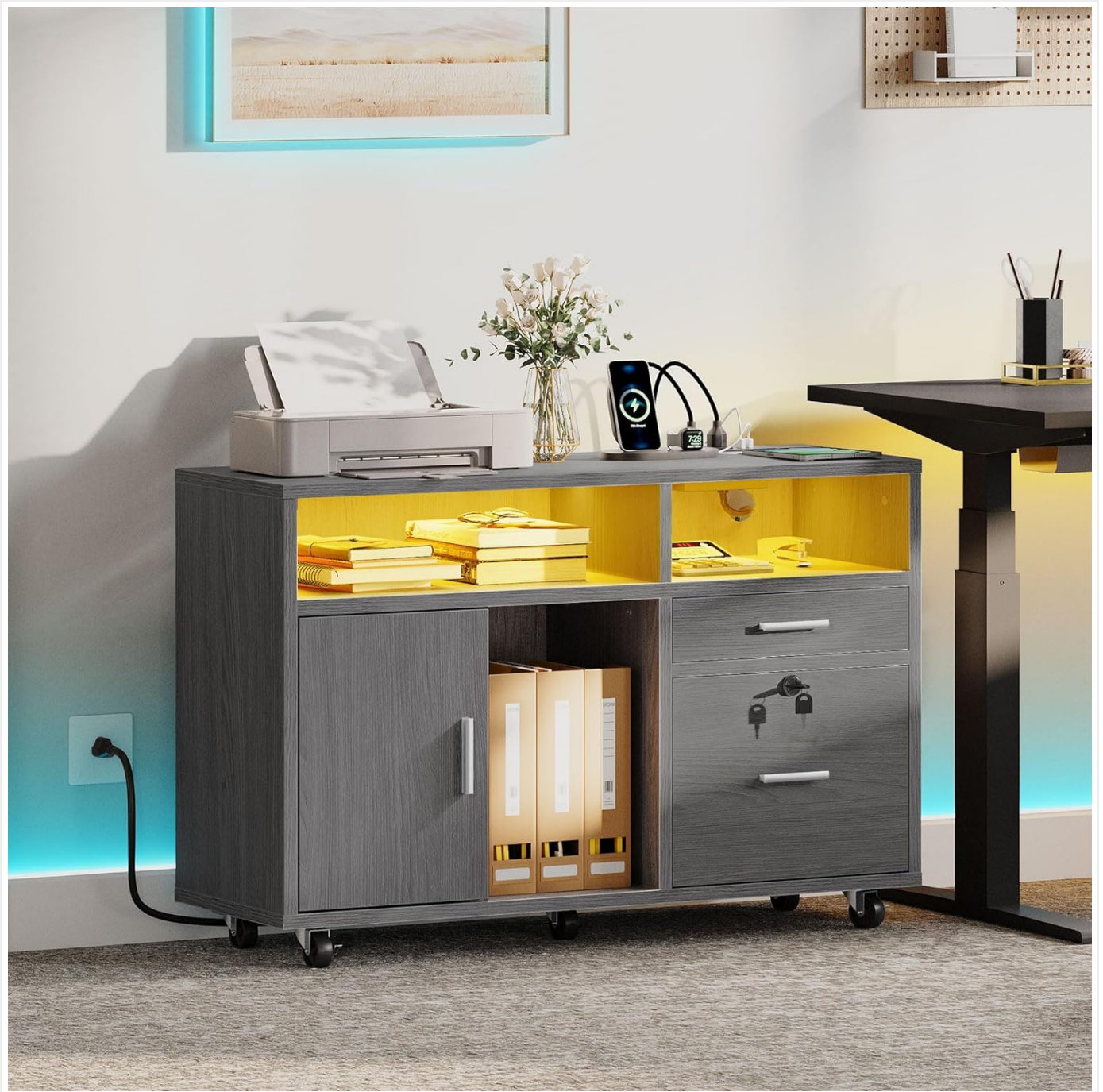
Image 1: Overview of the YITAHOME Wood File Cabinet. This image displays the complete assembled cabinet, highlighting its grey wood finish, two drawers (one lockable), a cabinet door, open shelves, and the integrated LED light and charging ports.