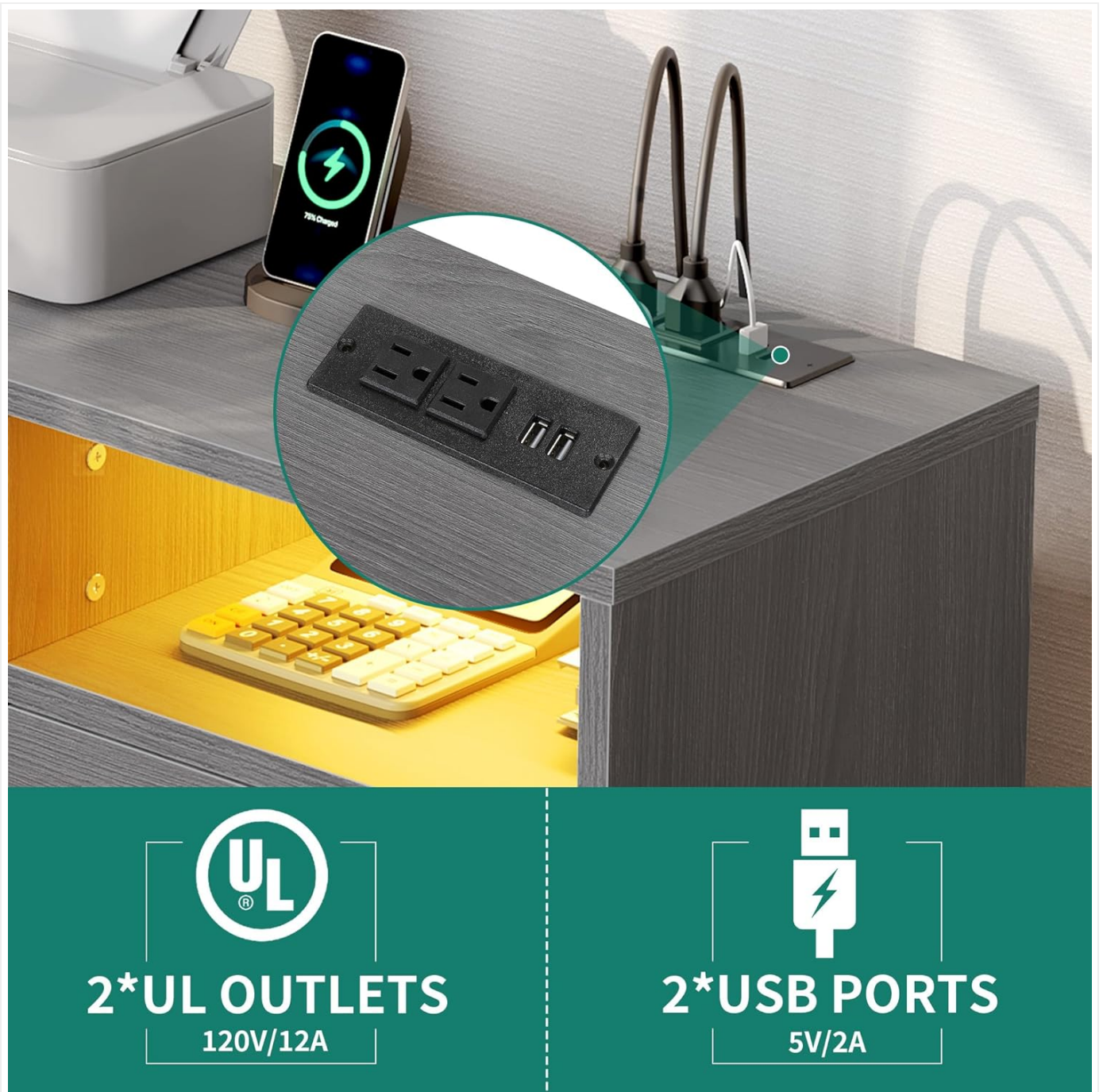
Image 4: Close-up view of the integrated charging station. This image highlights the two UL-Listed AC outlets and two USB ports, along with their electrical specifications, for convenient device charging.