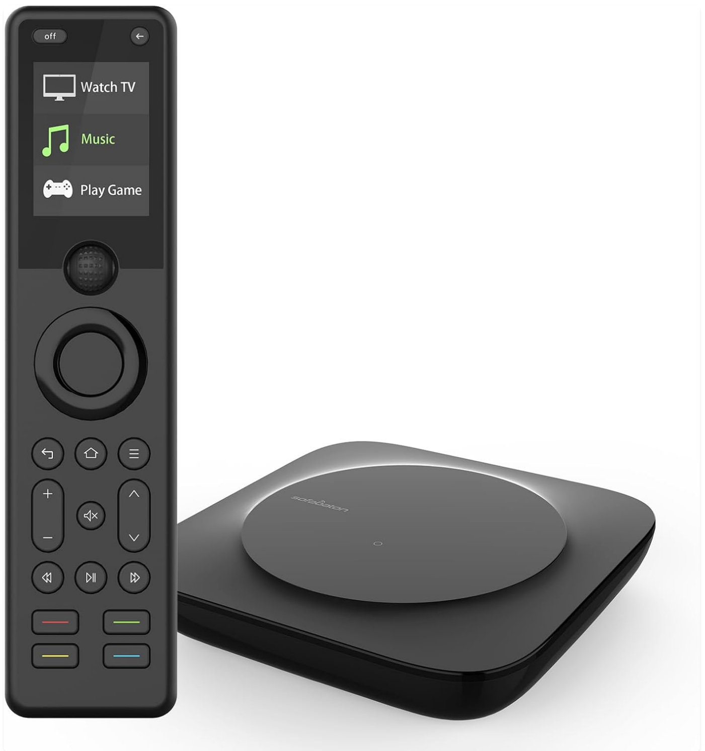
The SofaBaton X1S universal remote and its accompanying hub, designed for centralized control of various home entertainment devices.