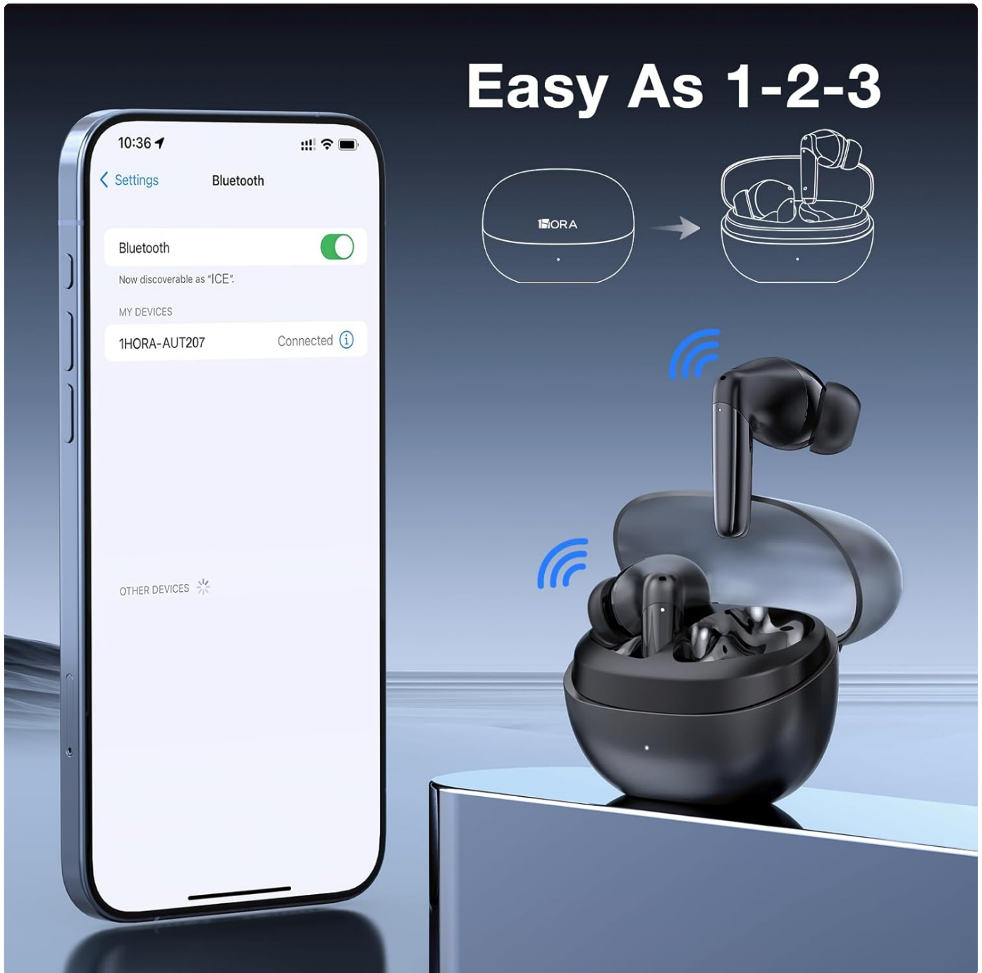
Image: A smartphone screen displaying Bluetooth settings, showing "1HORA-AUT207" as a connected device, illustrating the one-step pairing process.

Note: After the initial pairing, the earbuds will automatically connect to the last paired device when removed from the charging case, provided Bluetooth is enabled on your device.