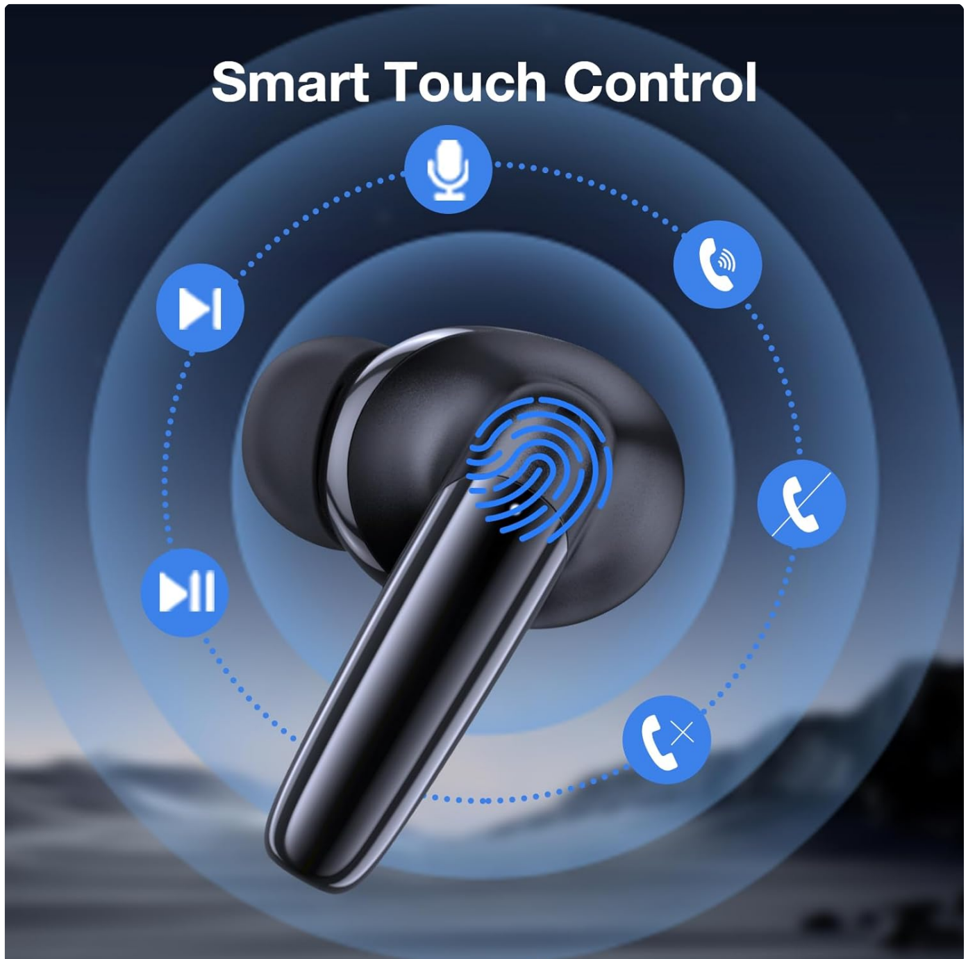
Image: An illustration detailing the various smart touch control functions on the earbud, including play/pause, call management, and voice assistant activation.