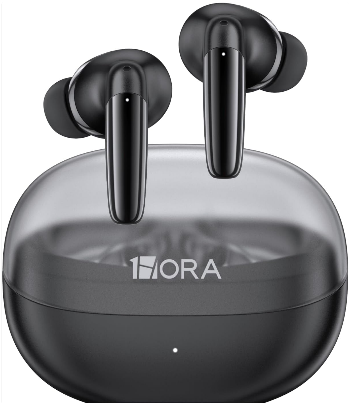
Image: The 1 Hora AUT207 Wireless Earbuds, black in color, resting inside their translucent-lidded charging case. The case has a matte black finish with the "1 HORA" logo visible on the lid.