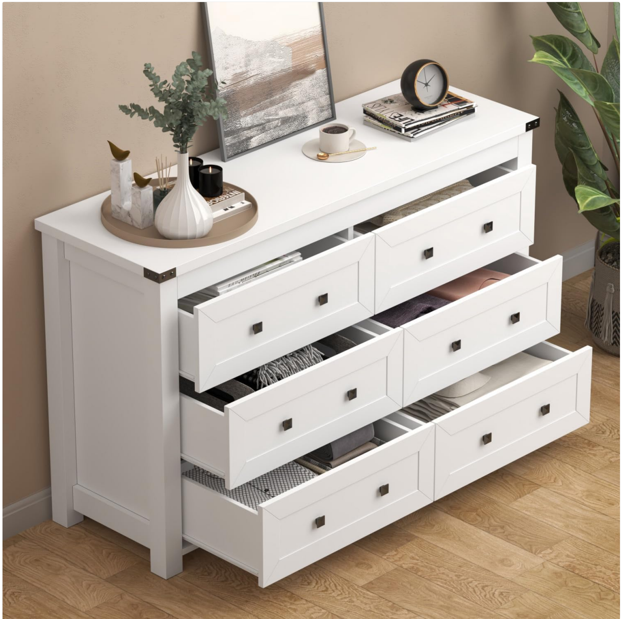
The white HUANLEGO 6-Drawer Dresser is shown with several drawers partially open, displaying neatly folded clothing and other items inside. This illustrates the practical storage capabilities and accessibility of the drawers.