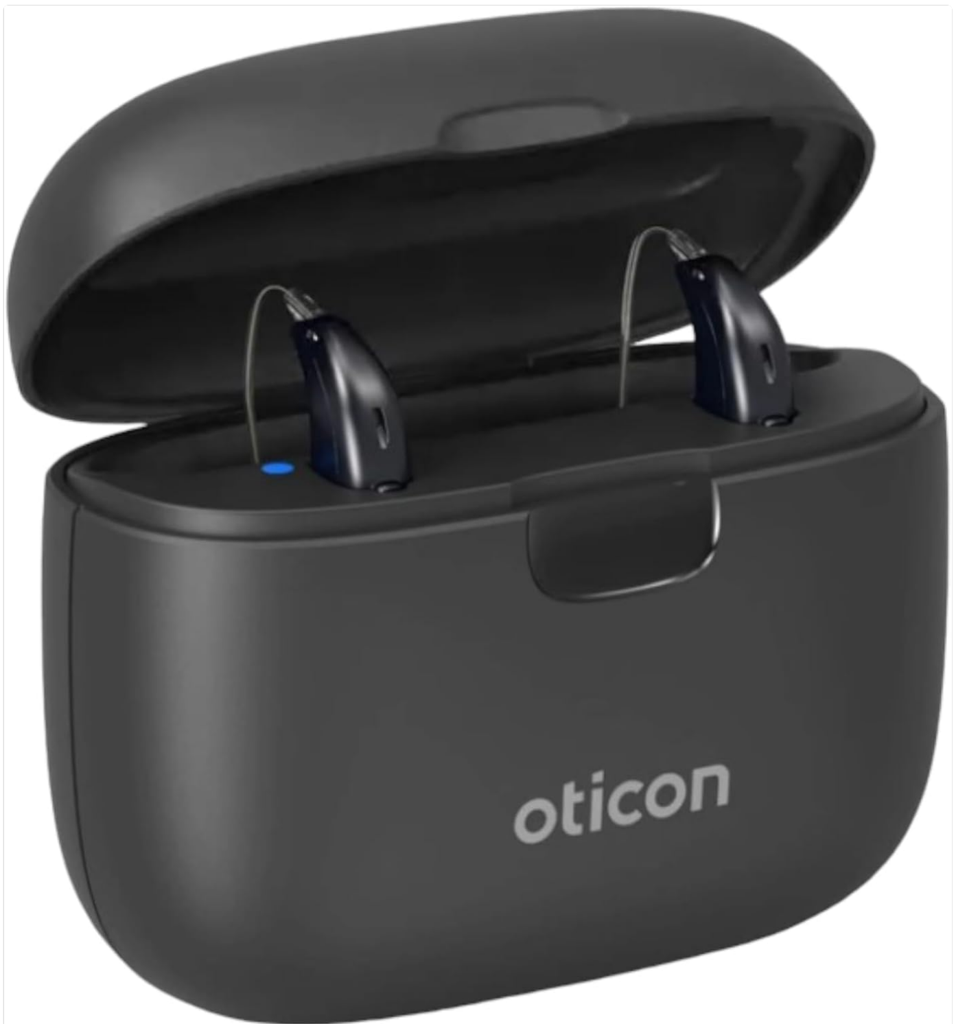
Image: The Oticon Smart Charger with its lid open, displaying two hearing aids securely placed within the charging slots. A small blue indicator light is visible, indicating charging status.