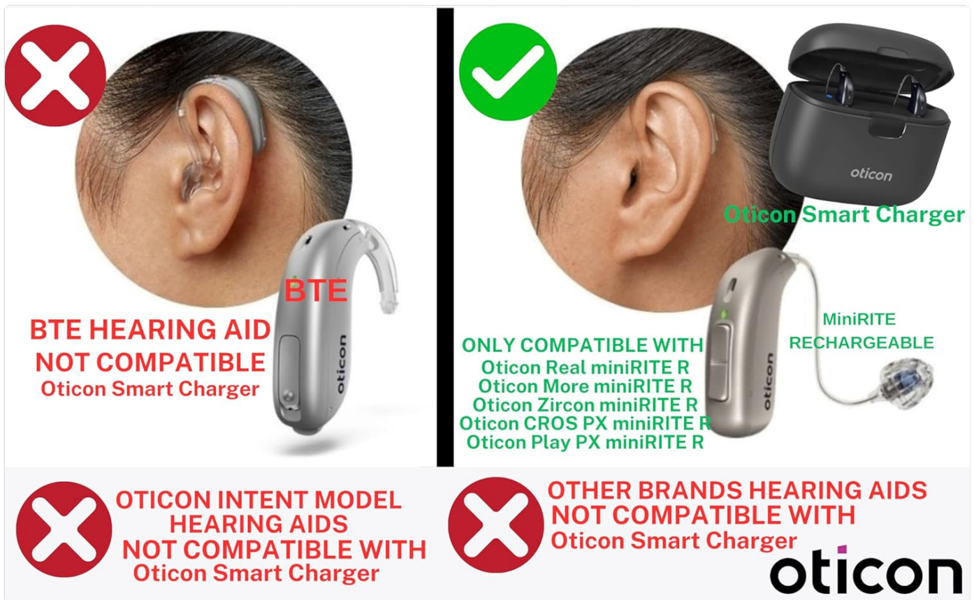
Image: A visual guide illustrating the compatibility of the Oticon Smart Charger. It clearly shows miniRITE rechargeable hearing aids as compatible and BTE (Behind-The-Ear) and Oticon Intent models as incompatible.