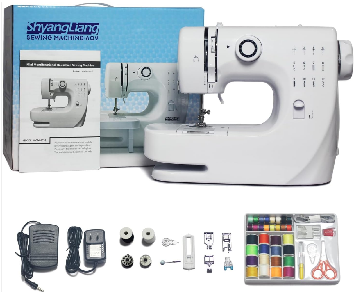
Image: The ShyangLiang Mini Portable Electric Sewing Machine LH-SM609A, shown with its packaging, foot pedal, power adapter, and a comprehensive accessory kit including various threads, bobbins, needles, and presser feet.