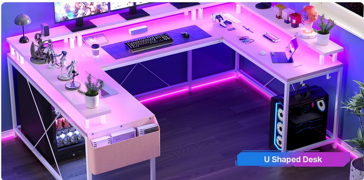
Image 5.1: Features of the RGB LED strip lights and control options.