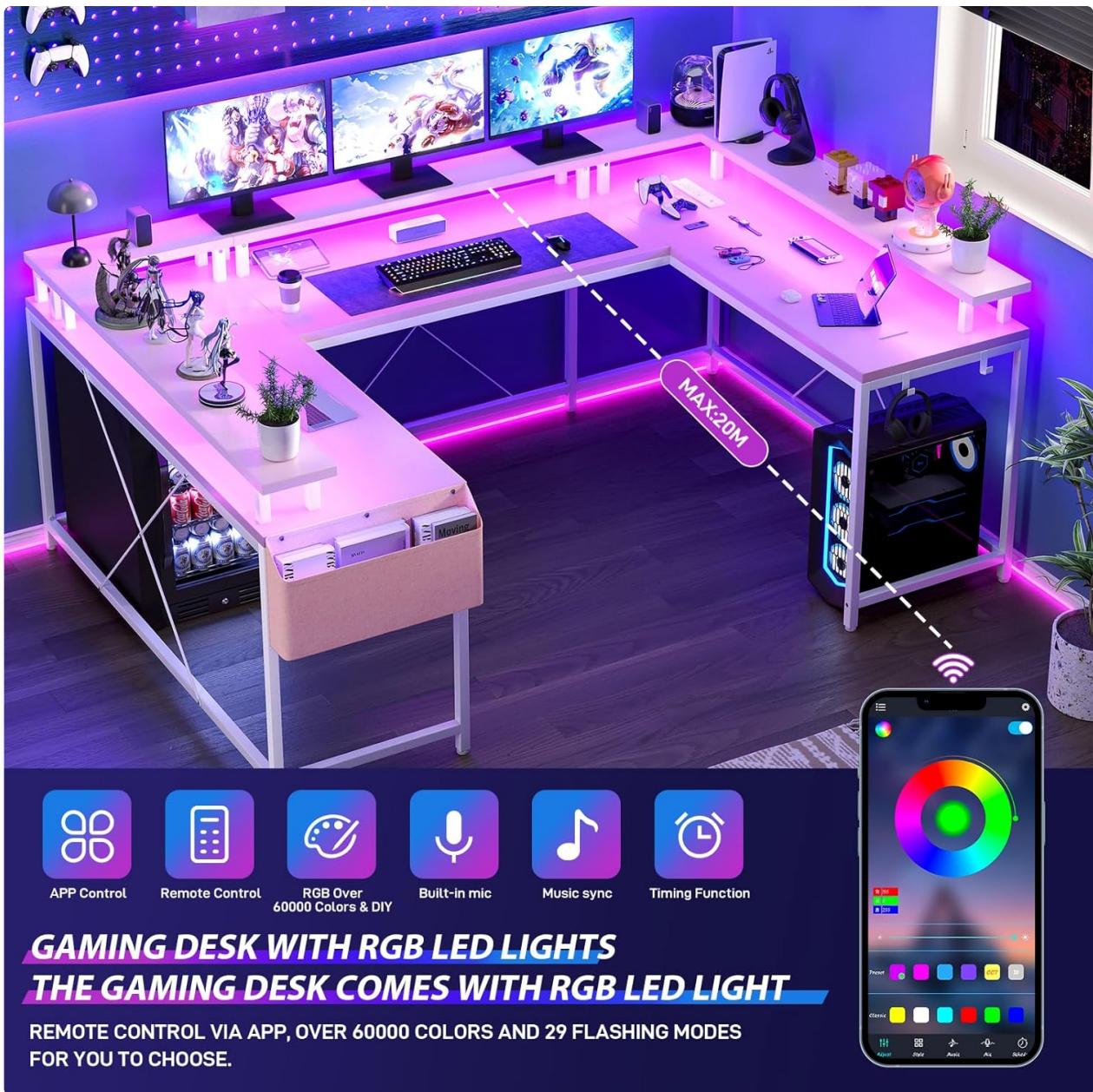
Image 1.1: Overview of the Jojoka U Shaped Computer Gaming Desk in a U-shaped configuration.