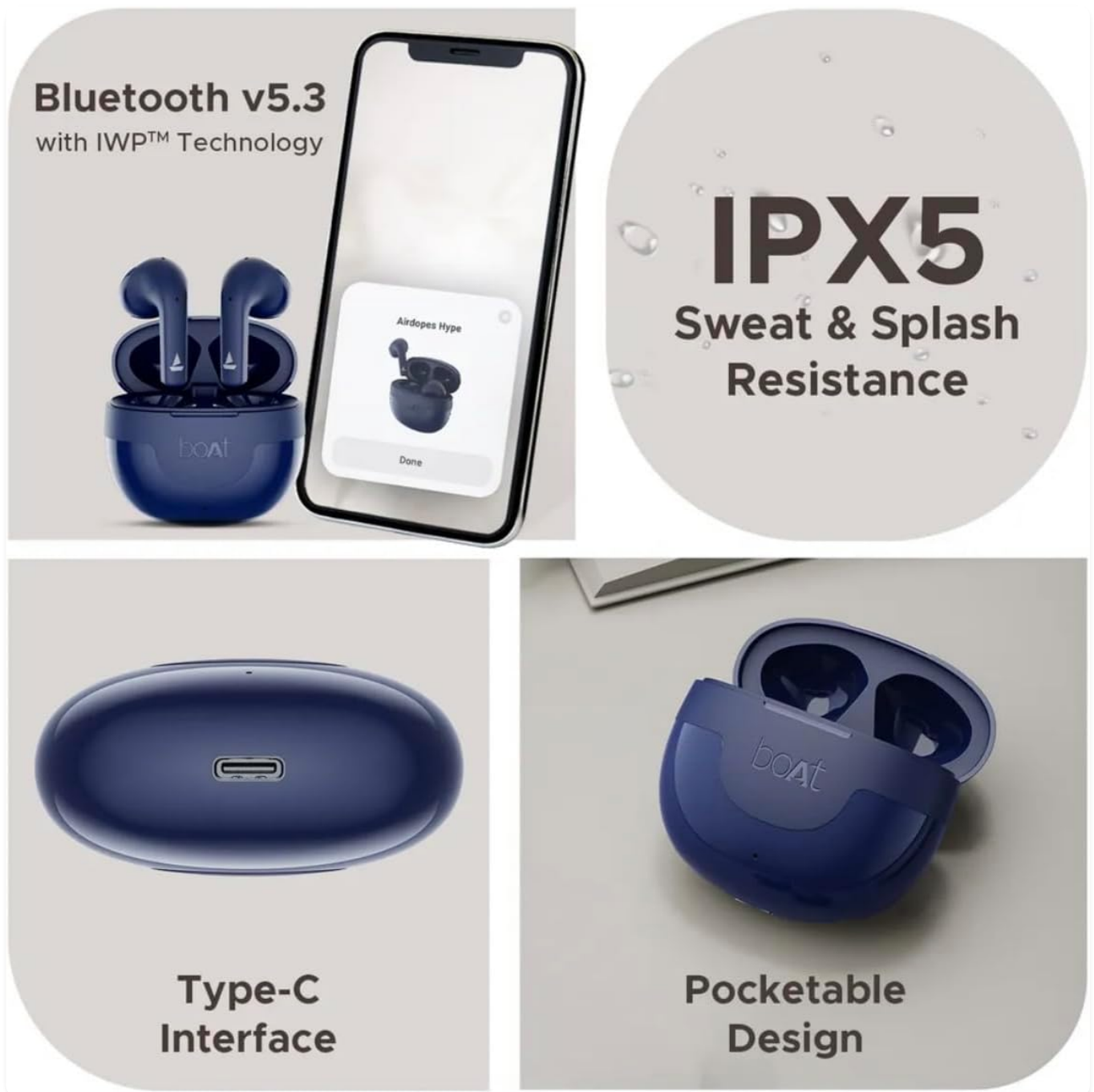
Figure 6: Connectivity, Durability, and Design Features. This composite image showcases the Bluetooth connectivity, IPX5 rating, Type-C charging, and portable design of the earbuds.