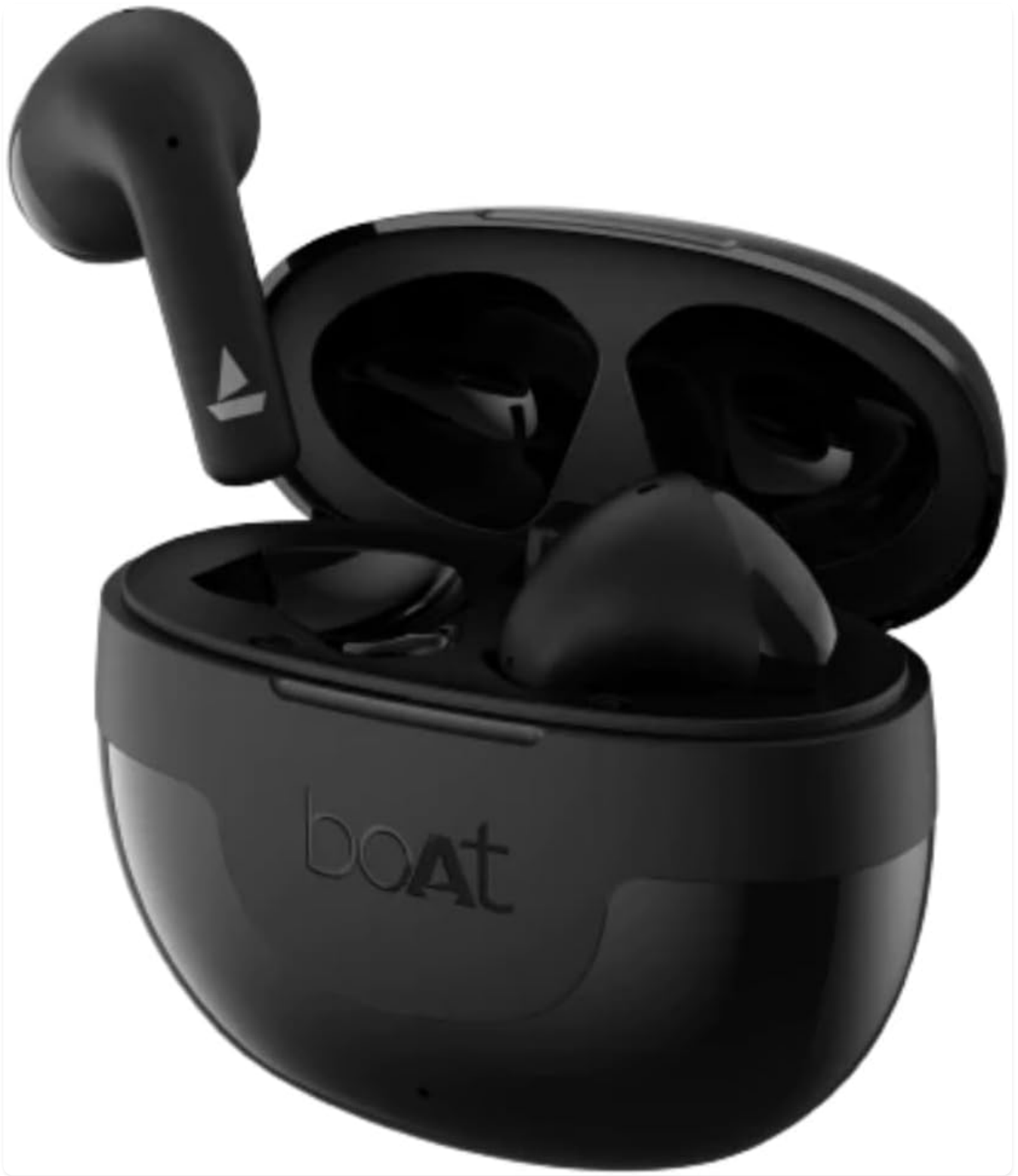
Figure 1: Boat Airdopes Hype Earbuds and Charging Case. The image displays the black earbuds nestled within their open charging case, highlighting their compact and ergonomic design.

Your browser does not support the video tag.