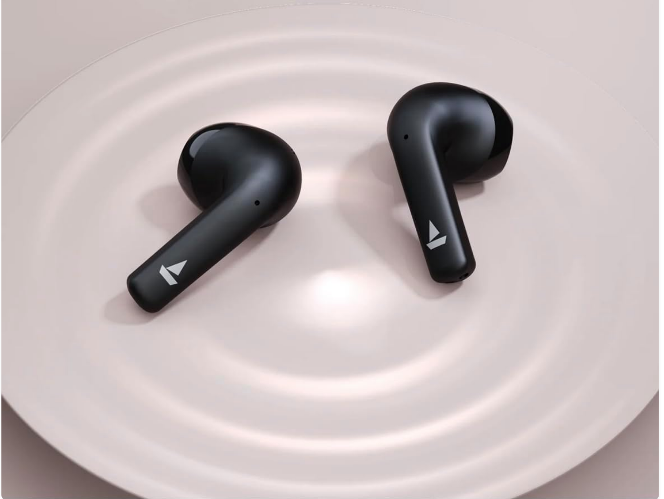
Figure 2: 13mm Drivers for Signature Sound. This image highlights the audio quality delivered by the earbuds' 13mm drivers.