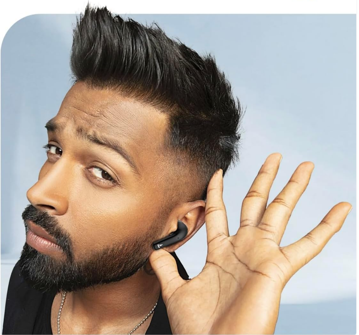
Figure 3: Dual Mics with ENx™ Technology. Demonstrates the earbud's microphone capability for clear voice transmission.