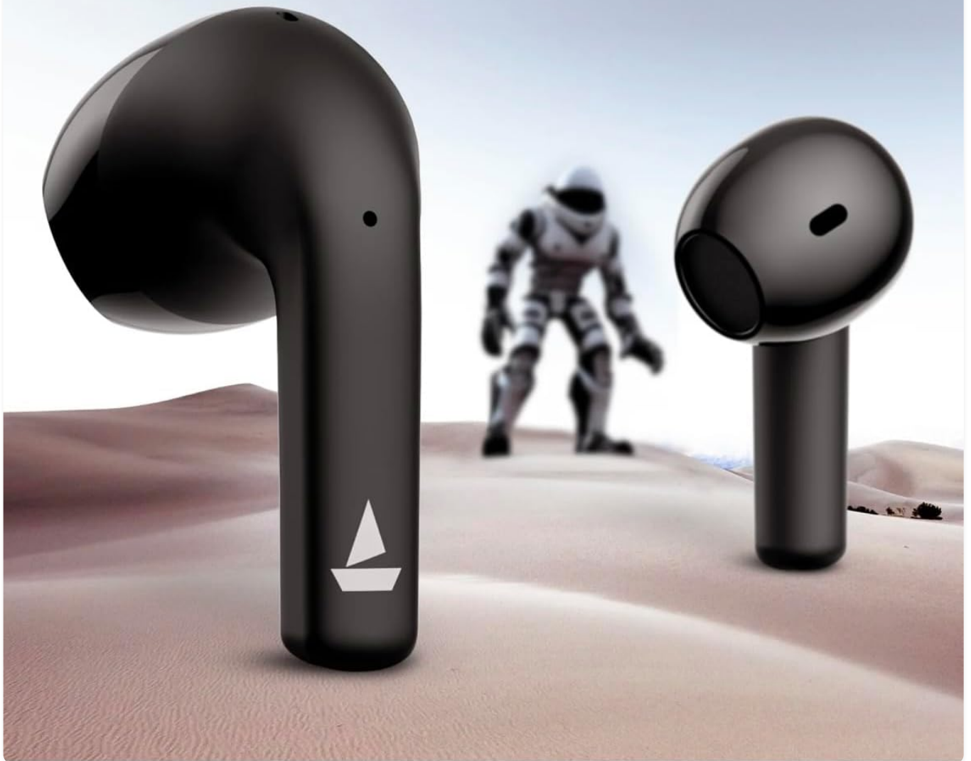
Figure 4: BEAST™ Mode for Low Latency. Illustrates the earbuds' low-latency feature, beneficial for gaming.