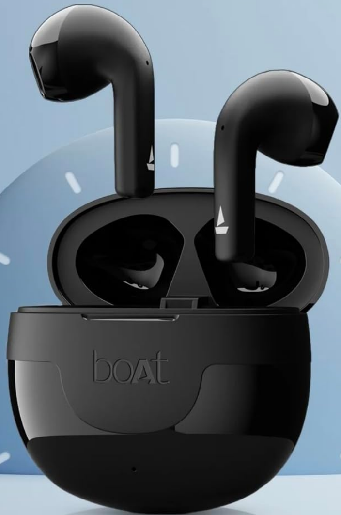
Figure 5: Extended Playback and Fast Charging. Highlights the impressive battery life and quick charging capabilities.

10 MINS ASAP™ CHARGE = 120 MINS PLAYTIME