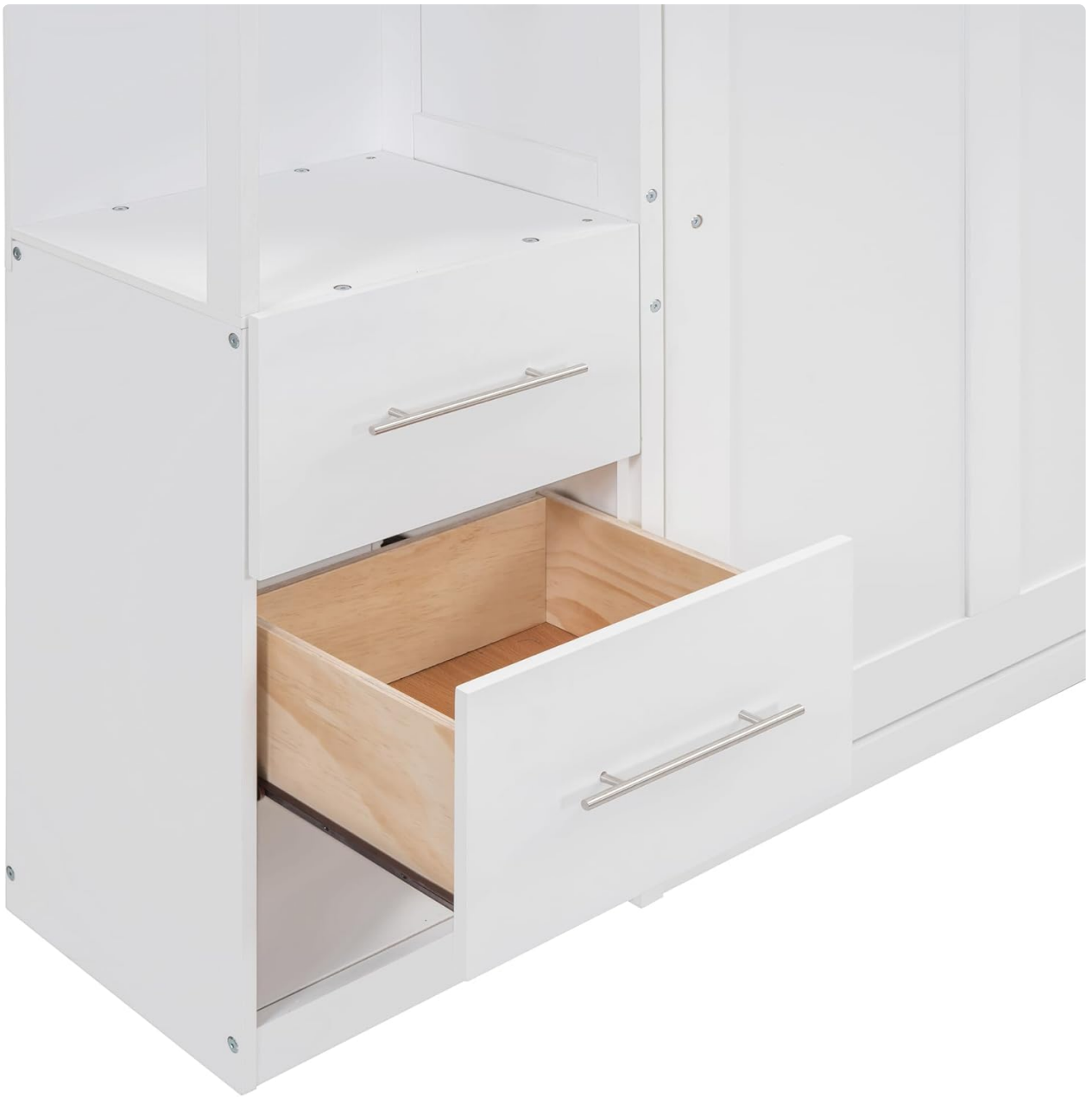
Figure 5: Detail of an open drawer, highlighting the smooth operation and storage capacity.