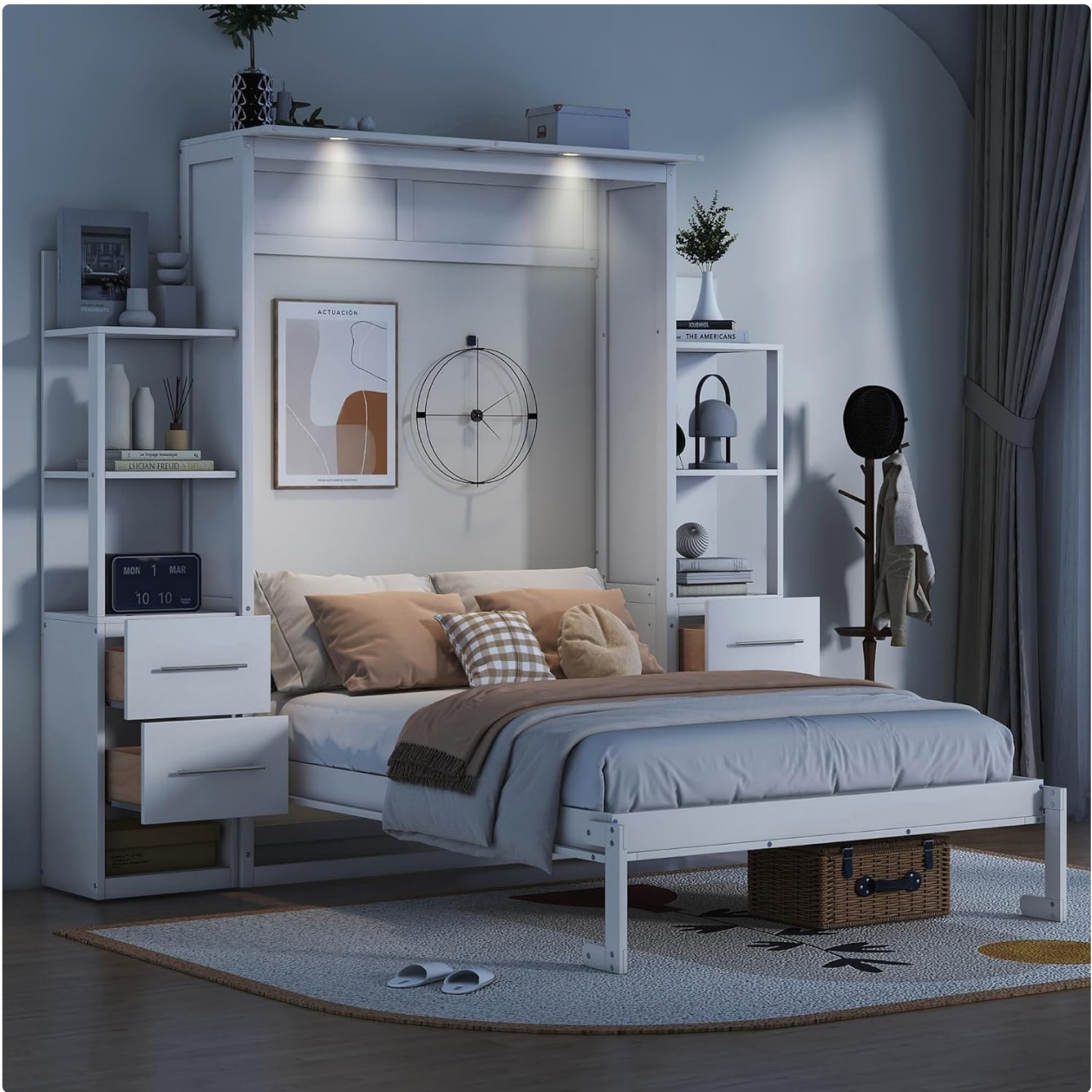
Figure 4: The Murphy bed in the open position with the integrated LED lights turned on, providing ambient lighting.