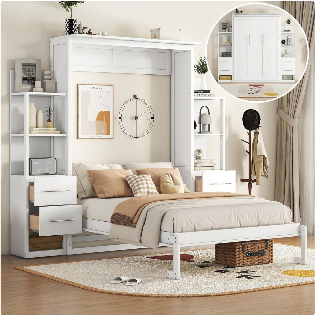
Figure 1: KLMM Full Size Murphy Bed in open position, showcasing the bed, shelves, and drawers.