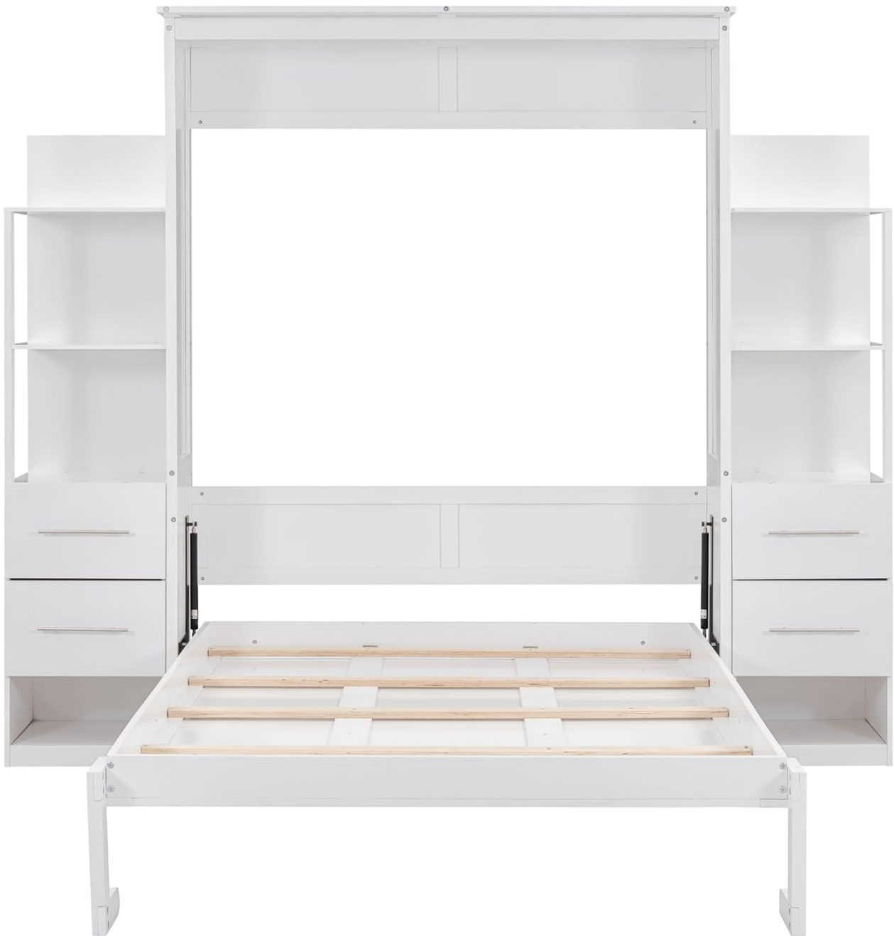
Figure 2: Detail of the bed frame and the dual-piston mechanism for raising and lowering the bed.