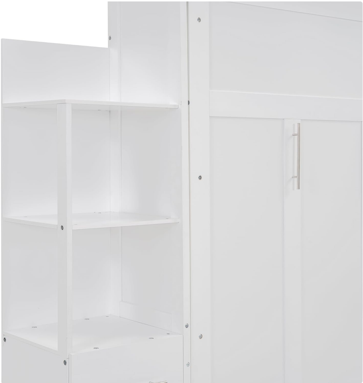
Figure 6: Detail of the integrated shelving, providing organized storage space.