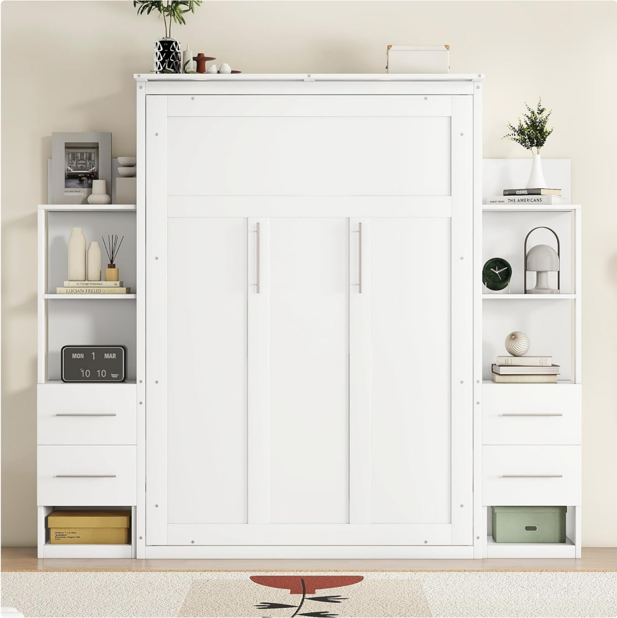
Figure 3: KLMM Full Size Murphy Bed in its closed cabinet configuration, showing the integrated shelving and drawers.

The integrated LED lights are designed to provide gentle illumination. Locate the power switch, typically near the light fixtures, to turn them on or off. These lights are ideal for reading or as a night lamp.