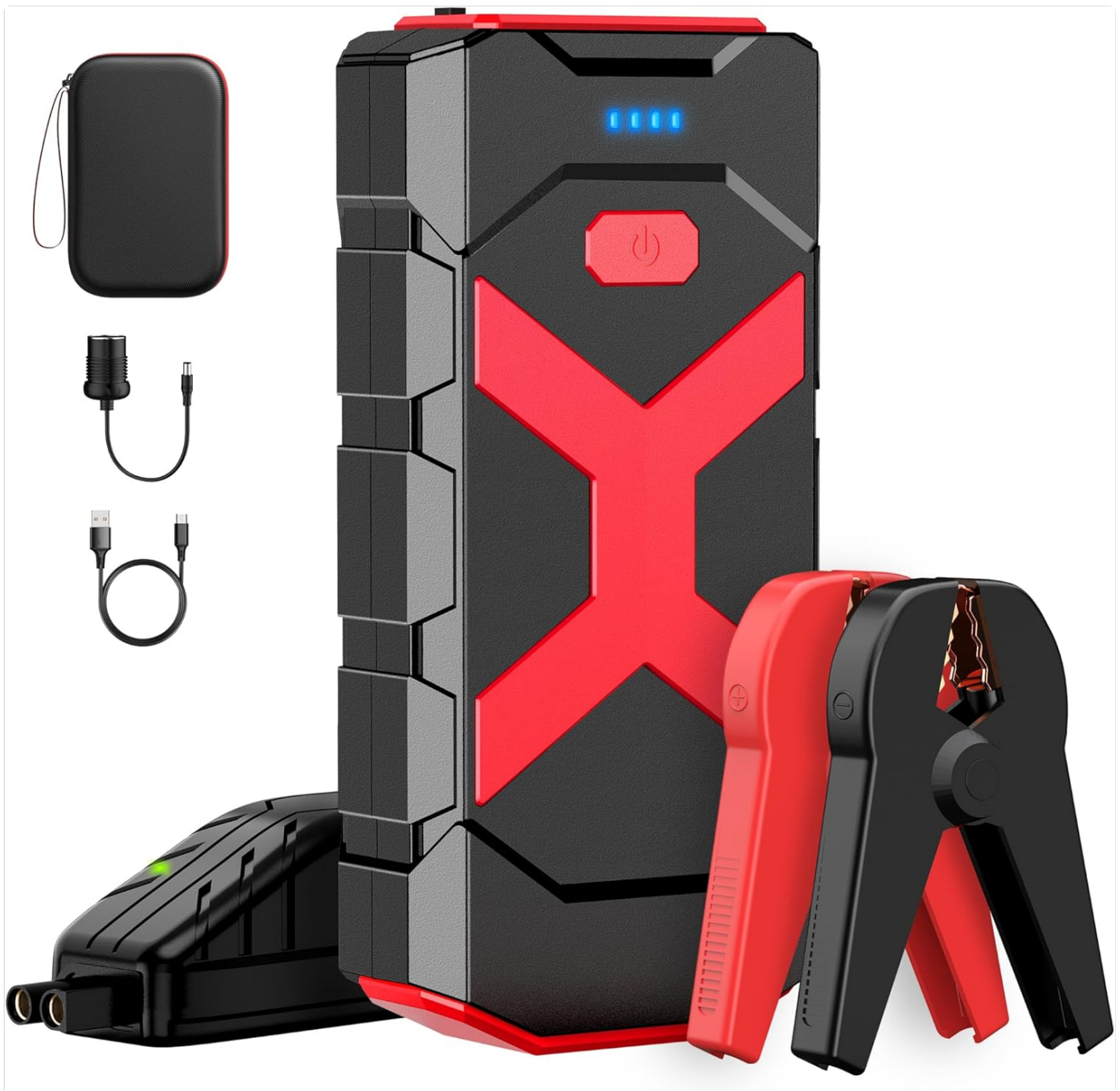
Figure 2: The Powkey Jump Starter unit shown with its accessories, including the USB cable for charging.