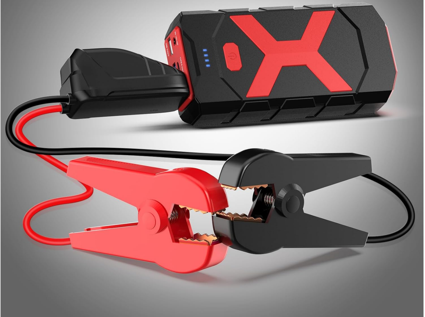
Figure 4: The intelligent smart jumper cables, designed with multiple safety protections to prevent incorrect connections and sparks.