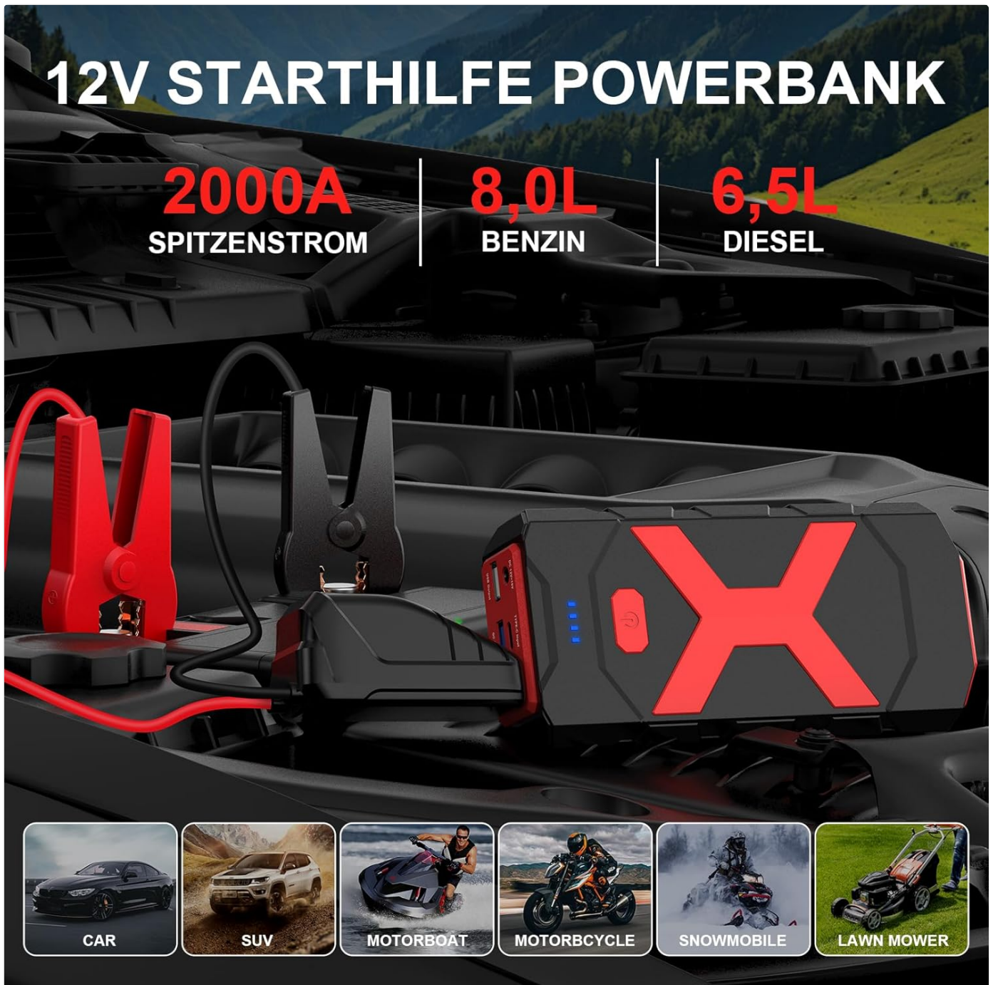
Figure 3: The Powkey Jump Starter connected to a vehicle battery using the smart clamps, ready for jump starting.