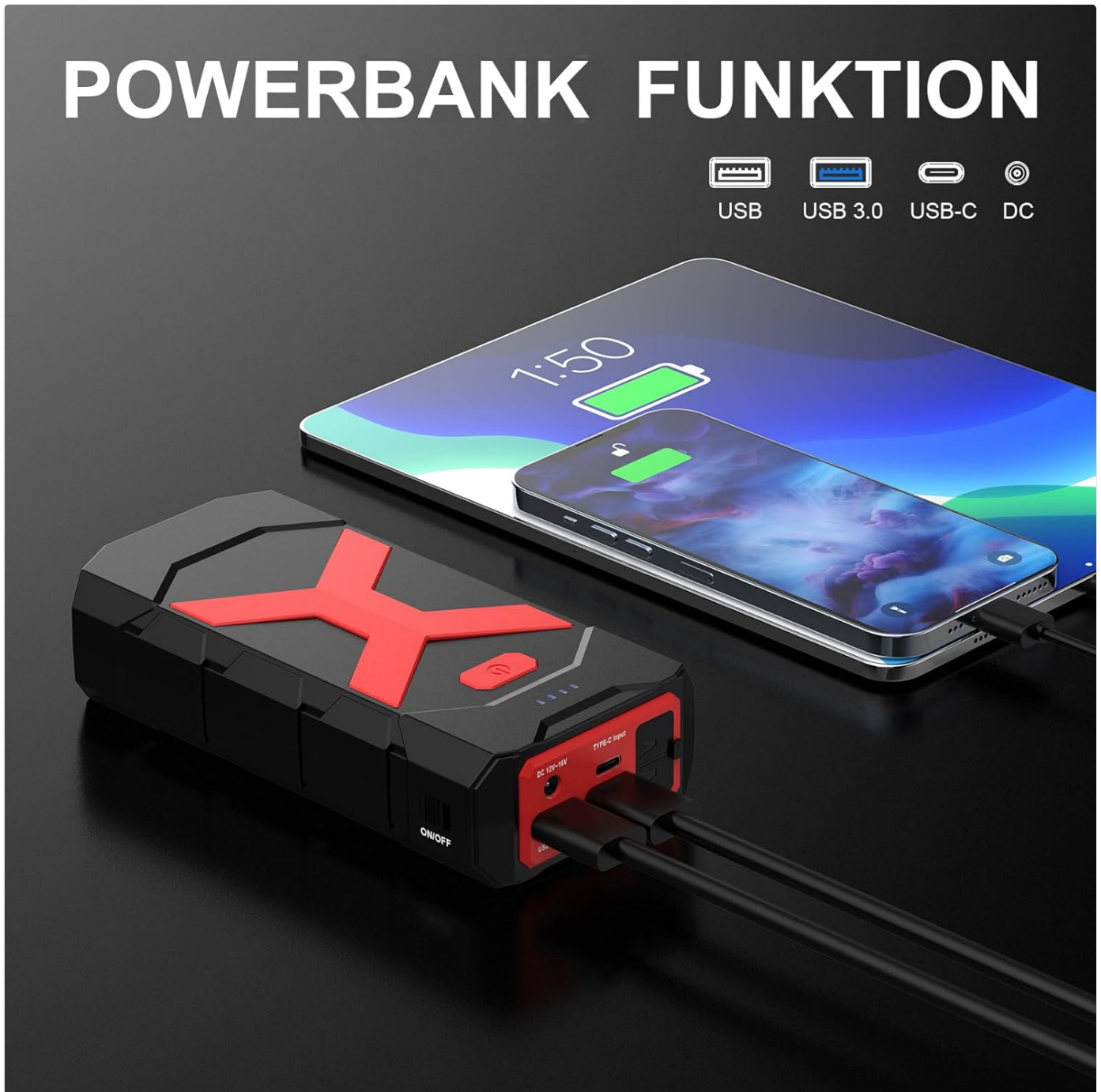
Figure 5: The Powkey Jump Starter demonstrating its power bank functionality, charging a smartphone and a tablet via its USB ports.

3. Press the power button to activate the DC output.