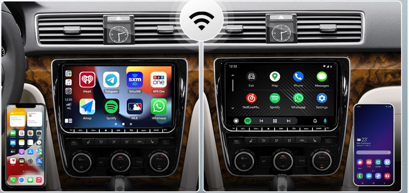
Image: Visual representation of Apple Carplay and Android Auto interfaces, demonstrating their appearance and functionality on the car radio display.