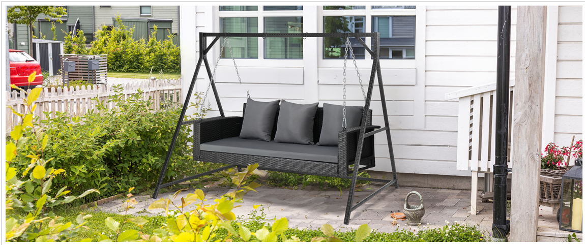
Image: The VINGLI Wicker Hanging Porch Swing shown in both sunny and rainy environments, emphasizing its durable PE rattan construction that is resistant to various weather conditions.