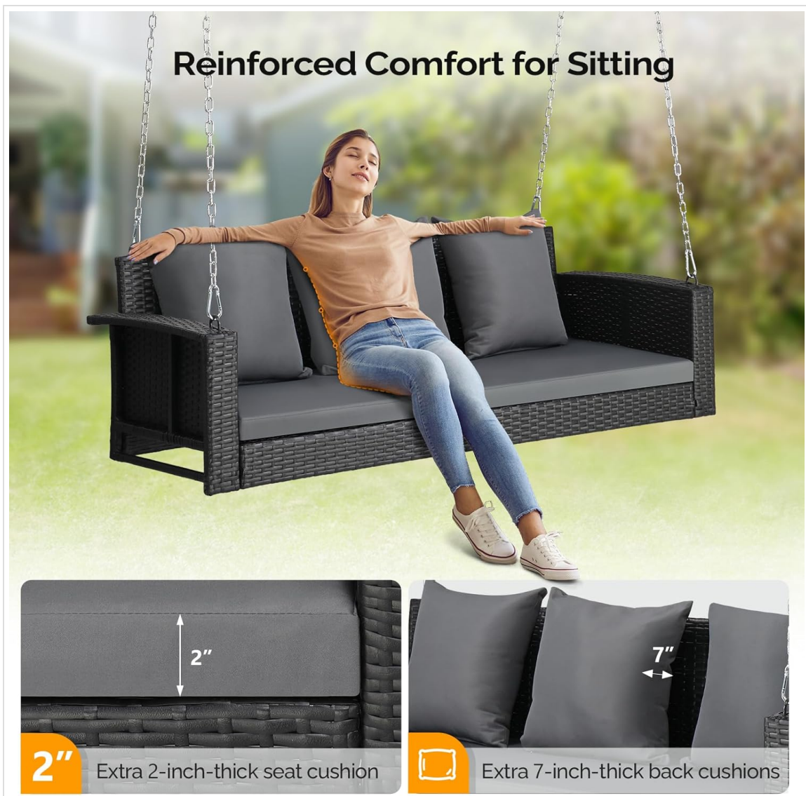
Image: The VINGLI Wicker Hanging Porch Swing fully assembled with cushions and chains, ready for installation.