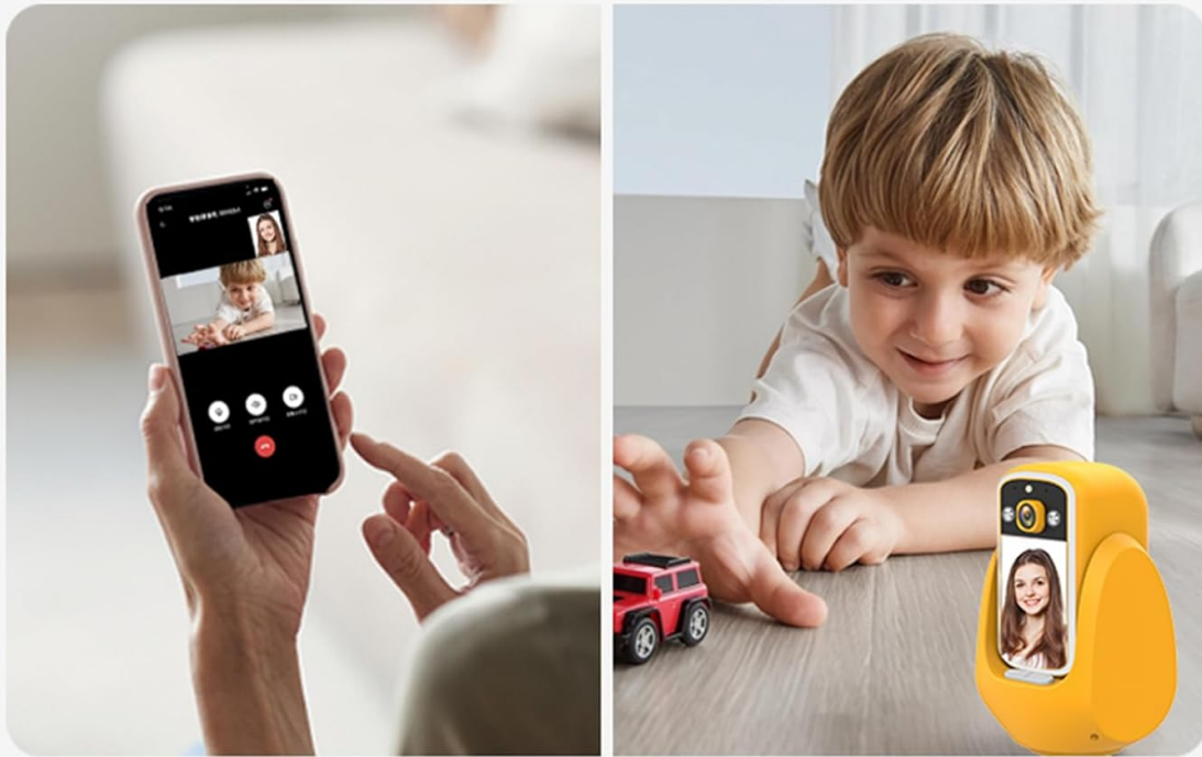
Image Description: An illustration of the two-way video feature, showing a person using a smartphone to video call the camera, and a child interacting with the camera's screen.

Both the phone and camera can initiate a video call