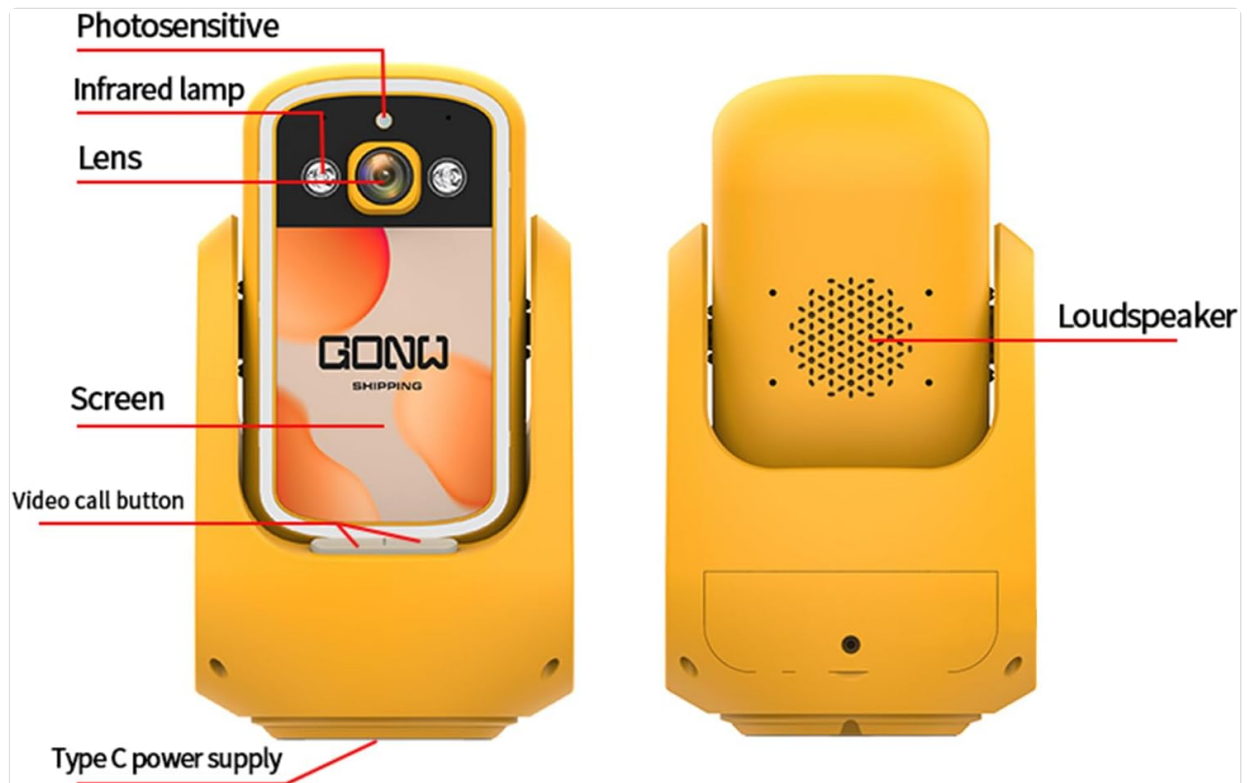
Image Description: Front and rear view of the LASTCOW C20 camera with key components labeled. The front shows the photosensitive sensor, infrared lamp, lens, 2.8-inch screen, and video call button. The rear view highlights the loudspeaker and Type-C power supply port.

The LASTCOW C20 is a versatile indoor security camera designed for monitoring and two-way video communication. It features a 2.8-inch HD screen, 1080P video resolution, night vision, and AI motion detection.