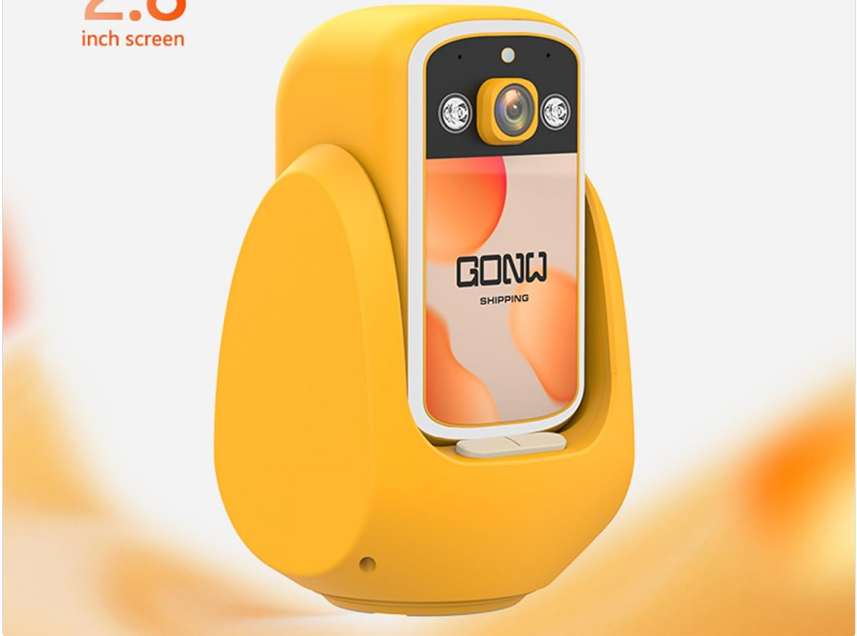
Image Description: The LASTCOW C20 camera showcasing its 2.8-inch HD screen, emphasizing a better visual experience.