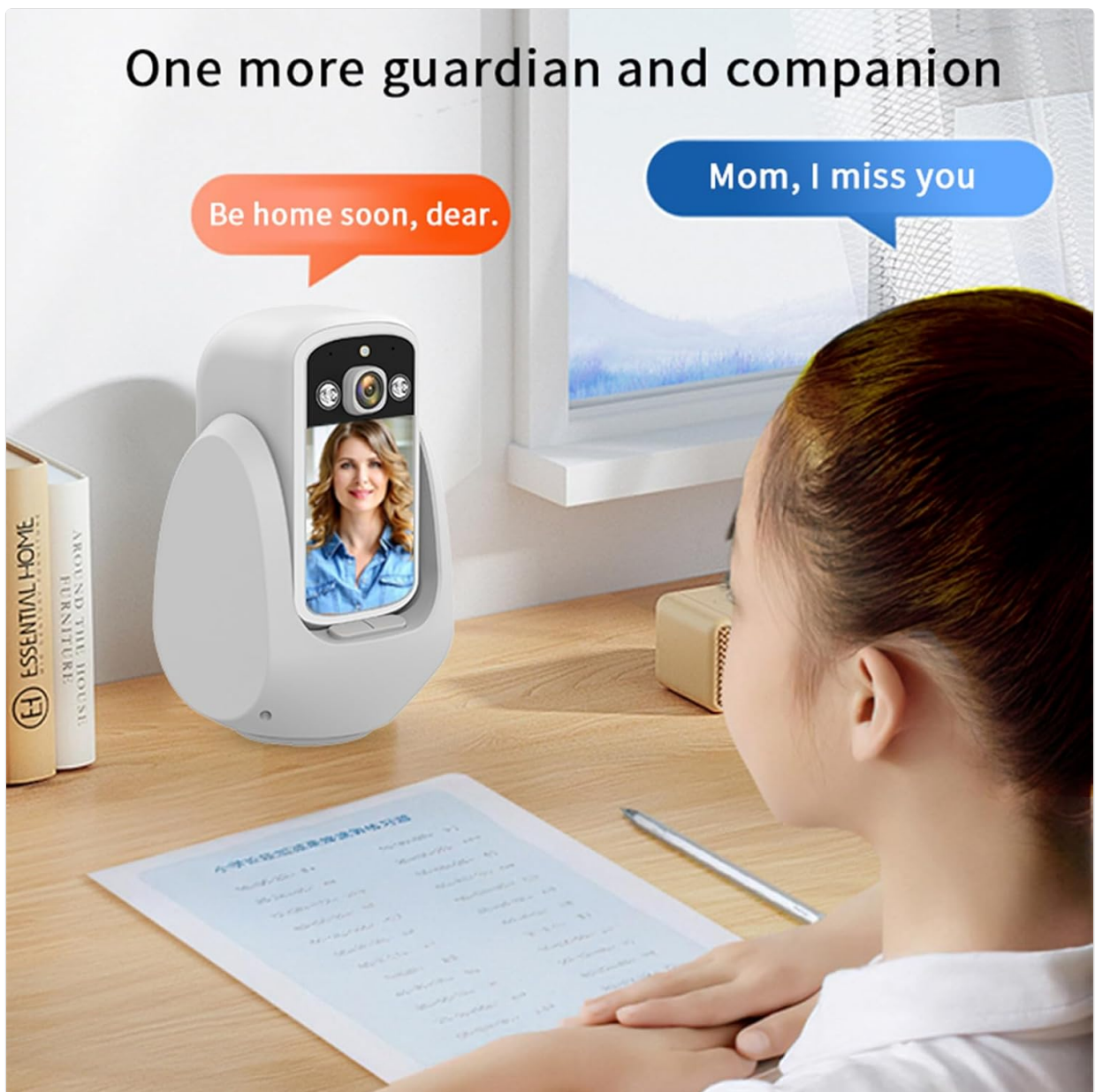
Image Description: A child sitting at a desk, looking towards the LASTCOW C20 camera, with speech bubbles indicating messages like "Be home soon, dear." and "Mom, I miss you," illustrating its use for family connection.