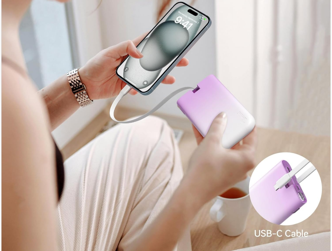
Image 5.1: Charging a device using the built-in USB-C fast charging cable.