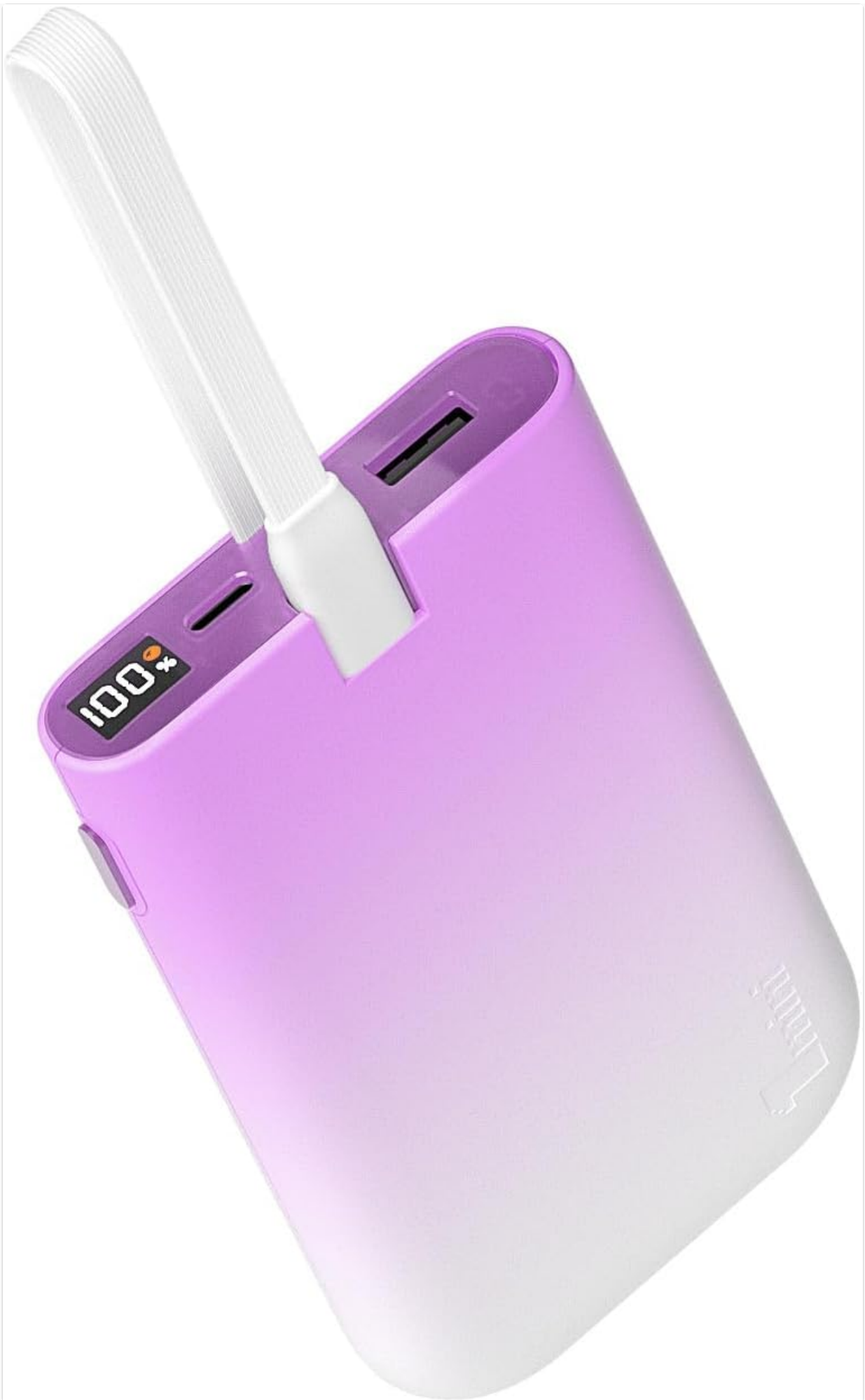
Image 1.1: The imuto 10000mAh Portable Power Bank, showcasing its compact design and built-in USB-C cable.