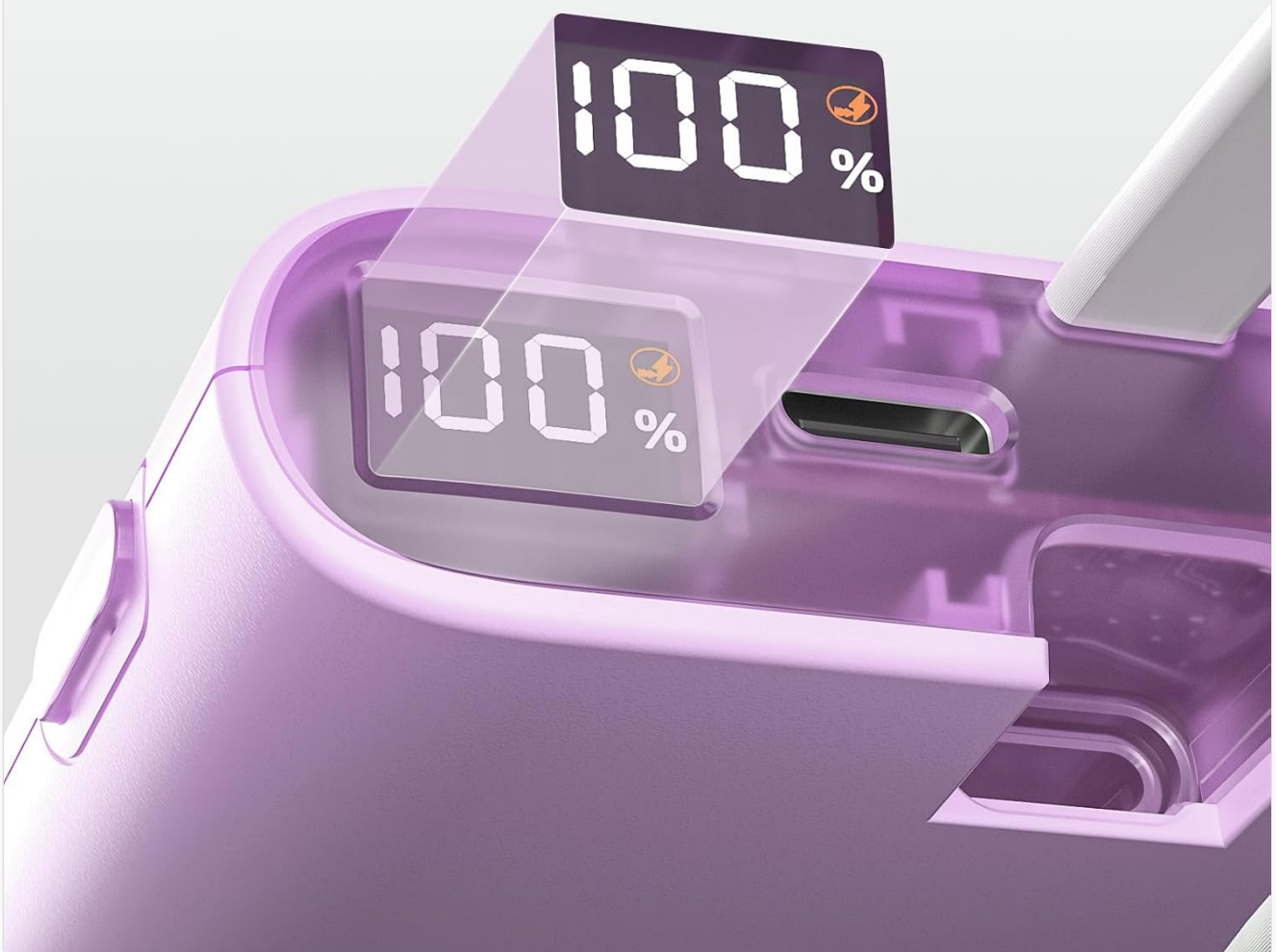
Image 1.2: The intelligent LED display indicating 100% battery charge.

Easy-to-read digital display shows exact percentage of remaining battery.