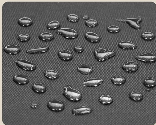
Water-Resistant PE Coating

Image: Customizable labels for sorting. Labels can be easily changed or rearranged.