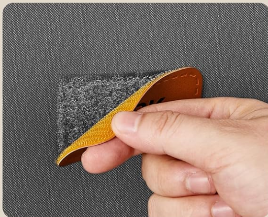
Convenient Hook-and-Loop Fasteners