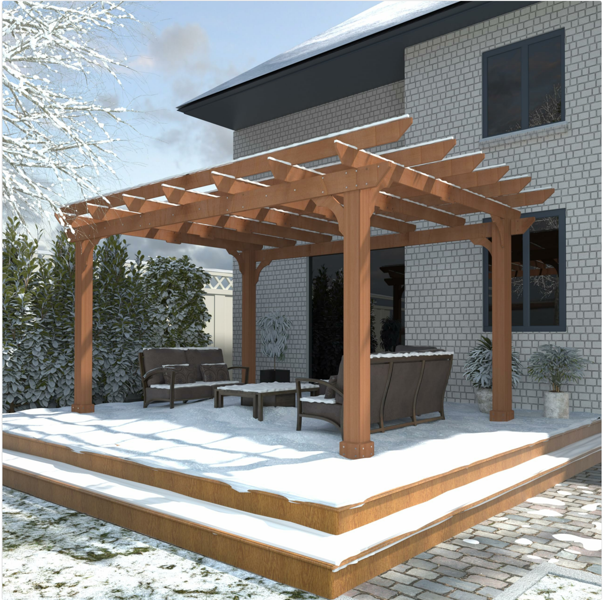
Assembled Yardenaler 10x12 FT Wooden Pergola in a backyard setting.