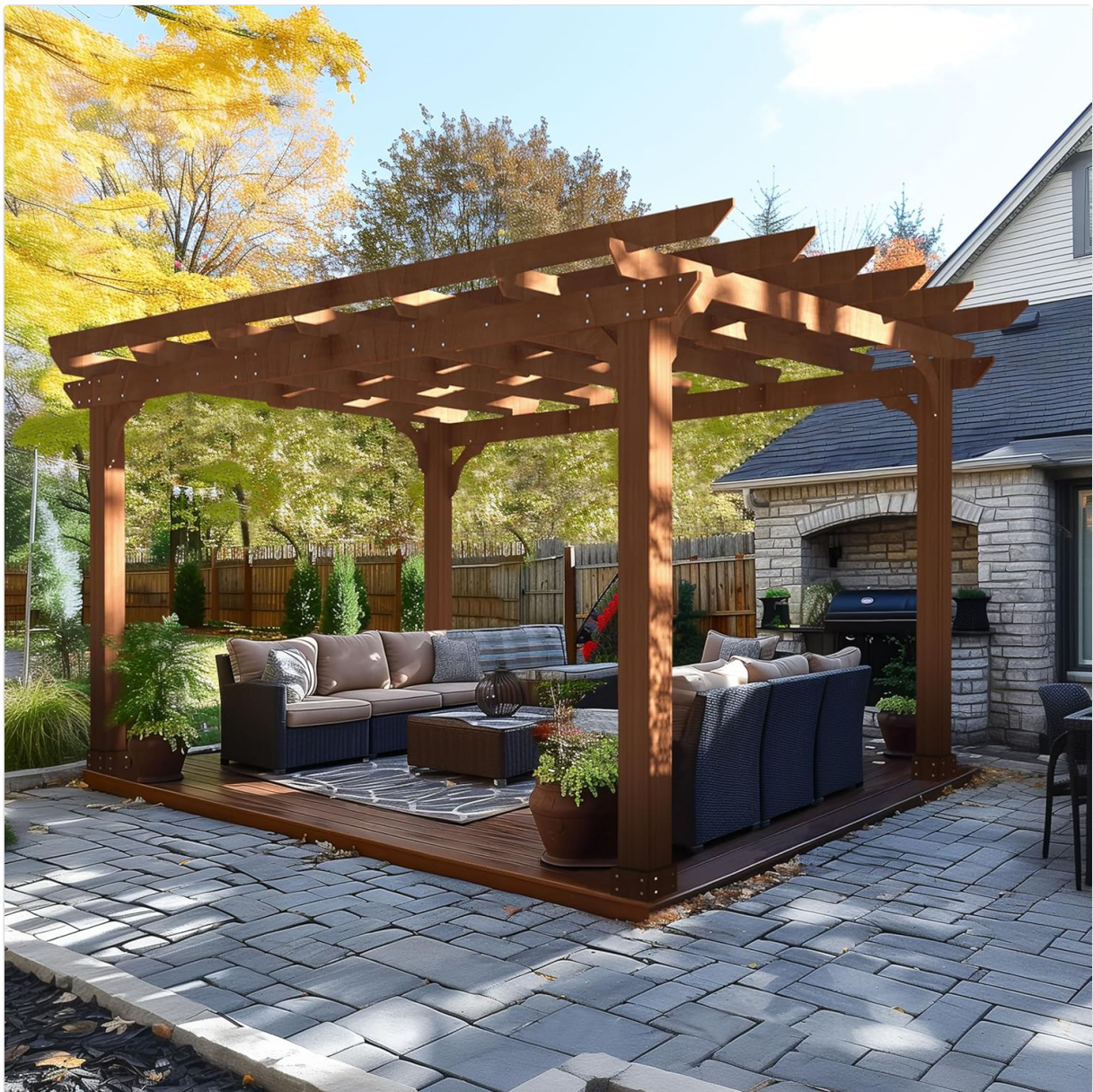
Yardenaler Wooden Pergola providing a shaded area for outdoor furniture and activities.