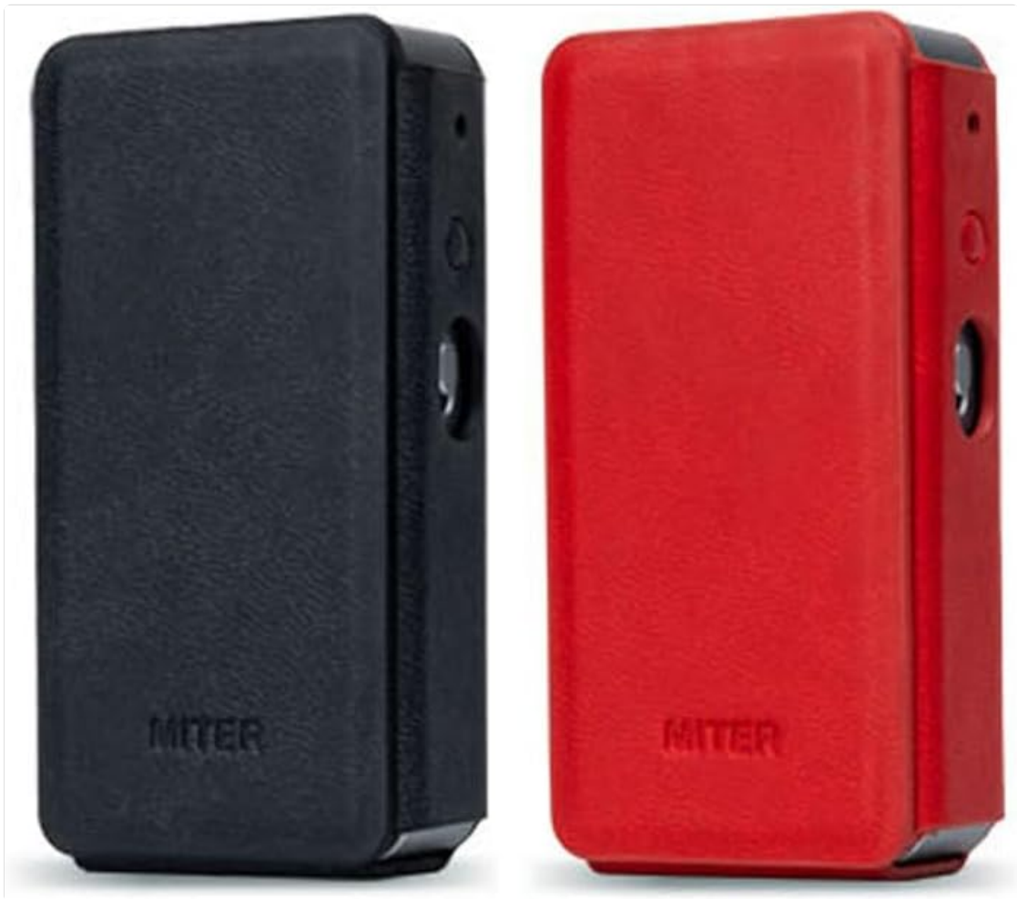
Figure 4: The MITER case is available in multiple colors, including Black (left) and Red (right).