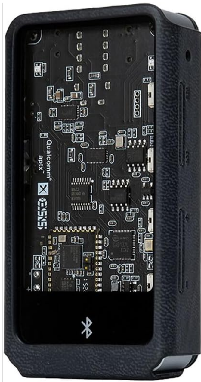
Figure 1: Front view of the Muse HiFi M4 player securely installed in the black MITER case, displaying the device's internal components.