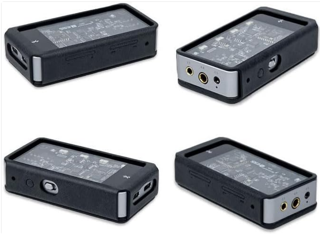
Figure 2: Various angles of the MITER case demonstrating precise cutouts for all ports and controls of the Muse HiFi M4 player.