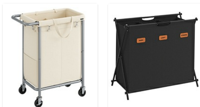
Images: Demonstrating the ease of removing and carrying the individual laundry bags.

Each laundry bag is designed for easy removal. Simply lift the bag by its metal handles from the hooks on the frame. This allows you to transport individual loads of laundry directly to your washing machine without moving the entire sorter.