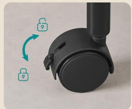
Image: Demonstrates the removable bags and the lockable swivel casters for easy movement and stability.