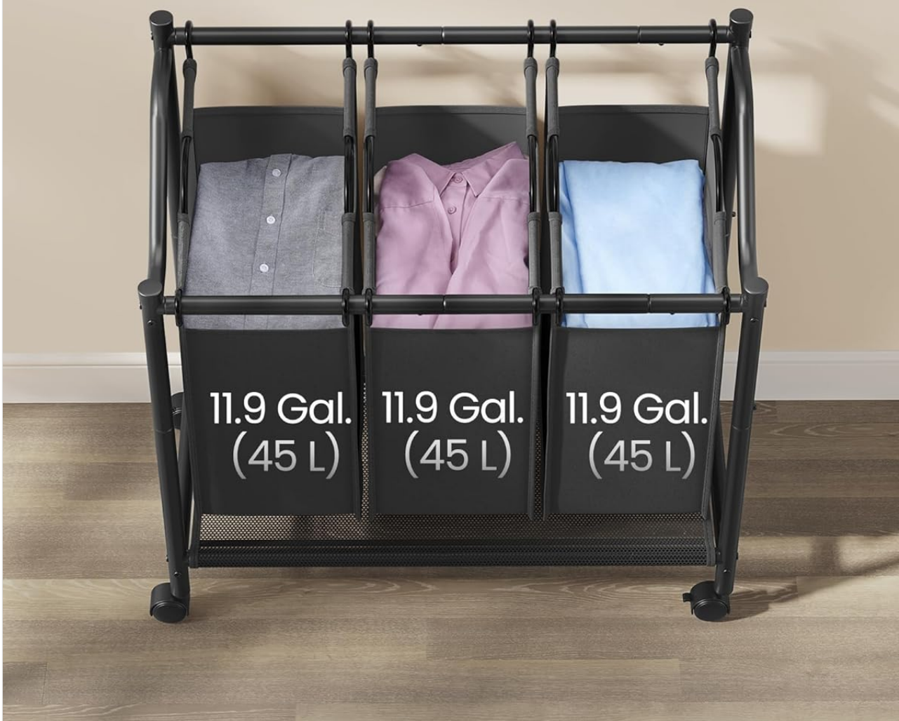
Image: Visual representation of the sorter's capacity, highlighting the 35.7-gallon total volume and individual bag capacities.