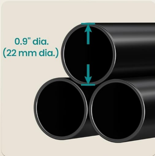
Sturdy Steel Tubes

Robust steel frame and thick bags provide a max. load of 66 lb (30 kg)