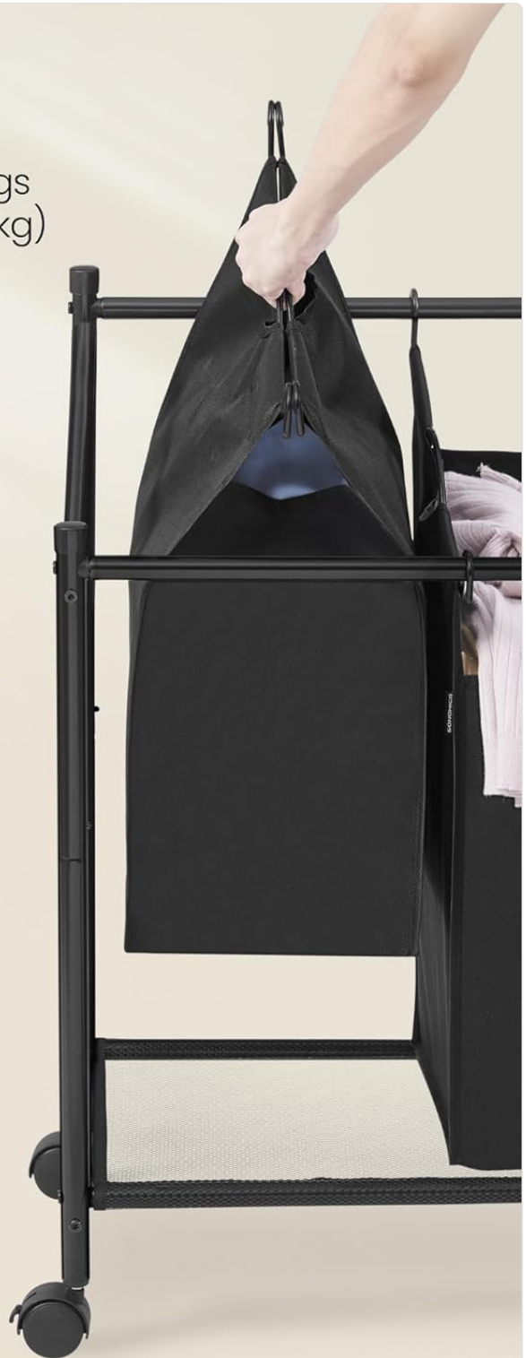
Image: Details of the robust steel tube frame and the water-resistant properties of the Oxford fabric bags.