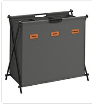
Image: Illustrates the water-resistant nature of the bag material.

The PVC-coated 600D Oxford fabric bags are water-resistant and designed for easy cleaning. For general cleaning, wipe the interior and exterior surfaces with a damp cloth and mild detergent. Allow to air dry completely before re-attaching to the frame.