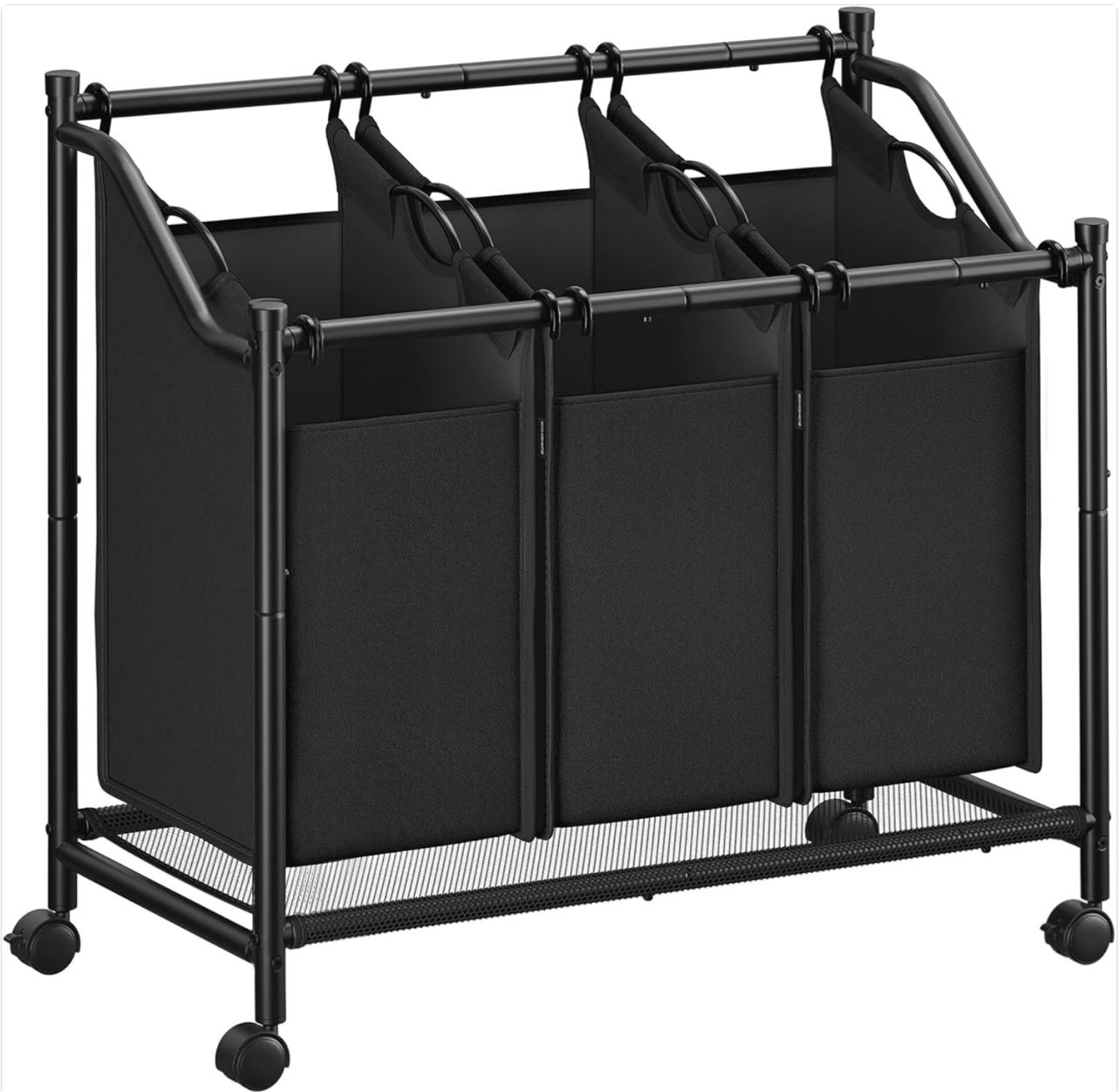
Image: The SONGMICS Laundry Sorter, a three-bag unit designed for efficient laundry organization.