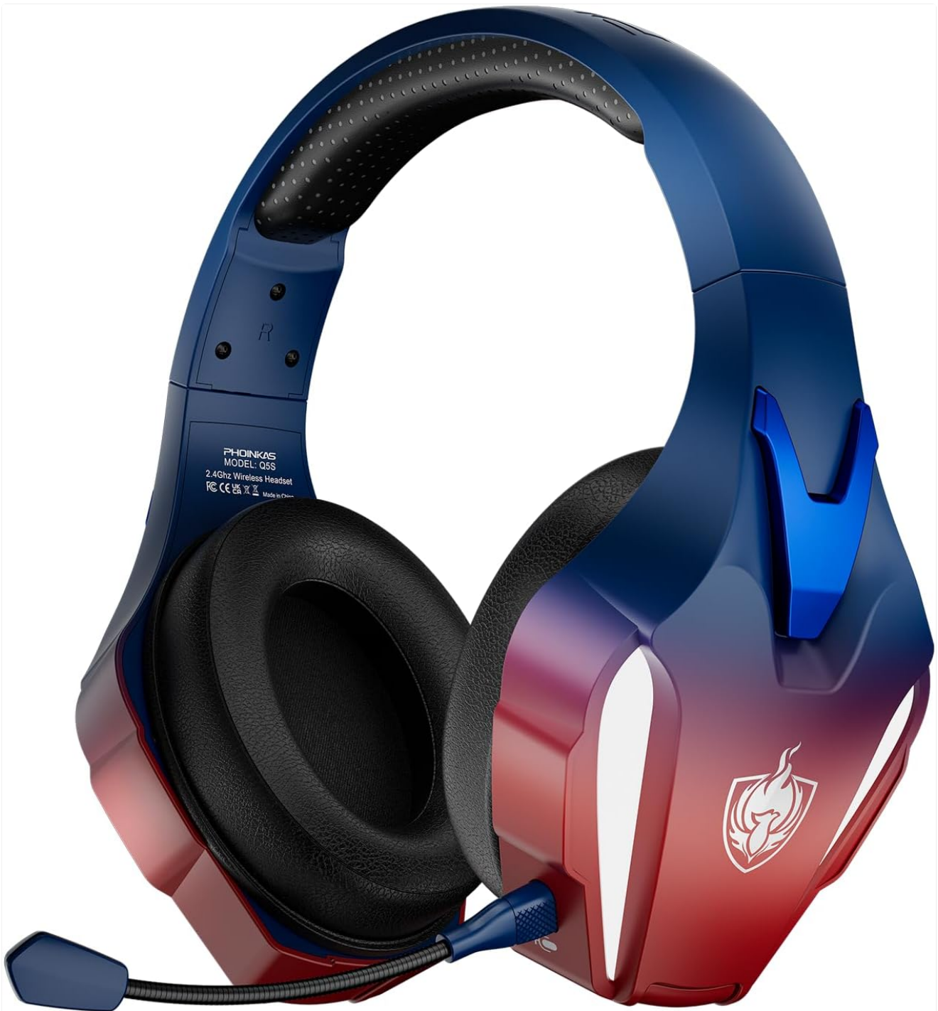
Image: The PHOINIKAS Q5S Wireless Gaming Headset in Navy Blue, showcasing its design with red and blue accents and a detachable microphone.