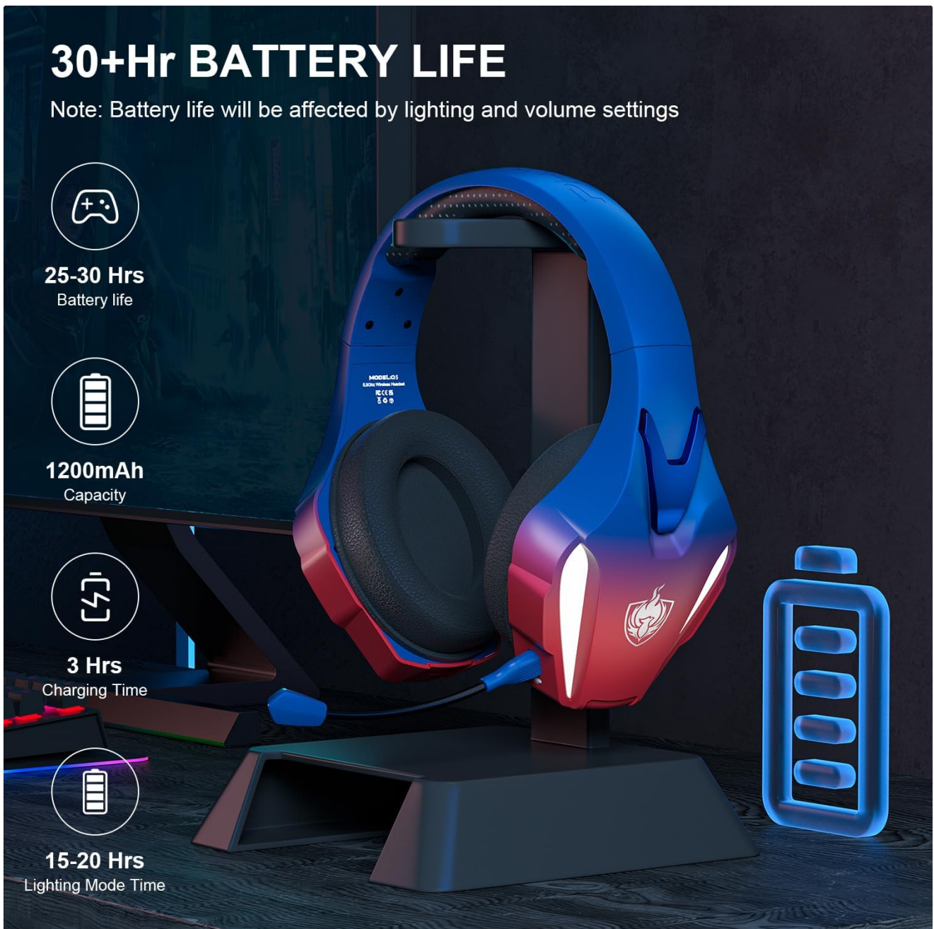
Image: The PHOINIKAS Q5S headset on a stand, with icons indicating 25-30 hours battery life, 1200mAh capacity, 3 hours charging time, and 15-20 hours lighting mode time.