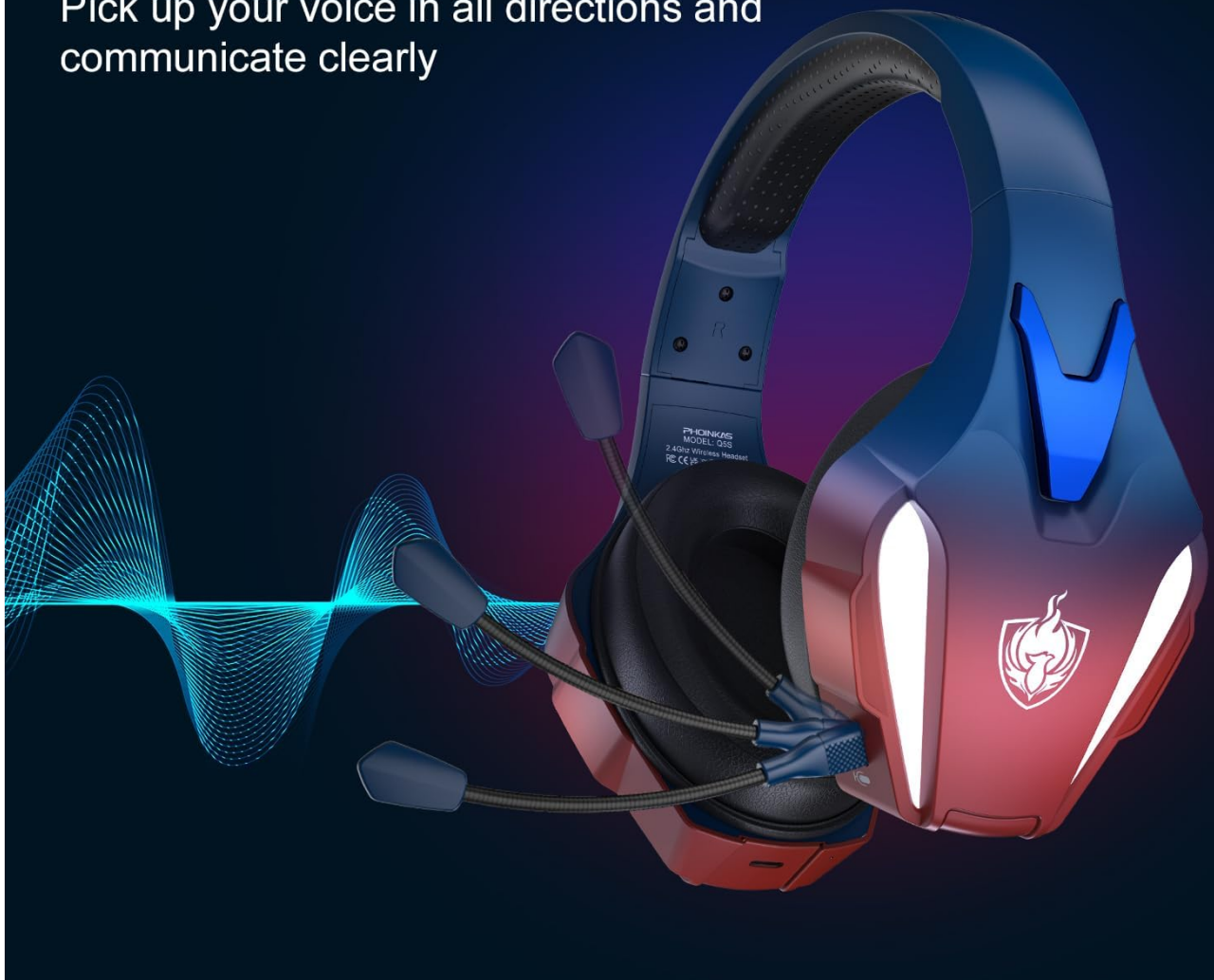
Image: The PHOINIKAS Q5S headset with its flexible, detachable noise-canceling microphone attached, illustrating its function to pick up voice clearly.

Pick up your voice in all directions and communicate clearly