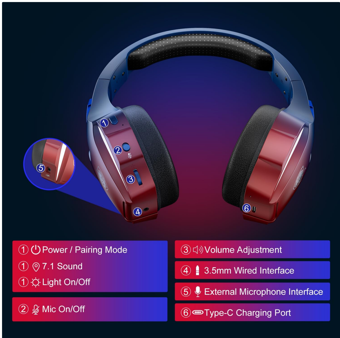
Image: A detailed diagram highlighting the control buttons and ports on the PHOINIKAS Q5S headset.

Familiarize yourself with the various controls and ports on your PHOINIKAS Q5S headset: