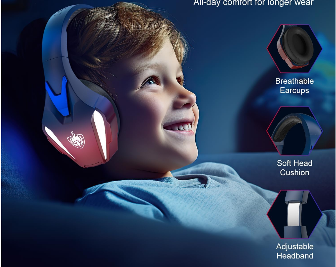
Image: A child wearing the PHOINIKAS Q5S headset, illustrating its comfortable and ergonomic design with breathable earcups, soft head cushion, and adjustable headband.