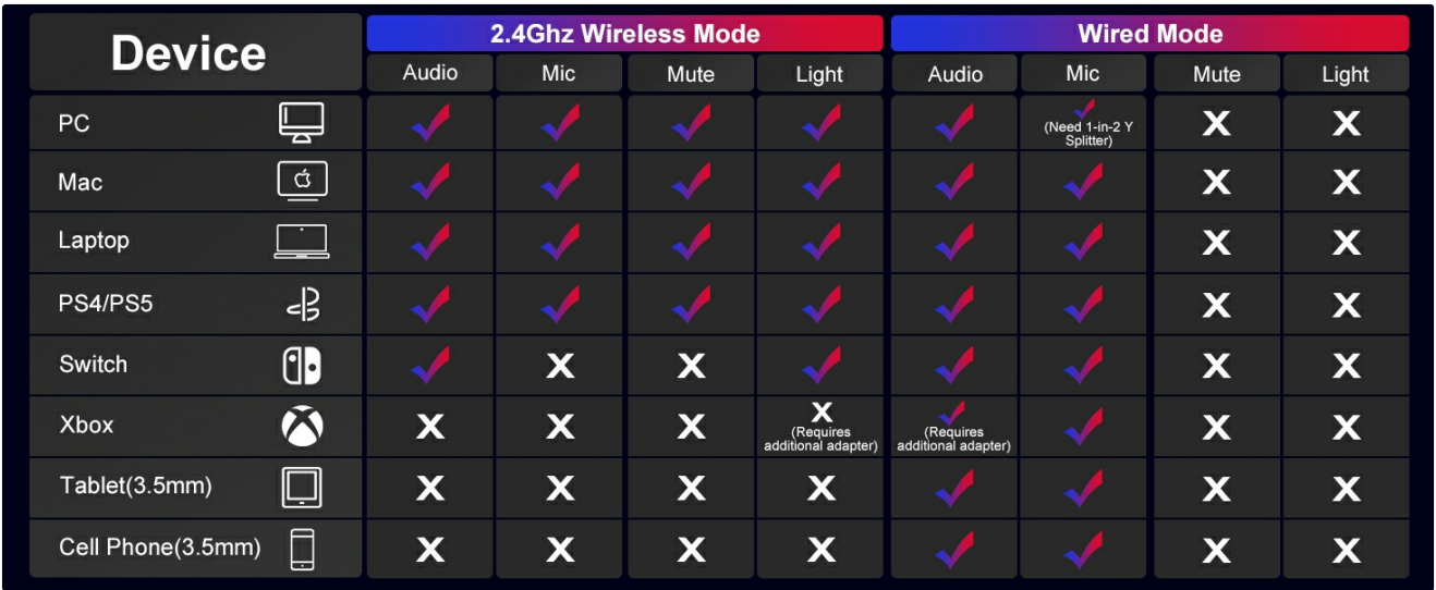
Image: A detailed compatibility table showing which features (Audio, Mic, Mute, Light) are supported on different devices (PC, Mac, Laptop, PS4/PS5, Switch, Xbox, Tablet, Cell Phone) in both 2.4GHz Wireless Mode and Wired Mode.