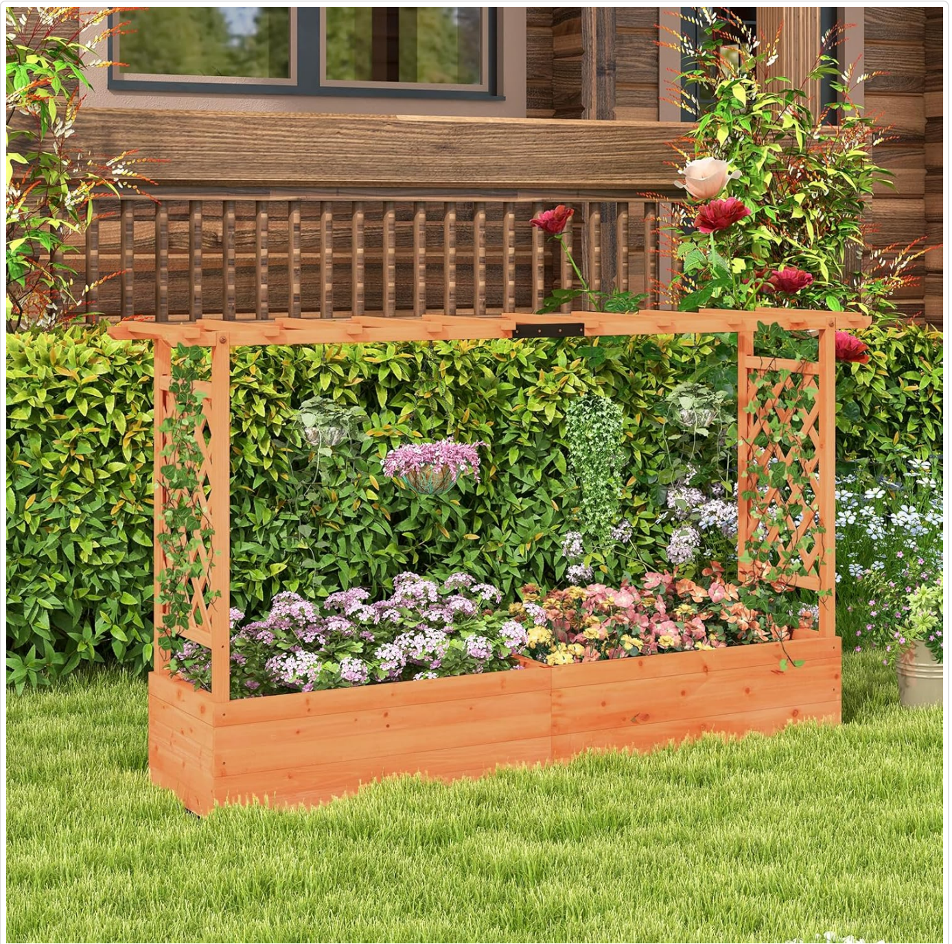
Figure 2: The assembled garden bed in an outdoor environment.

For best results, assemble the garden bed in its intended final location to avoid unnecessary movement after assembly.