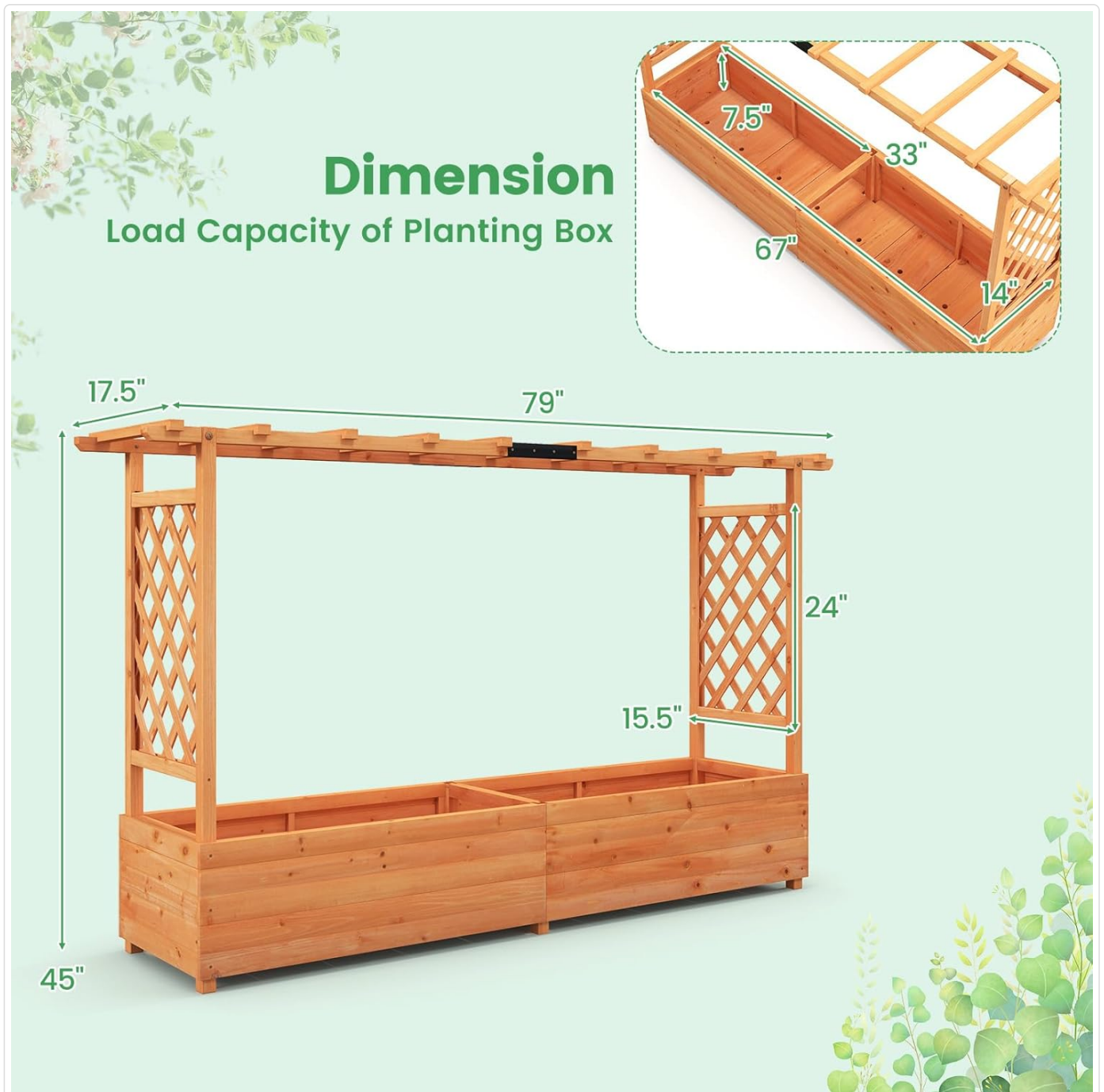
Figure 7: Detailed dimensions of the garden bed.