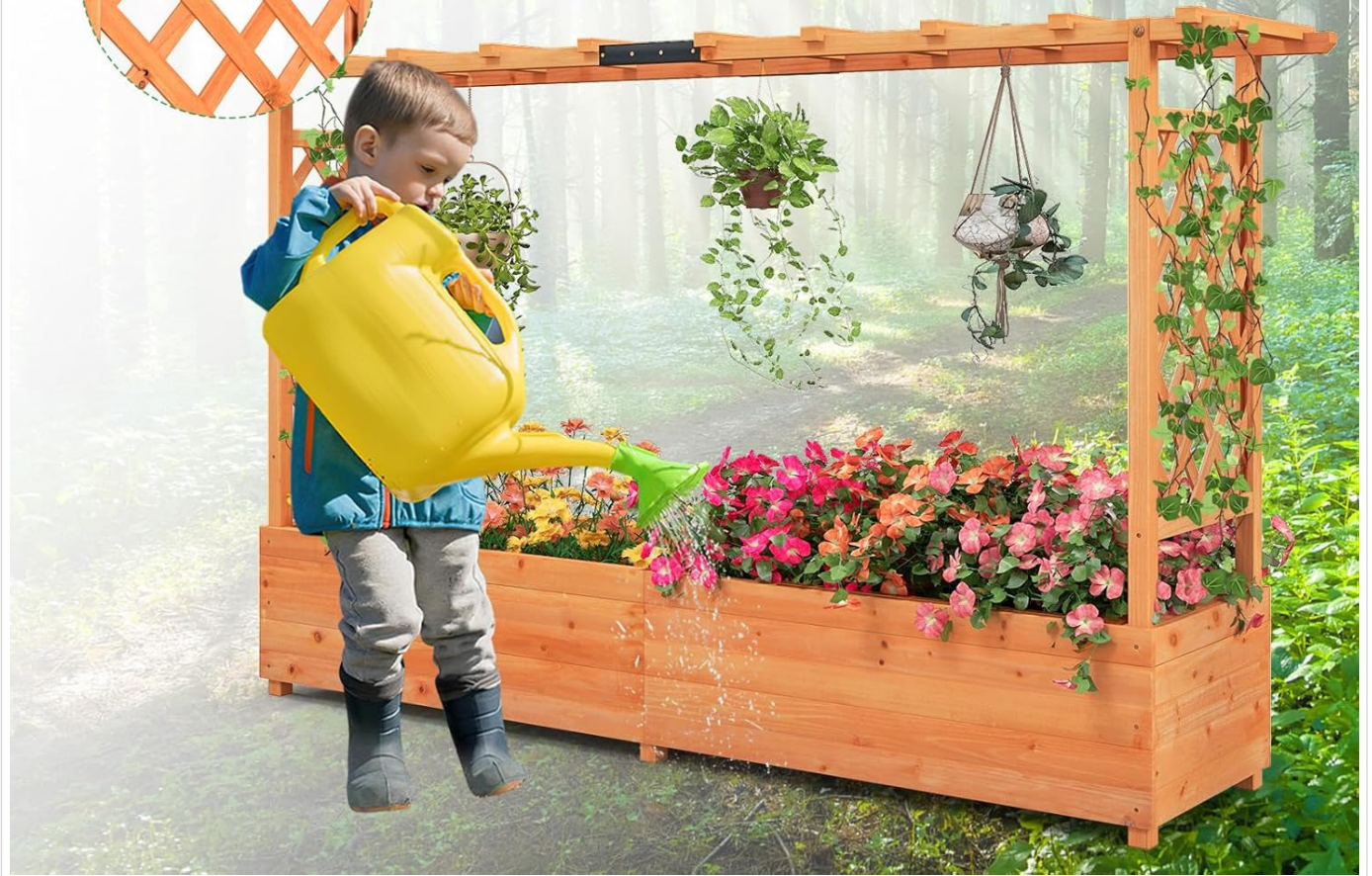
Figure 6: Features of the natural fir wood construction.