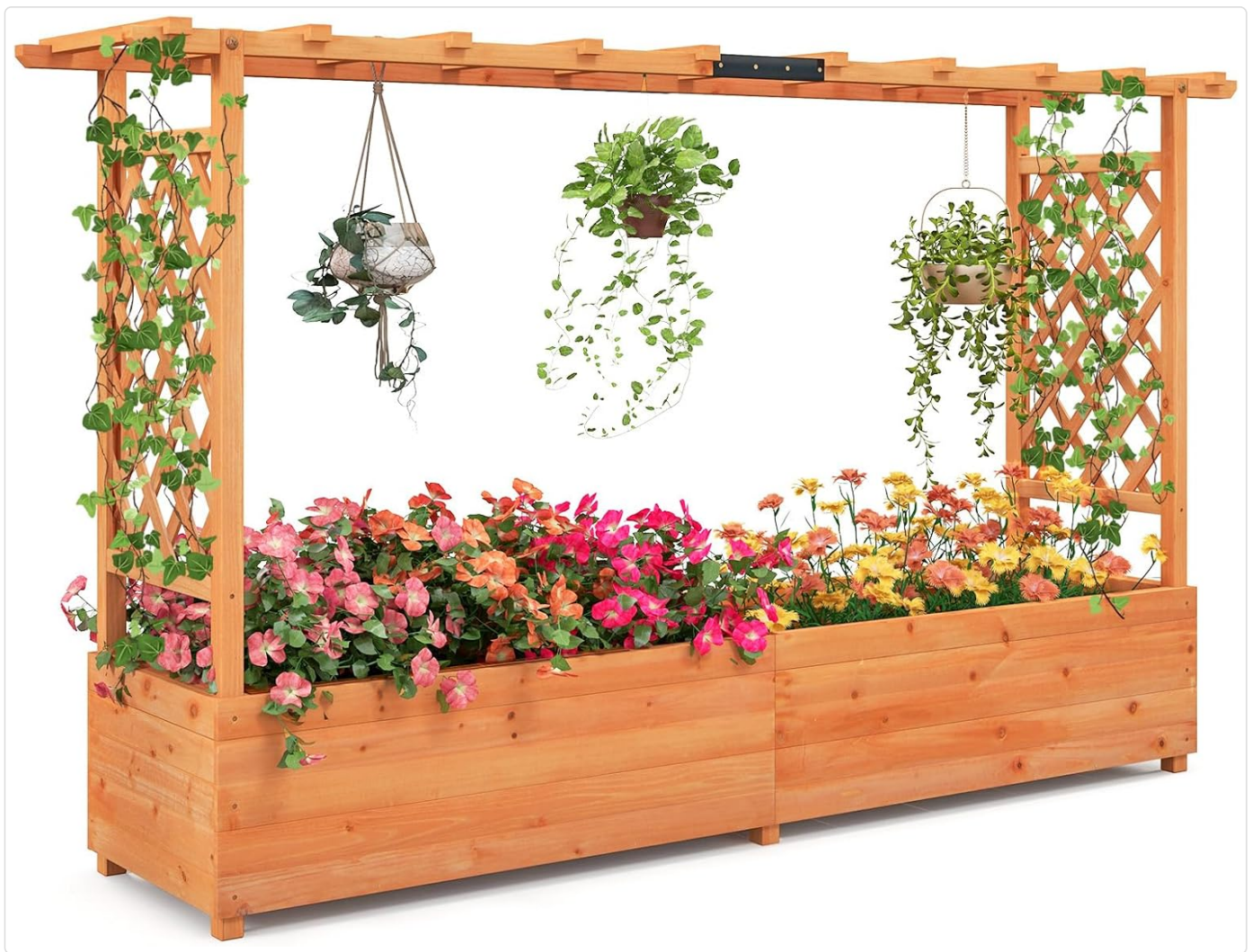
Figure 1: Overview of the Giantex Raised Garden Bed with Trellis & Hanging Roof.

This garden bed is suitable for various outdoor settings, including gardens, backyards, patios, and decks, offering a sturdy and weather-resistant solution for cultivating flowers, vegetables, fruits, and herbs.