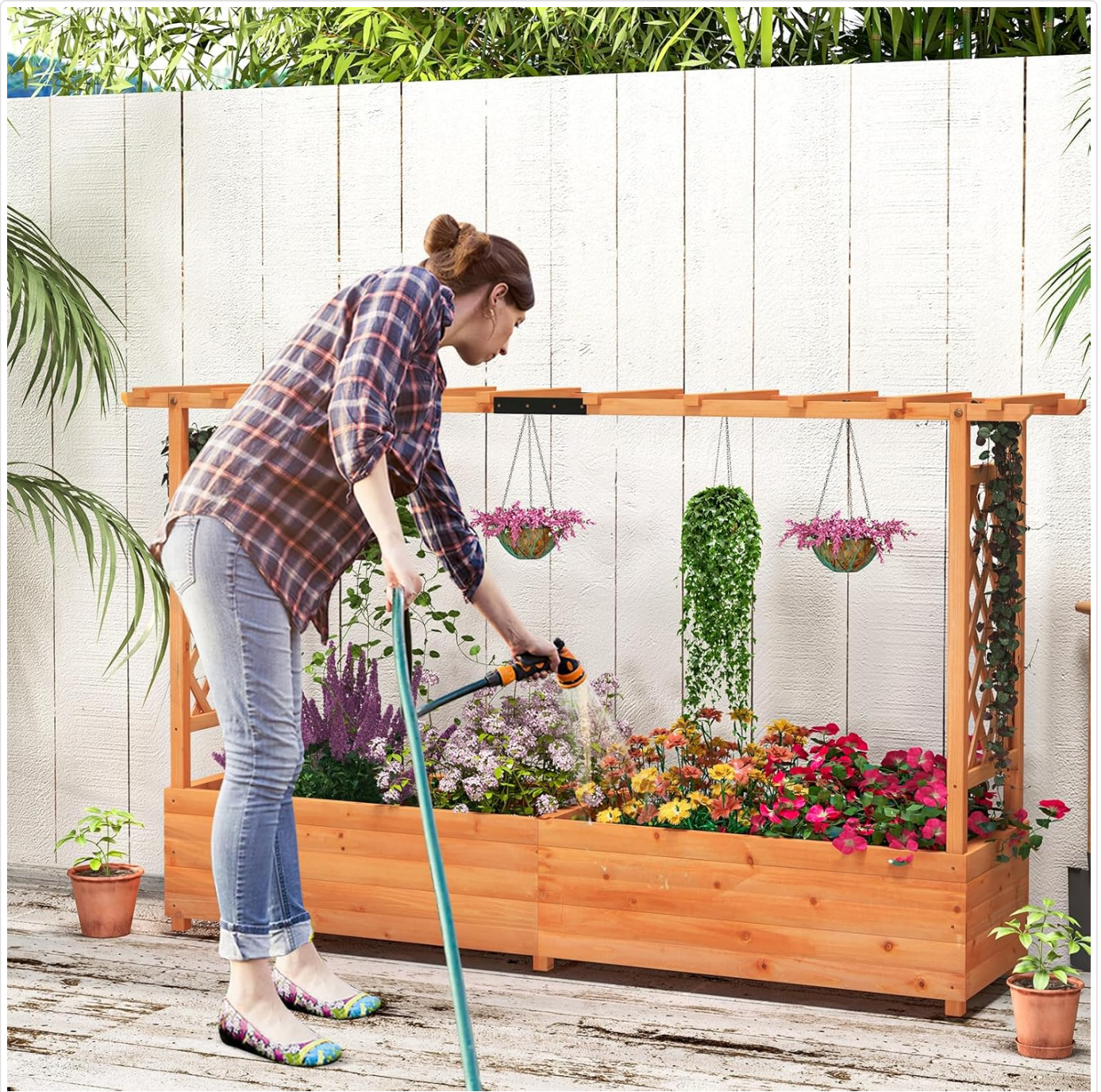
Figure 5: Watering the garden bed.