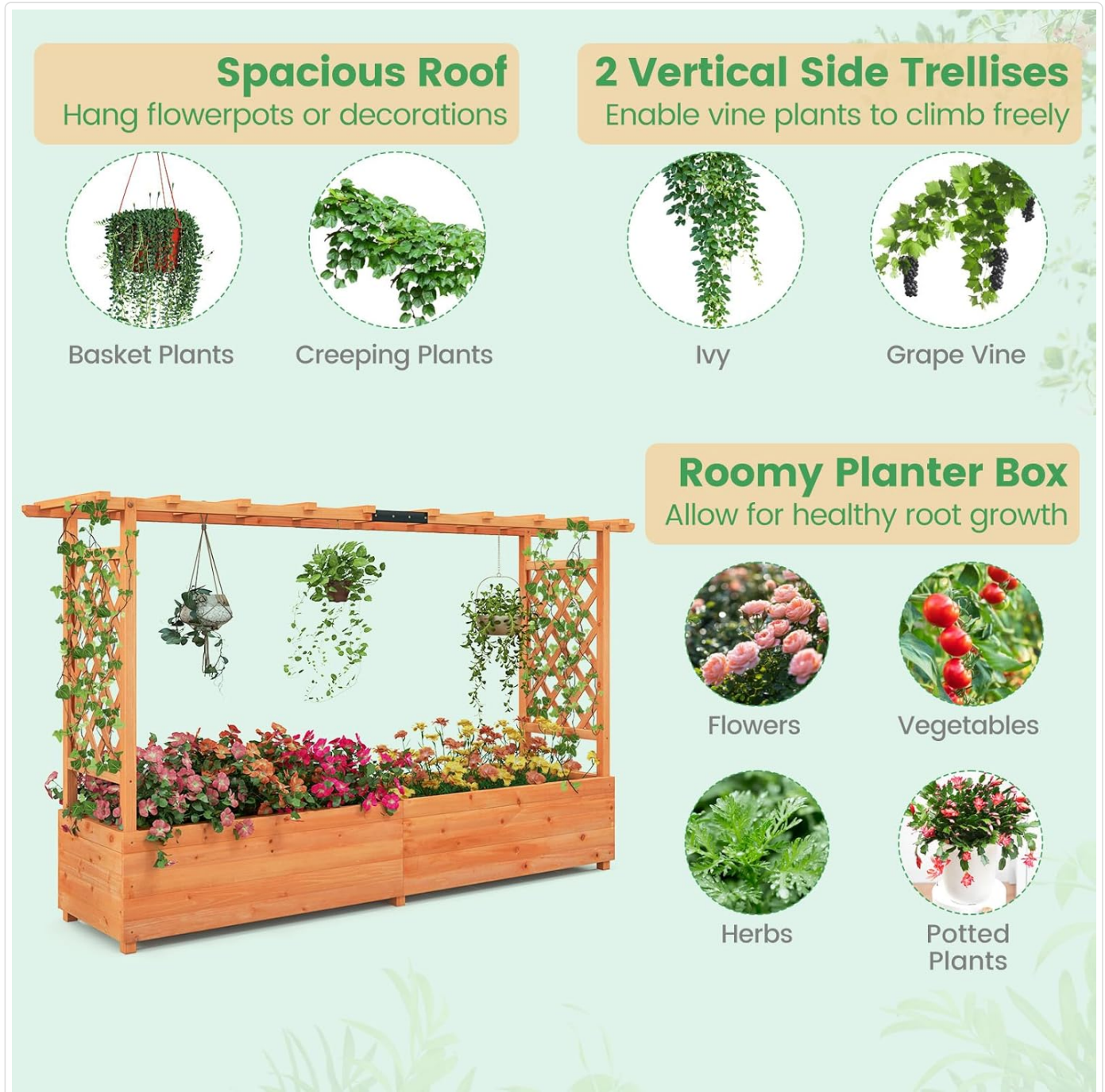
Figure 3: Key features for planting and display.