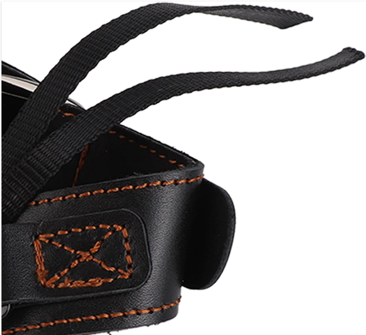
Figure 4.2: Close-up of the wrist strap and the rod attachment point, where adjustments are made.