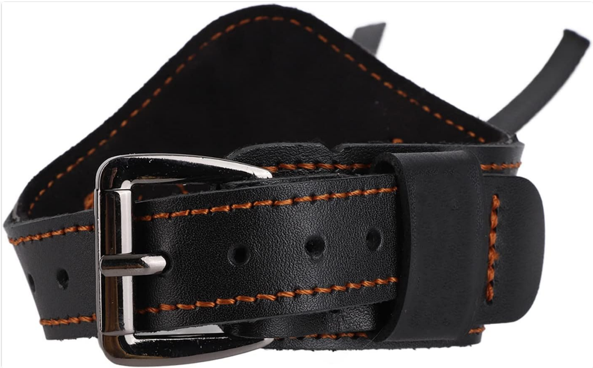
Figure 4.1: Close-up of the wrist strap buckle for adjustment.