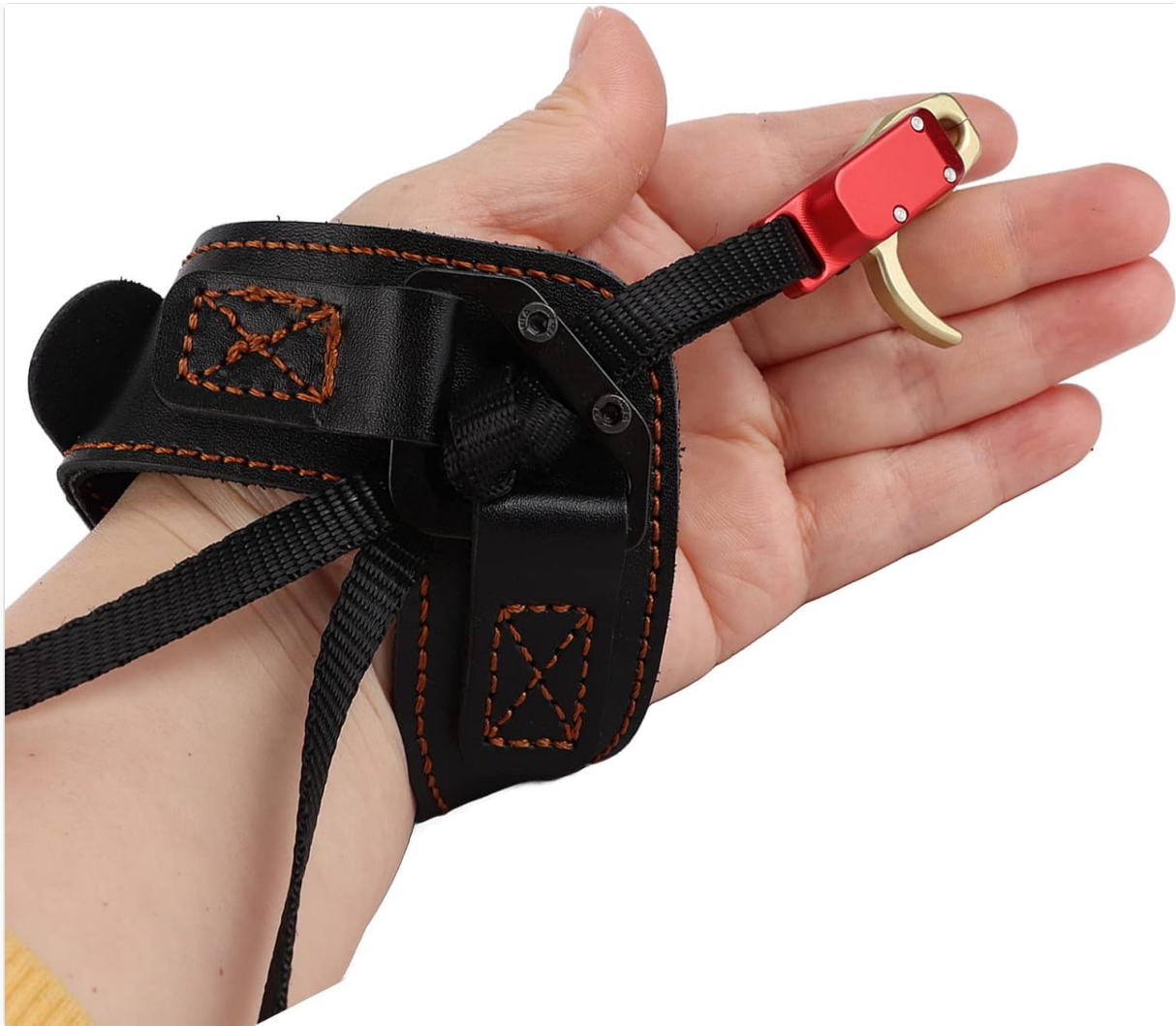
Figure 5.1: The wrist release properly positioned on the hand, demonstrating how it is worn during use.