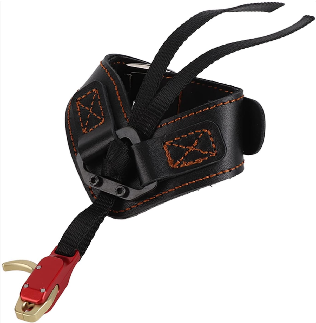
Figure 2.1: Mokernali Adjustable Wrist Release, showing the overall design and components.