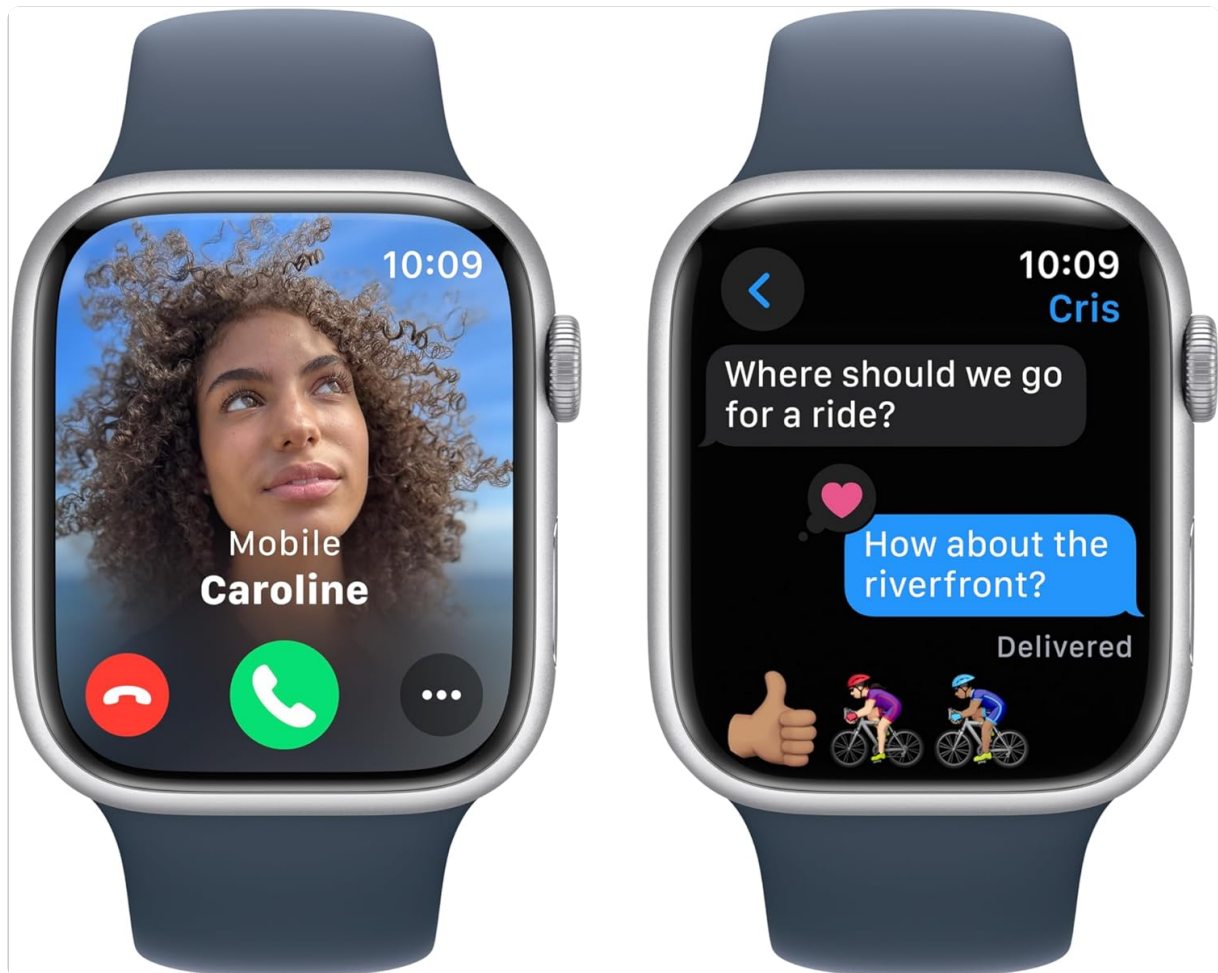
Figure 4: The Apple Watch Series 9 displaying an incoming call and a text message conversation, illustrating its communication features.