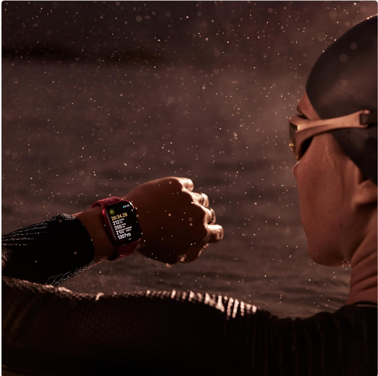
Figure 3: The Apple Watch Series 9 tracking a swimming workout, highlighting its water resistance and fitness capabilities.