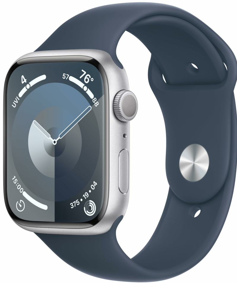
Figure 1: Apple Watch Series 9 with a digital watch face showing various complications.