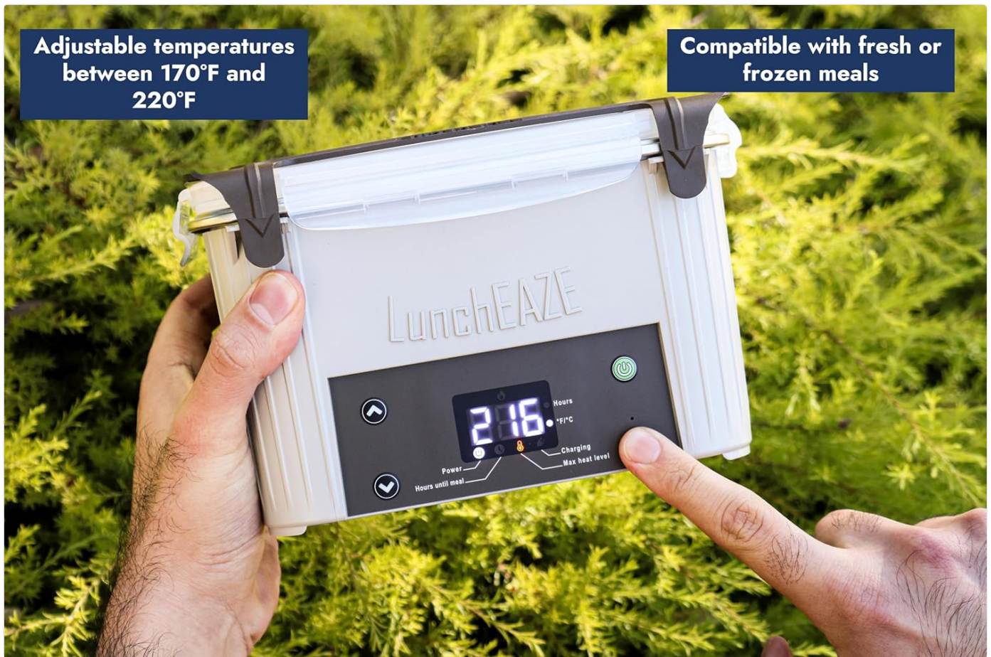
Figure 4: The LunchEAZE Core display showing the heating temperature.

temperature to ensure food is thoroughly heated without overcooking.