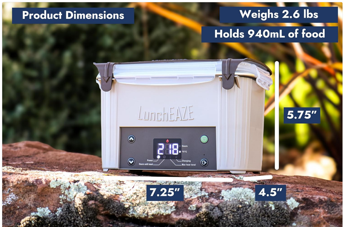
Figure 2: The LunchEAZE Core unit shown alongside its stainless steel meal container.