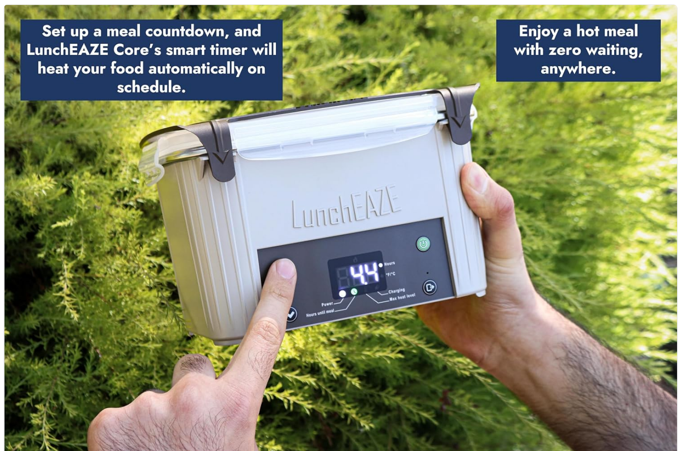
Figure 3: Adjusting the 'Hours until meal' setting on the LunchEAZE Core's display.